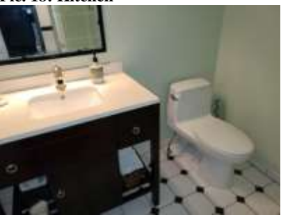
Pic. 21: Powder room