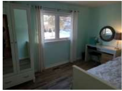
Pic. 9: Bed 2