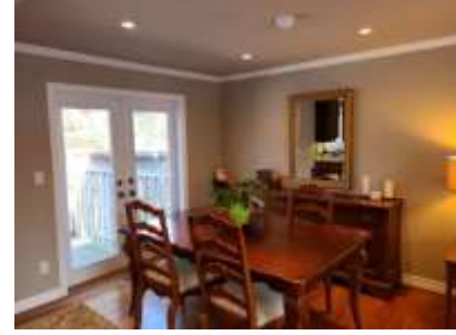
Pic. 17: Dining room