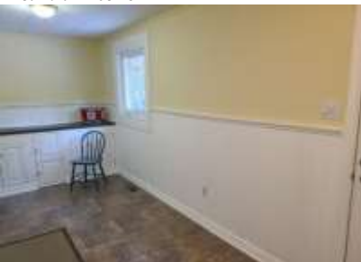
Pic. 22: Mud room