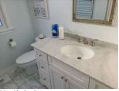
Pic. 12: Bathroom