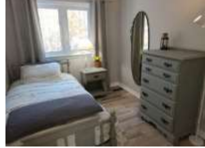
Pic. 11: Bed 4