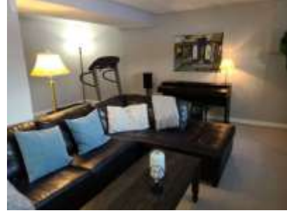
Pic. 23: Rec room