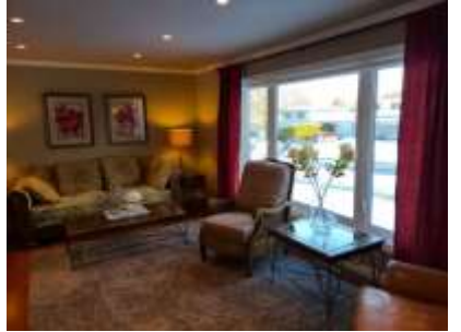
Pic. 16: Living room