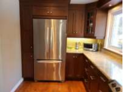
Pic. 19: Kitchen