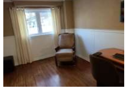
Pic. 20: Den