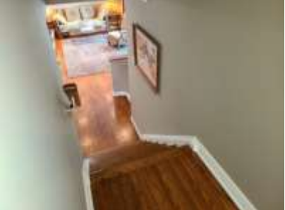
Pic. 15: Handrailing advised for stairwell