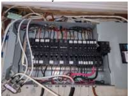
Pic. 27: 100 amp breaker panel