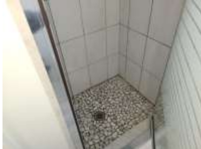
Pic. 14: Bathroom