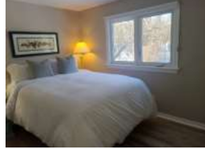
Pic. 8: Master bedroom