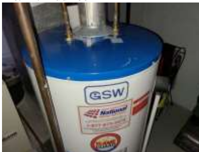
Pic. 25: Rental hot water tank