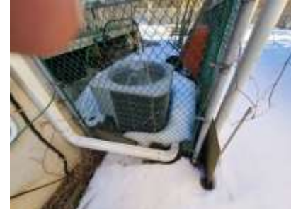
Pic. 5: AC unit 2014