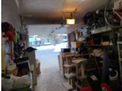
Pic. 28: Garage