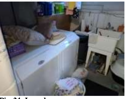
Pic. 24: Laundry