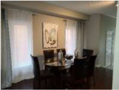
Pic. 22: Dining room