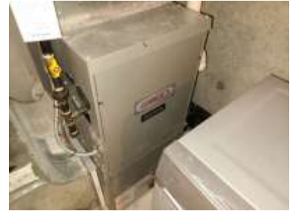
Pic. 336: Gas furnace 2009