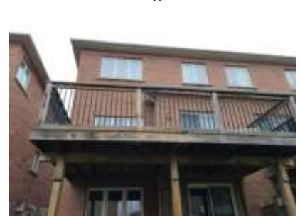
Pic. 6: Back view