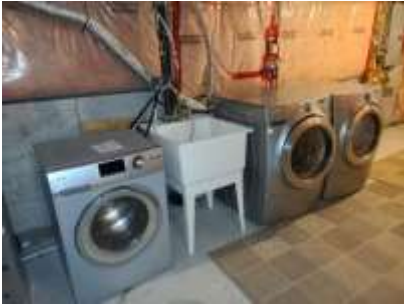
Pic. 314: Laundry