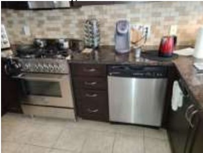
Pic. 235: Kitchen