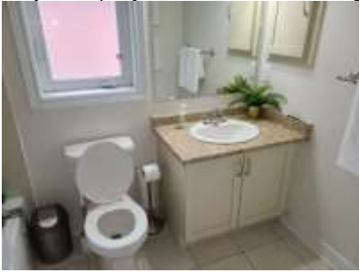
Pic. 16: 2 nd floor bath