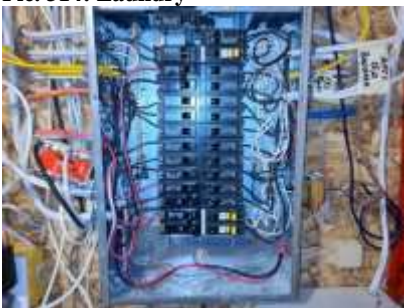
Pic. 347: 100 amp breaker panel