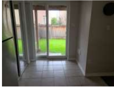
Pic. 292: Basement walk out