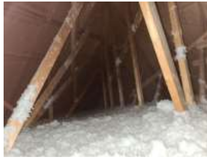
Pic. 8: Attic