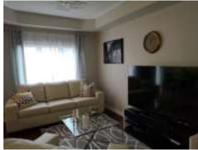
Pic. 20: Living room