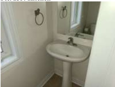
Pic. 268: Powder room