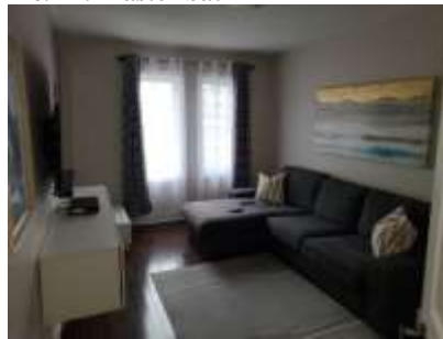
Pic. 14: Bed 3