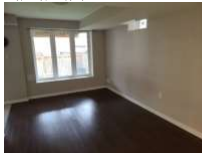
Pic. 279: Basement room