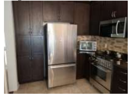
Pic. 24: Kitchen