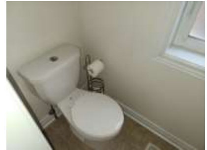
Pic. 257: Powder room