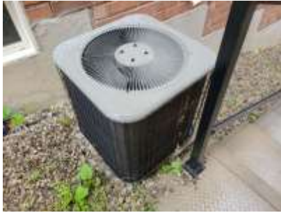
Pic. 4: AC unit 2009