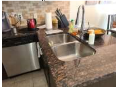
Pic. 246: Kitchen