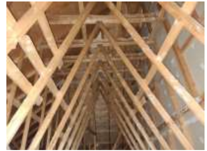
Pic. 9: Attic