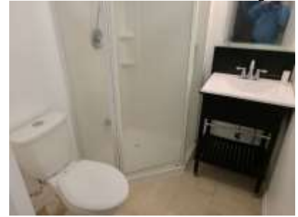
Pic. 303: Basement bath