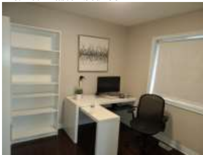
Pic. 13: Bed 2