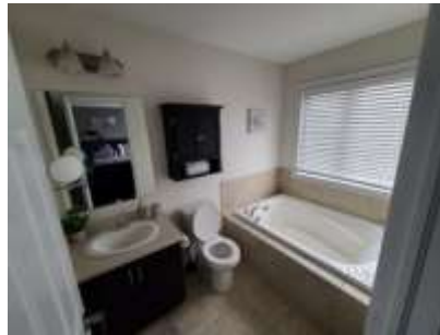
Pic. 11: Master bath