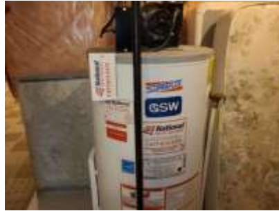
Pic. 325: Rental hot water tank 2011