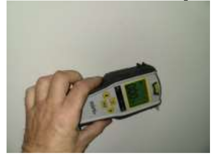
Pic. 18: Water mark on ceiling 0% moisture present