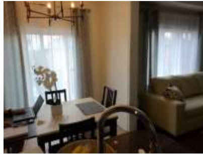
Pic. 23: Eating area