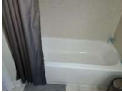
Pic. 17: 2 nd floor bath