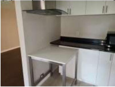
Pic. 281: Basement kitchen