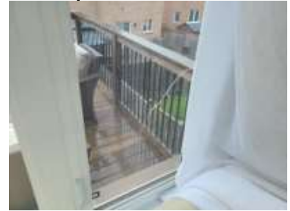
Pic. 21: Cracked window panel in living room