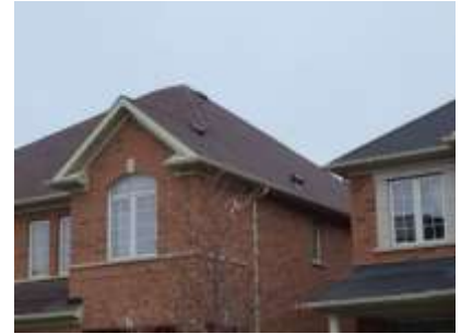
Pic. 3: Roof covering