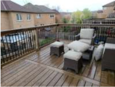
Pic. 19: Balcony