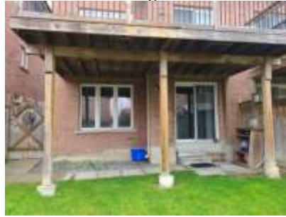
Pic. 5: Back view