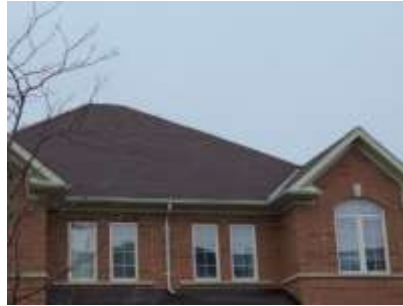
Pic. 2: Roof covering