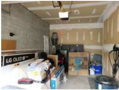
Pic. 7: Garage