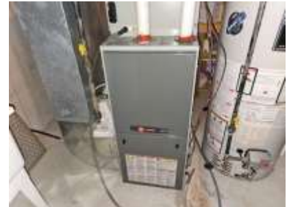
Pic. 27: Gas furnace 2020