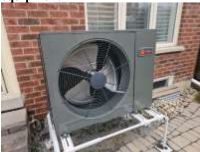
Pic. 7: AC / Heat pump 2021