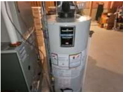
Pic. 28: Water heater 2014