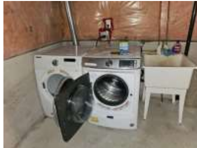
Pic. 26: Laundry