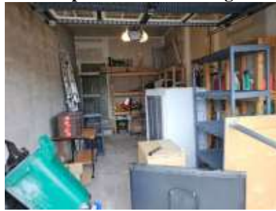
Pic. 5: Garage