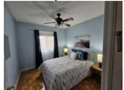
Pic. 15: Bedroom 3