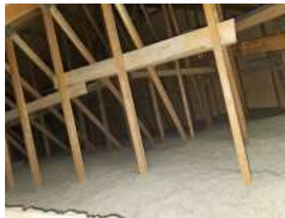
Pic. 8: Attic