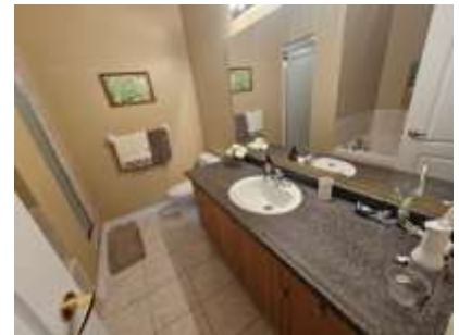
Pic. 12: Primary bathroom