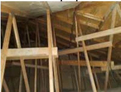
Pic. 10: Attic