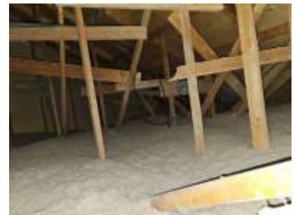
Pic. 9: Attic