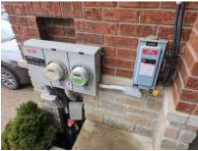
Pic. 4: Solar panel hydro meter / equipment