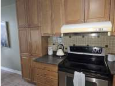
Pic. 22: Kitchen