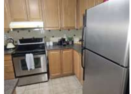
Pic. 21: Kitchen