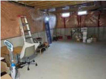
Pic. 25: Basement