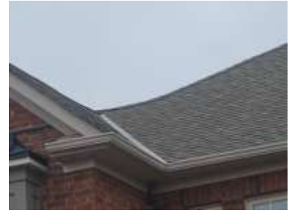
Pic. 3: Updated roof covering