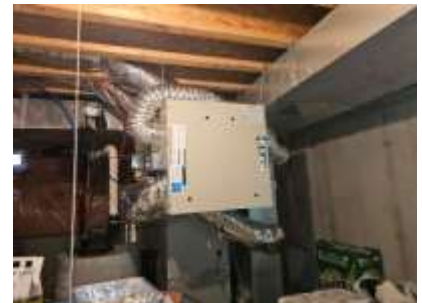
Pic. 30: HRV system