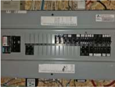
Pic. 31: 200 amp breaker panel