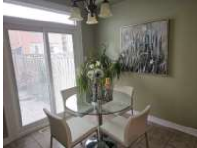
Pic. 20: Eating area