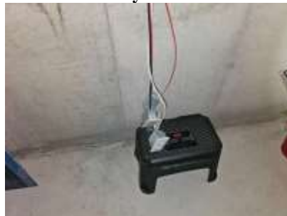
Pic. 29: Loose wires and outlet need to be properly secured