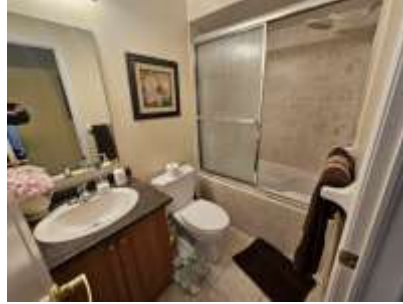
Pic. 17: 2 nd floor bath