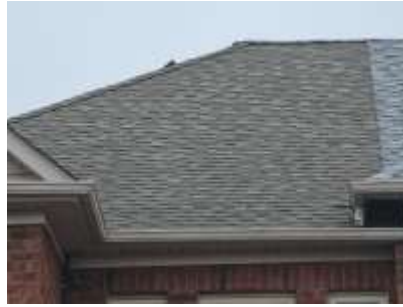
Pic. 2: Updated roof covering