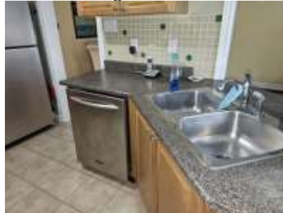
Pic. 23: Kitchen