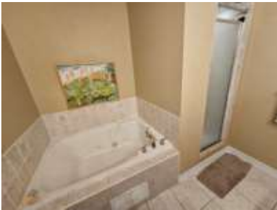
Pic. 13: Primary bathroom