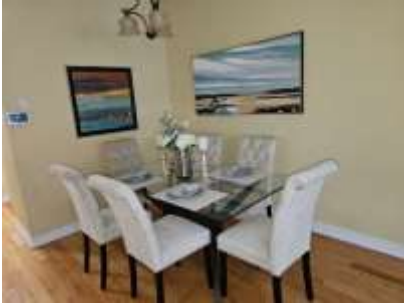
Pic. 19: Dining room