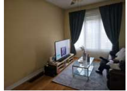
Pic. 18: Living room