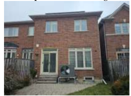
Pic. 6: Back view