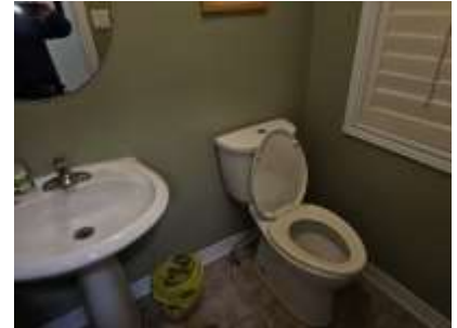
Pic. 24: Powder room