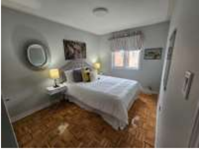
Pic. 16: Bedroom 4