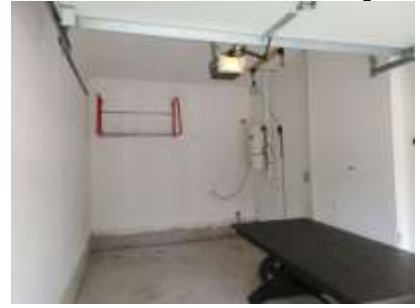
Pic. 33: Garage