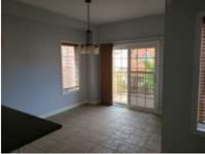
Pic. 19: Eating area