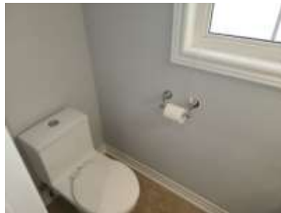
Pic. 23: Powder room