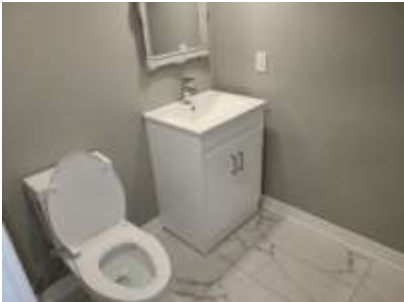
Pic. 28: Basement bath