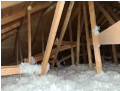
Pic. 7: Attic