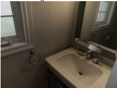
Pic. 22: Powder room