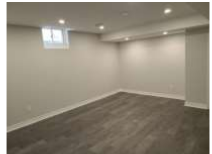
Pic. 24: Basement room