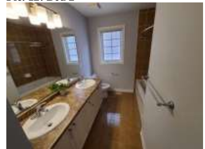
Pic. 15: 2 nd floor bath