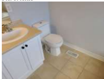
Pic. 11: Master bath