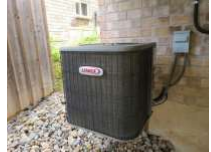
Pic. 6: AC unit 2009