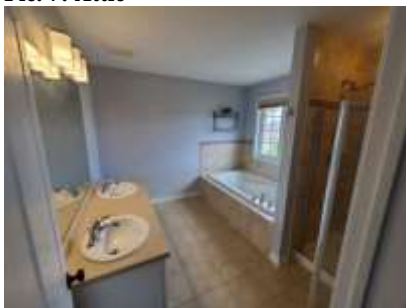
Pic. 10: Master bath