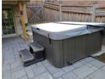
Pic. 5: Hot tub