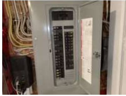
Pic. 32: 200 amp breaker panel