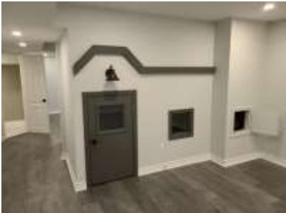
Pic. 25: Basement room