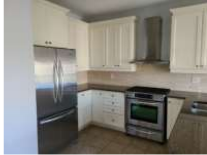
Pic. 20: Kitchen