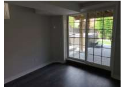
Pic. 27: Basement room