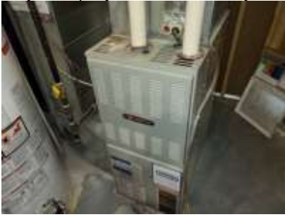
Pic. 31: Gas furnace 2009