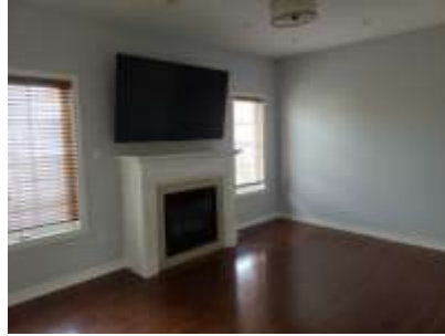
Pic. 17: Family room