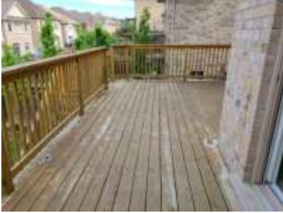
Pic. 16: Deck