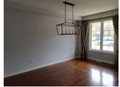
Pic. 18: Living / Dining room