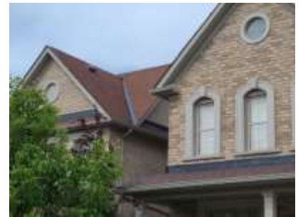
Pic. 3: Roof covering