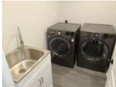
Pic. 29: Laundry