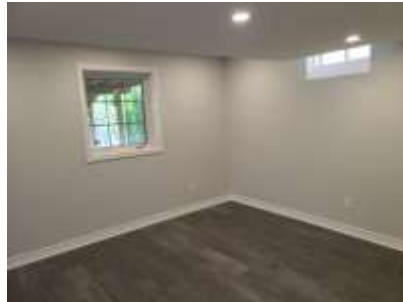
Pic. 26: Basement room