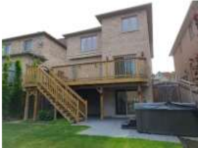
Pic. 4: Back view