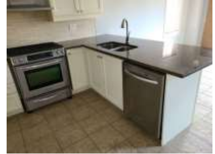
Pic. 21: Kitchen