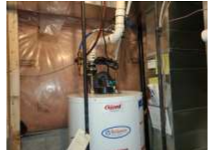
Pic. 30: Rental hot water tank