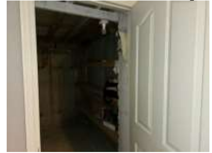
Pic. 48: Cold room door should be a solid core or insulated door