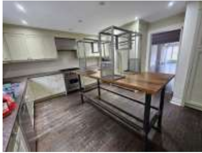
Pic. 32: Kitchen