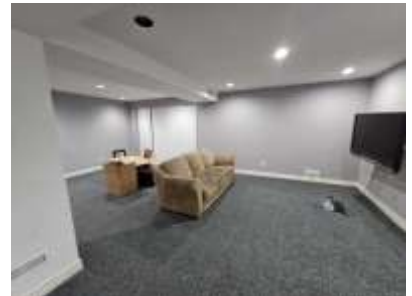
Pic. 39: Rec room