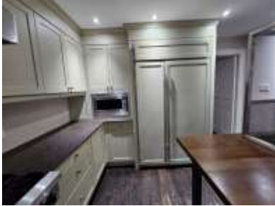
Pic. 34: Kitchen