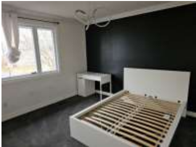
Pic. 22: Bedroom 4