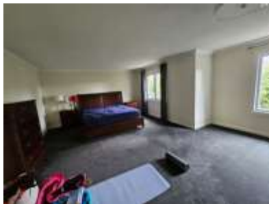
Pic. 14: Primary bedroom