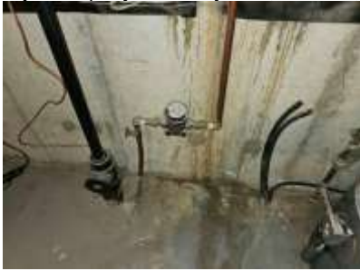
Pic. 46: Water main