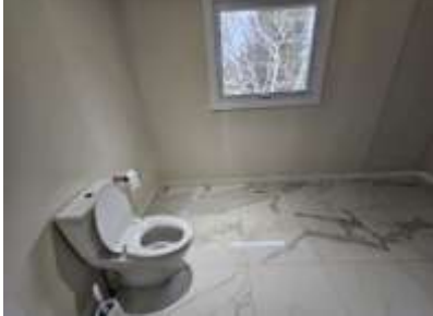
Pic. 16: Primary bathroom