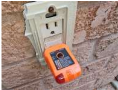
Pic. 8: Rear GFCI outlet needs replacement