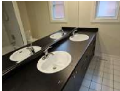
Pic. 23: 2nd floor bathroom