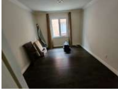
Pic. 35: Office