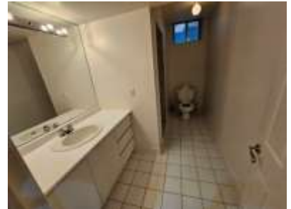
Pic. 42: Basement bathroom