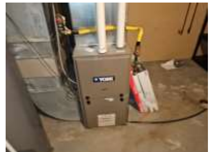
Pic. 45: Gas furnace 2018