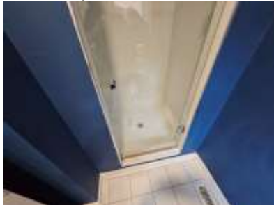
Pic. 20: Ensuite