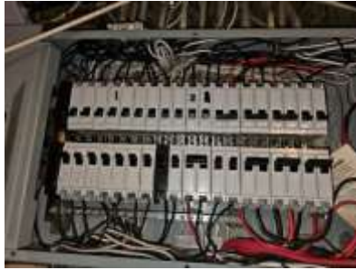
Pic. 47: 200 amp breaker panel