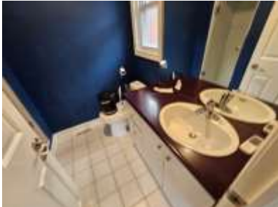
Pic. 19: Ensuite