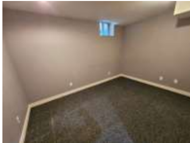
Pic. 41: Bedroom 5