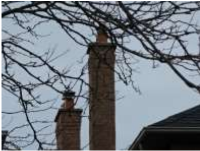
Pic. 4: Chimney