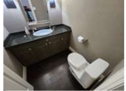
Pic. 36: Powder room