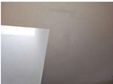
Pic. 25: Old water damage around skylight, no active moisture present