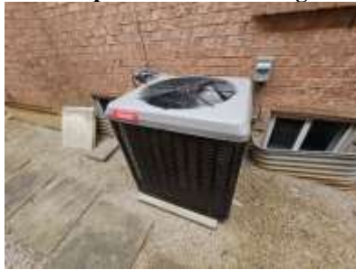
Pic. 5: AC unit 2017