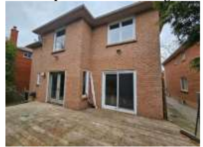
Pic. 6: Back view