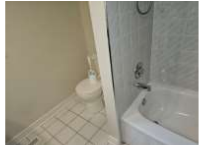
Pic. 24: 2nd floor bathroom