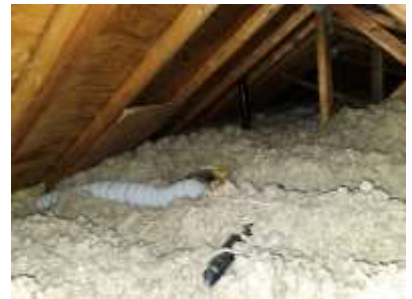
Pic. 12: Attic