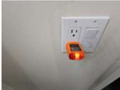
Pic. 17: Bathroom outlets wired incorrectly