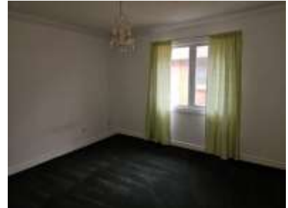
Pic. 21: Bedroom 3