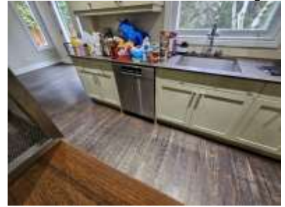
Pic. 33: Kitchen