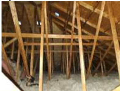
Pic. 11: Attic