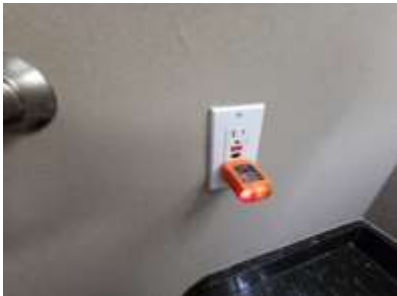
Pic. 37: Outlet wired incorrectly