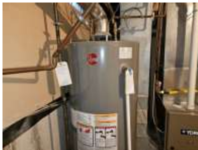
Pic. 44: Rental hot water tank 2015