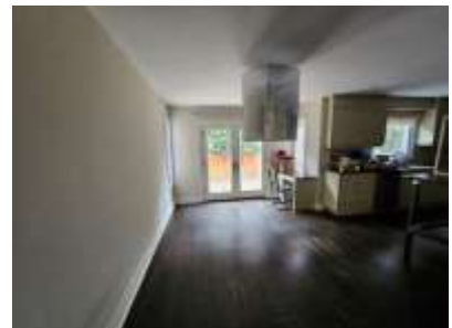
Pic. 30: Eating area