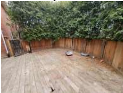
Pic. 7: Rear deck, some boards need replacement