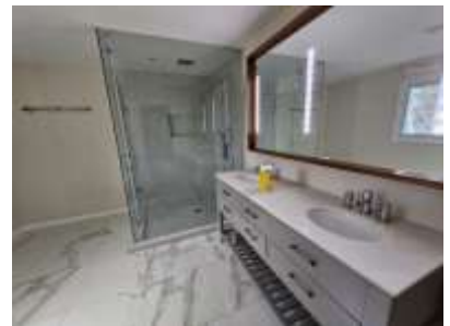
Pic. 15: Primary bathroom