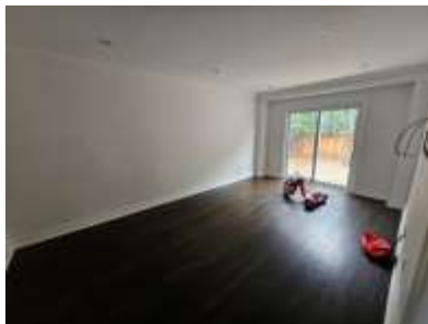
Pic. 29: Family room