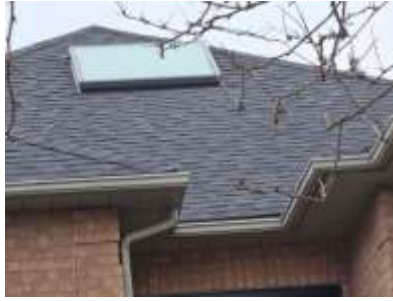
Pic. 2: Updated roof covering