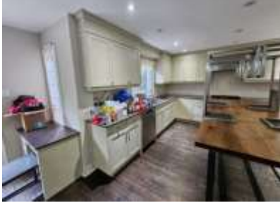
Pic. 31: Kitchen