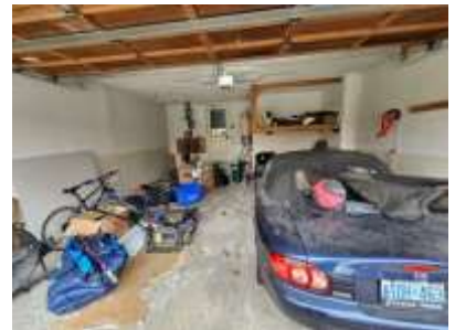
Pic. 9: Garage