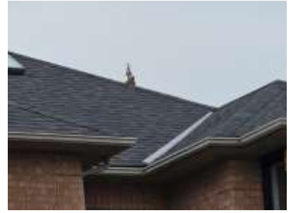
Pic. 3: Updated roof covering