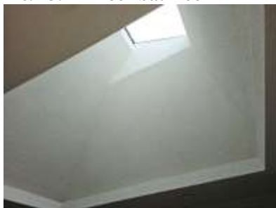
Pic. 26: Skylight