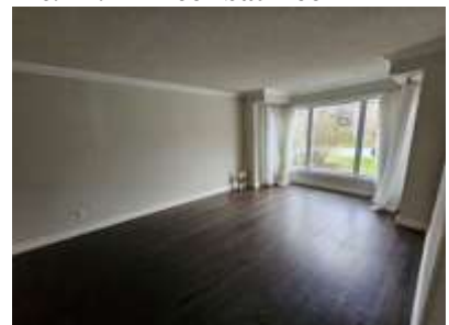
Pic. 27: Living room