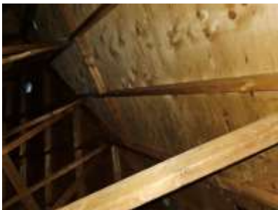
Pic. 13: Attic