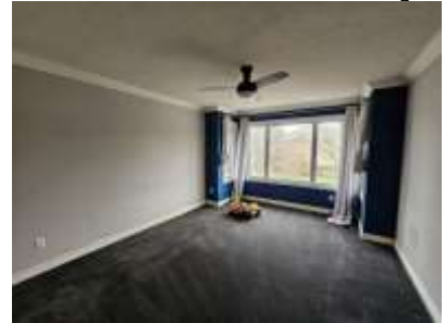
Pic. 18: Bedroom 2