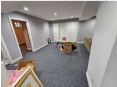
Pic. 40: Rec room