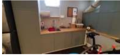
Pic. 23: Laundry