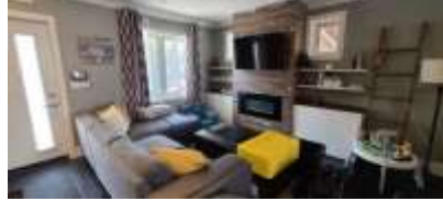
Pic. 14: Living room