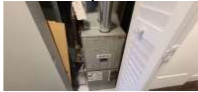
Pic. 26: Gas furnace 2007