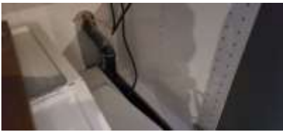
Pic. 28: Sump pump access blocked