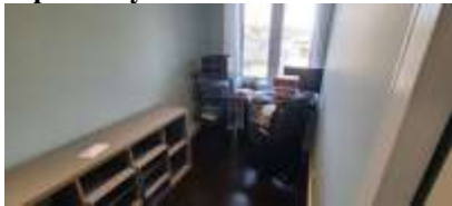
Pic. 10: Bedroom 3