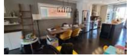
Pic. 15: Dining room