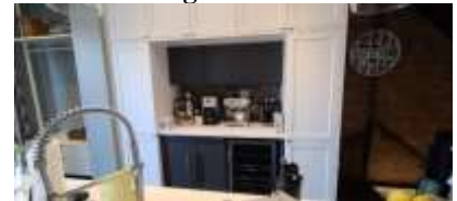
Pic. 18: Kitchen