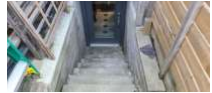
Pic. 6: Exterior basement entrance – missing a handrailing