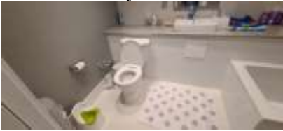
Pic. 25: Basement bath