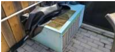
Pic. 7: AC unit past its normal life expectancy