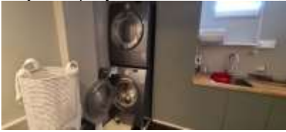
Pic. 22: Laundry