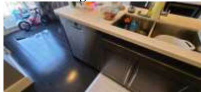
Pic. 17: Kitchen