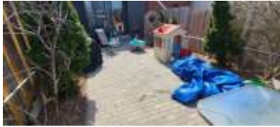
Pic. 4: Patio