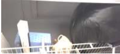
Pic. 13: Access to attic blocked