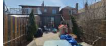
Pic. 3: Back view