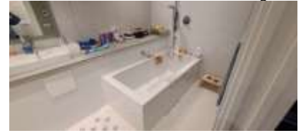
Pic. 24: basement bath