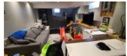
Pic. 21: Rec room