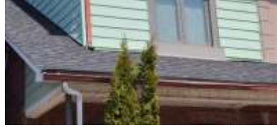
Pic. 2: Updated roof covering