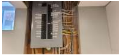
Pic. 29: 100 amp updated breaker pane and wiring