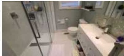
Pic. 11: 2 nd floor bath