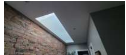
Pic. 12: Skylight