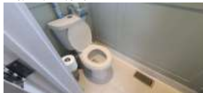
Pic. 20: Powder room