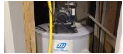
Pic. 27: Hot water tank 2013