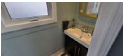
Pic. 19: Powder room