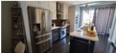
Pic. 16: Kitchen