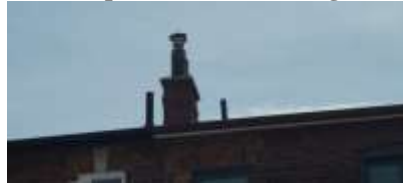
Pic. 5: Chimney