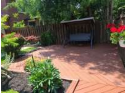
Pic. 4: Rear decking