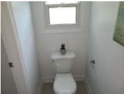
Pic. 22: Powder room