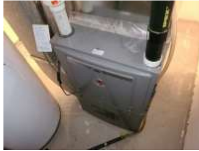
Pic. 32: Gas furnace 2017