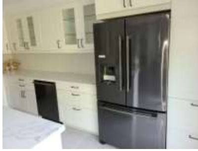
Pic. 17: Kitchen