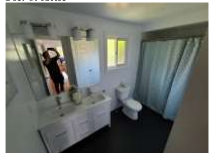
Pic. 9: Master bath