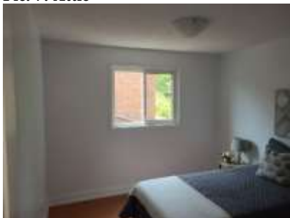
Pic. 10: Bed 2