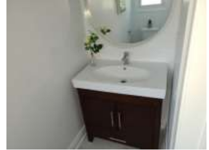
Pic. 21: Powder room