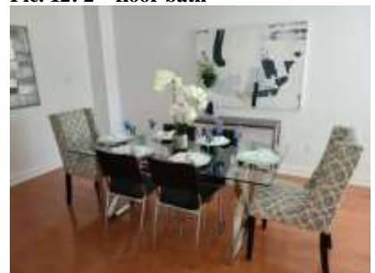
Pic. 15: Dining room