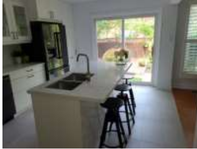
Pic. 20: Kitchen