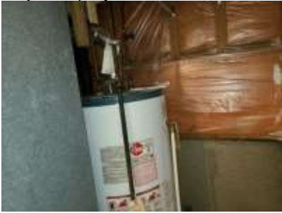
Pic. 31: Hot water tank 2005