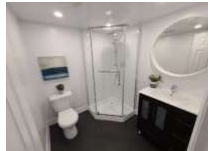
Pic. 27: Basement bath