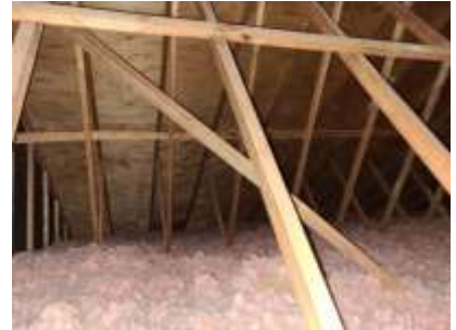
Pic. 6: Attic