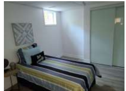
Pic. 24: Bed 4