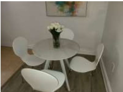
Pic. 25: Basement eating area