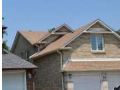
Pic. 2: Roof covering