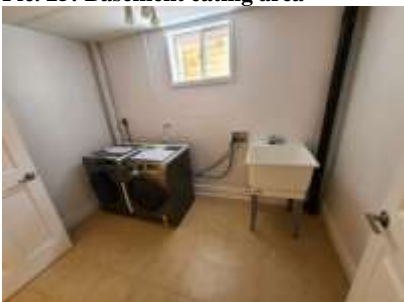
Pic. 28: Laundry