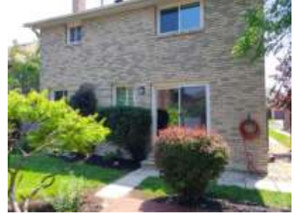
Pic. 3: Back vie