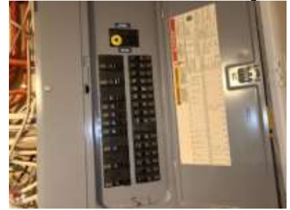
Pic. 33: 100 amp breaker panel