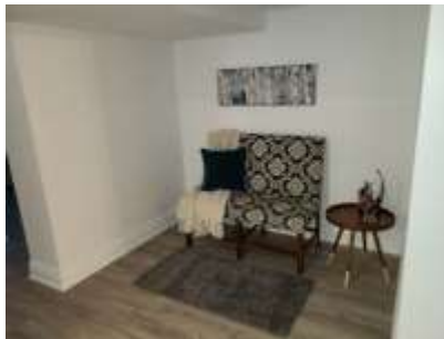
Pic. 23: Basement living room