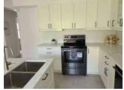
Pic. 18: Kitchen