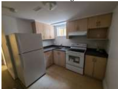
Pic. 26: Basement kitchen