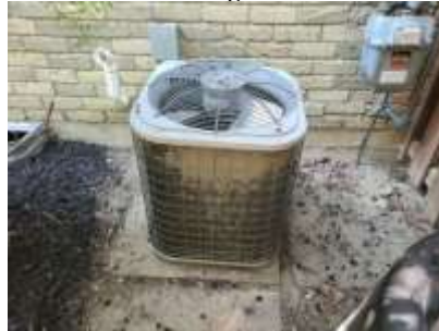
Pic. 5: AC unit 2009 – dirty