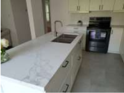
Pic. 19: Kitchen