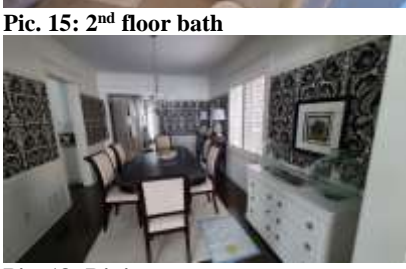
Pic. 18: Dining room