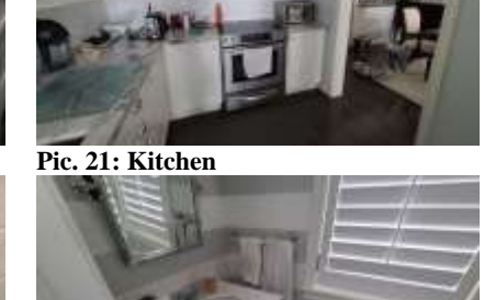
Pic. 24: Powder room