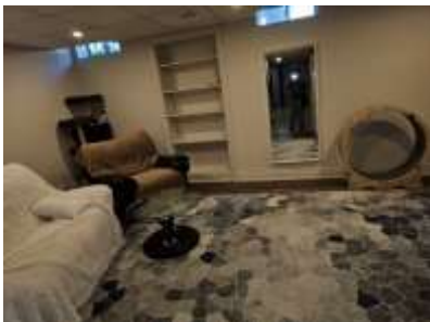
Pic. 28: Rec room