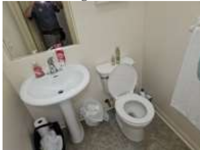
Pic. 26: Powder room