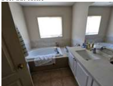
Pic. 14: Primary bathroom