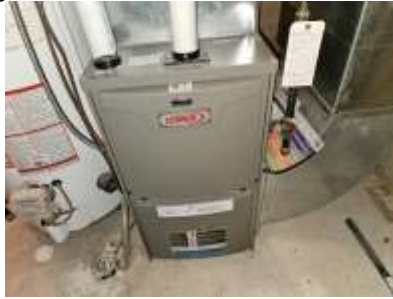
Pic. 32: Gas furnace