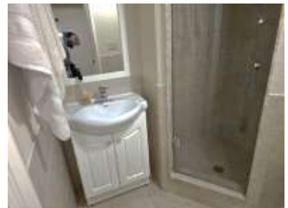
Pic. 30: Basement bathroom