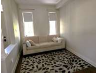
Pic. 20: Living room