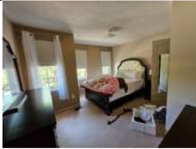
Pic. 17: Bedroom 3