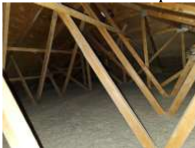
Pic. 11: Attic