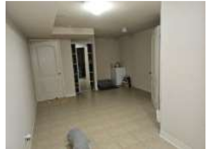
Pic. 27: Rec room