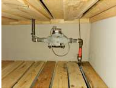
Pic. 35: Water main