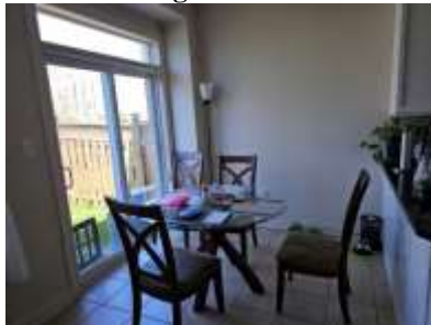
Pic. 23: Eating area