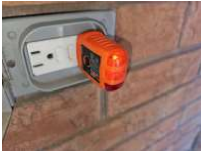
Pic. 4: Front GFCI wont trip