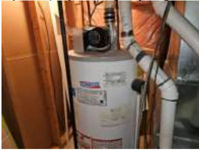
Pic. 31: Rental hot water heater