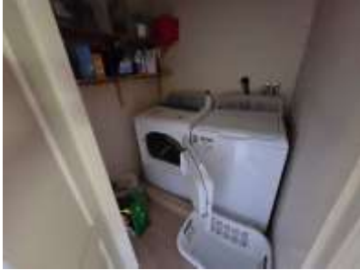
Pic. 19: Laundry