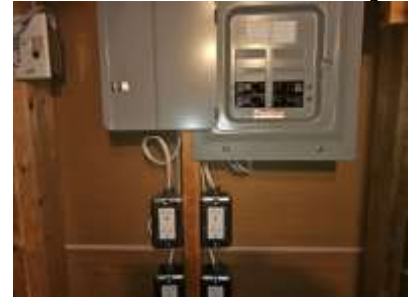
Pic. 33: Generator pony panel