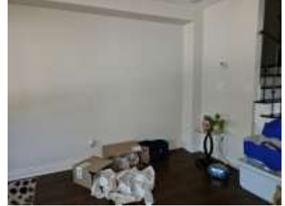
Pic. 21: Dining room