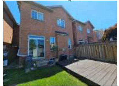
Pic. 6: Back view