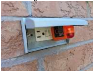
Pic. 8: Rear GFCI won't trip