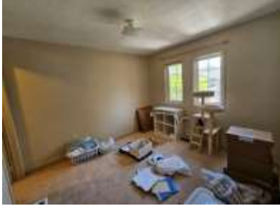
Pic. 16: Bedroom 2