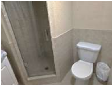
Pic. 29: Basement bathroom