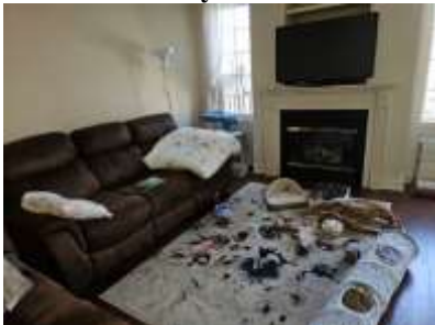
Pic. 22: Family room