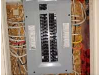
Pic. 34: 100 amp breaker panel