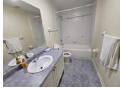
Pic. 18: 2 nd floor bathroom