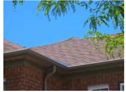
Pic. 3: Roof covering