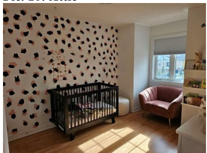
Pic. 13: Bedroom 2