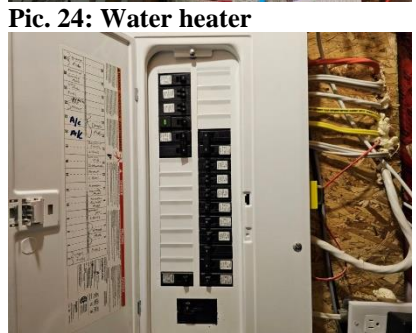
Pic. 27: 100 amp breaker panel