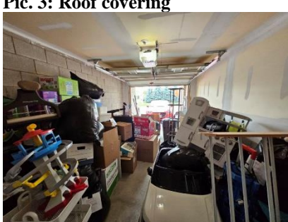
Pic. 6: Garage