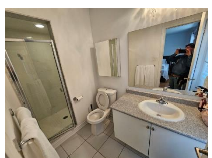
Pic. 12: Master bath