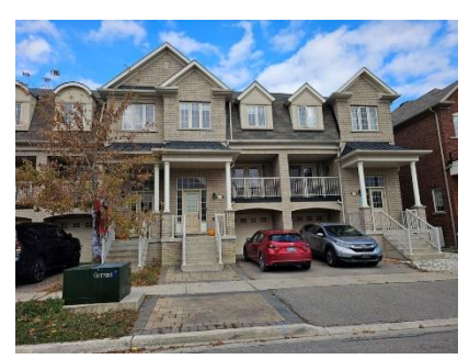
Pic. 1: Front view