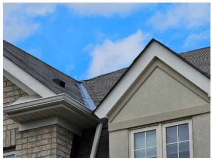
Pic. 3: Roof covering