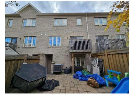
Pic. 4: Back view