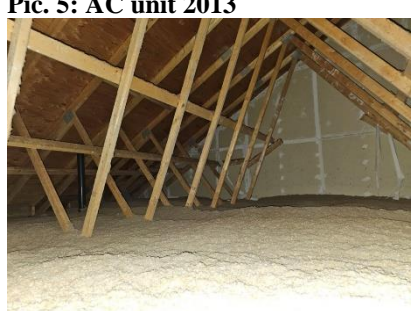
Pic. 8: Attic