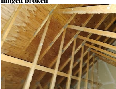
Pic. 10: Attic