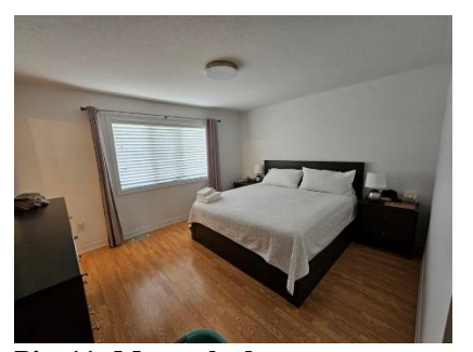
Pic. 11: Master bedroom