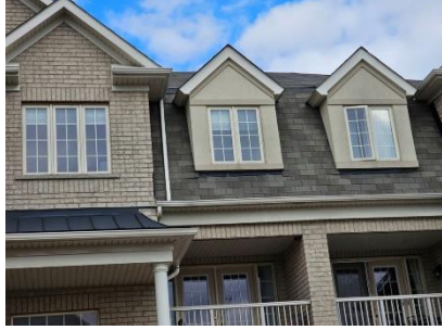
Pic. 2: Roof covering