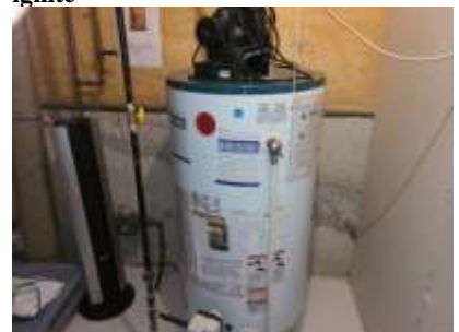
Pic. 30: Rental hot water tank