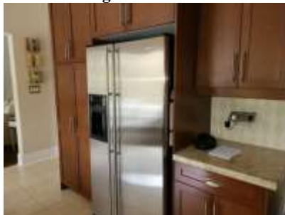
Pic. 26: Kitchen