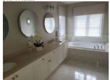
Pic. 9: Master bath