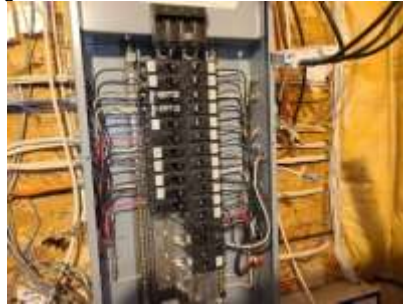
Pic. 32: 200 amp breaker panel with all copper wire