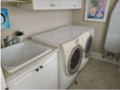
Pic. 19: Laundry