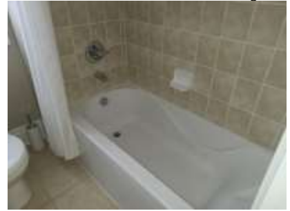
Pic. 18: 2 nd floor bath