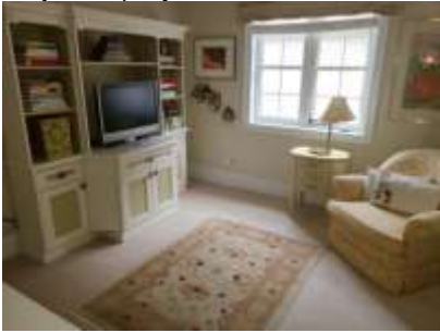
Pic. 16: Bed 4