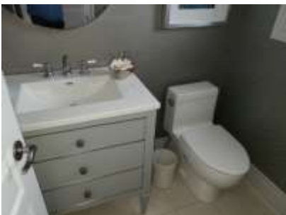
Pic. 28: Powder room