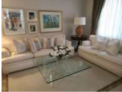
Pic. 20: Living room