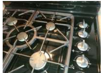
Pic. 27: Stove center burner will not ignite