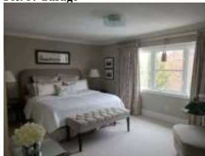
Pic. 8: Master bedroom