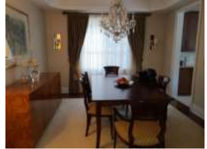
Pic. 21: Dining room