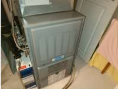
Pic. 31: Original gas furnace