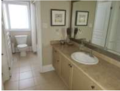
Pic. 17: 2 nd floor bath