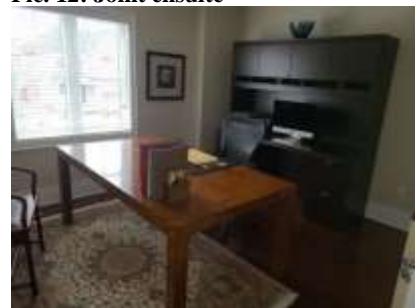
Pic. 15: Bed 3