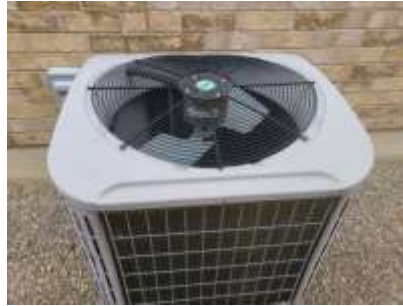
Pic. 2: Original AC unit