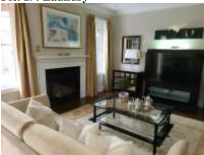
Pic. 22: Family room