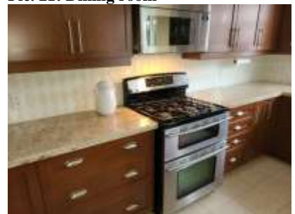
Pic. 24: Kitchen