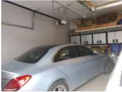
Pic. 4: Garage