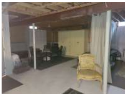
Pic. 29: Unfinished basement