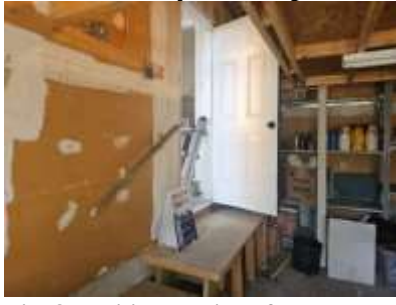
Pic. 8: Railing advised for entry landing in garage