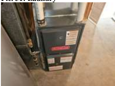
Pic. 34: Gas furnace 2019