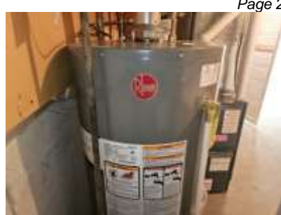
Pic. 33: Water heater 2025