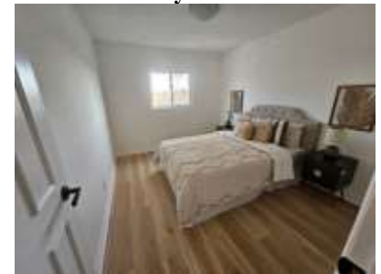
Pic. 19: Bedroom 3