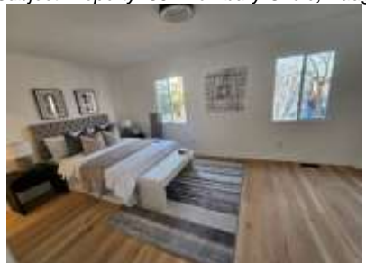
Pic. 16: Primary bedroom