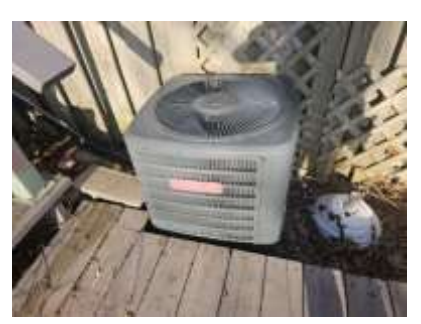
Pic. 12: AC compressor 2018