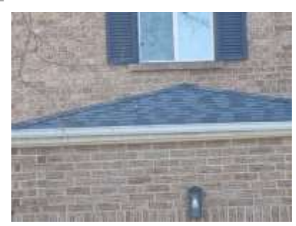
Pic. 3: Updated roof covering