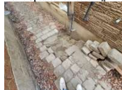
Pic. 5: Walkway needs repair