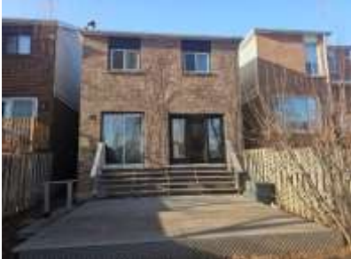
Pic. 10: Back view