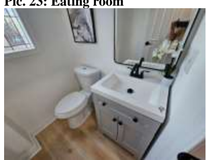
Pic. 26: Powder room