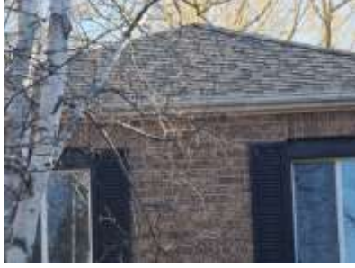
Pic. 2: Updated roof covering