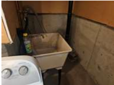
Pic. 32: Laundry