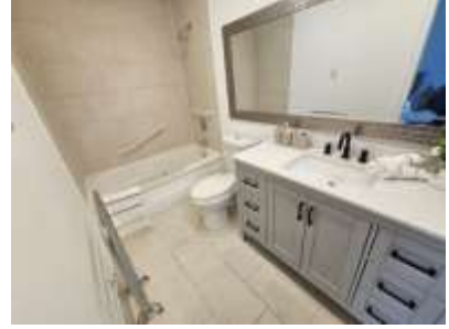
Pic. 17: Primary bathroom