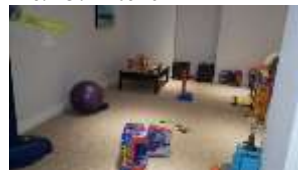
Pic. 27: Rec room