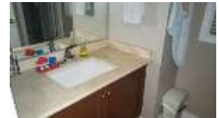
Pic. 16: 2 nd floor bath