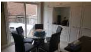
Pic. 21: Eating area