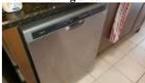
Pic. 25: Kitchen