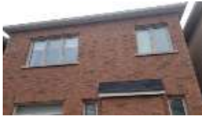
Pic. 5: Back view