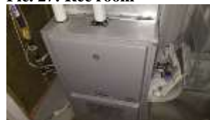
Pic. 31: Gas furnace