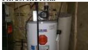
Pic. 30: Rental hot water tank