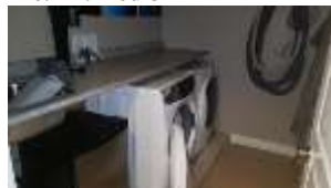
Pic. 18: Laundry