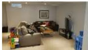
Pic. 26: Rec room