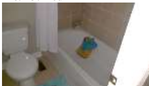
Pic. 17: 2 nd floor bath