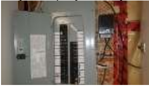
Pic. 33: 100 amp breaker panel