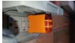
Pic. 3: Exterior GFCI needs replacement