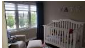
Pic. 14: Bed 3