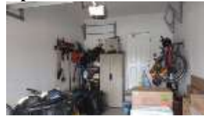
Pic. 7: Garage