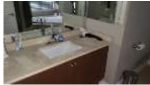
Pic. 10: Master bath