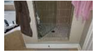
Pic. 12: Master bath