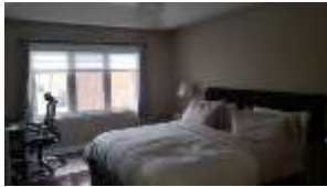
Pic. 9: Master bedroom