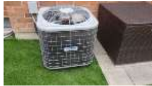
Pic. 6: AC unit