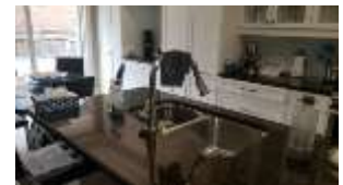
Pic. 24: Kitchen