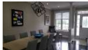
Pic. 19: Living / Dining room