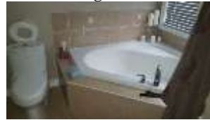
Pic. 11: Master bath