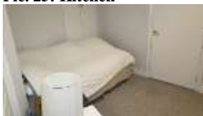
Pic. 29: Bed 5 / Basement room