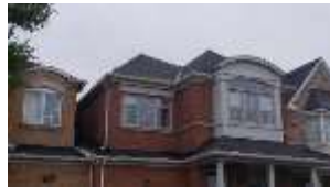
Pic. 2: Roof covering