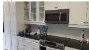
Pic. 23: Kitchen