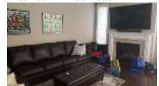
Pic. 20: Family room