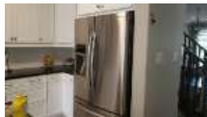
Pic. 22: Kitchen