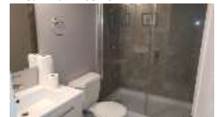
Pic. 28: Basement bath