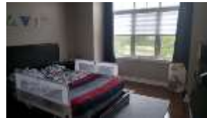
Pic. 15: Bed 4