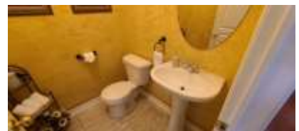
Pic. 21: Powder room