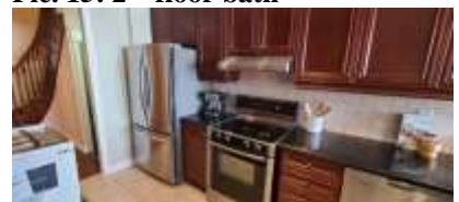
Pic. 18: Kitchen