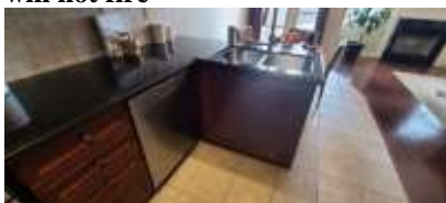
Pic. 19: Kitchen