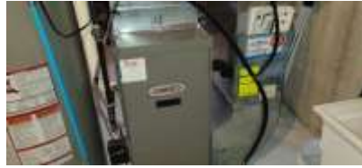
Pic. 29: Original gas furnace