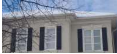
Pic. 2: Original roof covering – completely snow covered