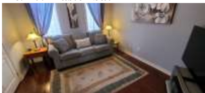
Pic. 13: Bedroom 3