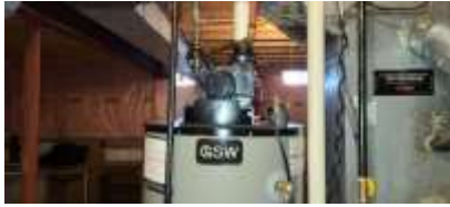
Pic. 28: Rental hot water tank 2020