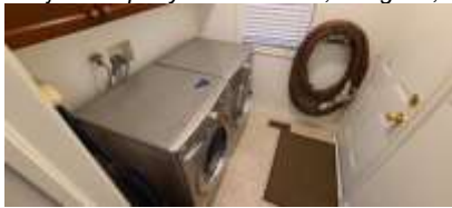
Pic. 22: Laundry