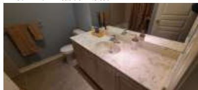
Pic. 14: 2nd floor bath