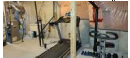
Pic. 24: Basement