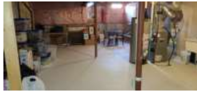
Pic. 23: Basement