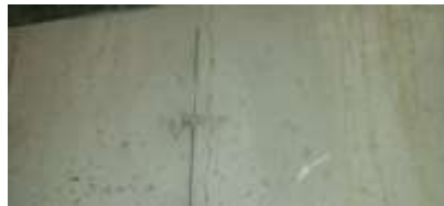
Pic. 26: Typical foundation crack