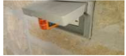
Pic. 3: Exterior GFCI outlets no power – will not reset