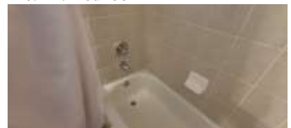
Pic. 15: 2nd floor bath