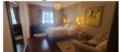
Pic. 9: Master bedroom