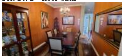
Pic. 17: Dining room