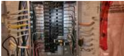
Pic. 31: 100 amp breaker panel