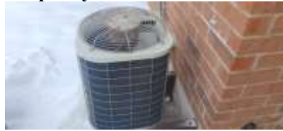
Pic. 5: Original AC unit