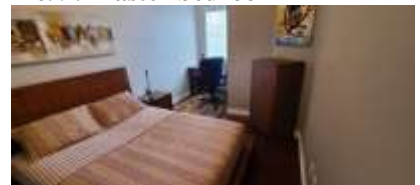
Pic. 12: Bedroom 2