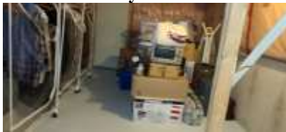
Pic. 25: Basement