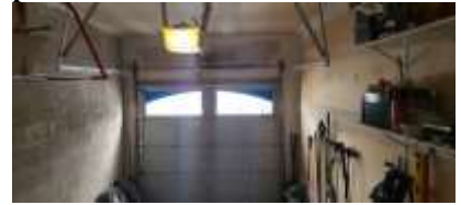
Pic. 6: Garage