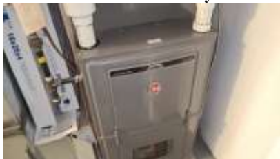
Pic. 31: Gas furnace 2018