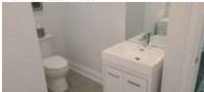
Pic. 10: Joint ensuite