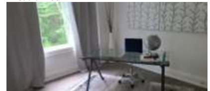
Pic. 12: Bed 3