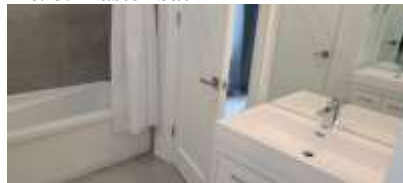
Pic. 11: Joint ensuite