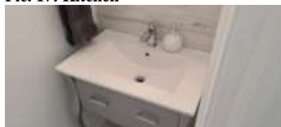
Pic. 20: Powder room