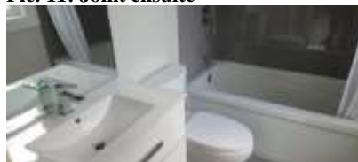
Pic. 14: Ensuite