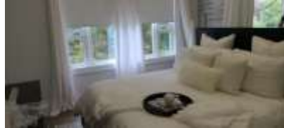
Pic. 5: Master bedroom