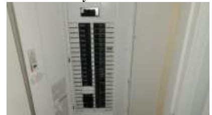
Pic. 33: 200 amp breaker panel