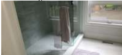
Pic. 7: Master bath