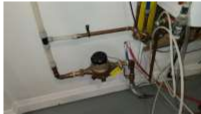
Pic. 29: Water main