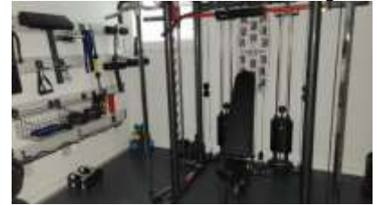
Pic. 24: Basment room