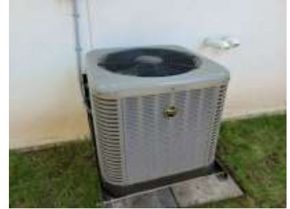
Pic. 3: AC unit 2017