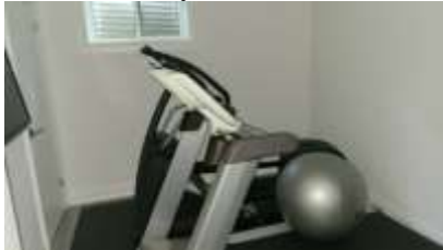
Pic. 25: Bed 5