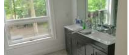
Pic. 6: Master bath