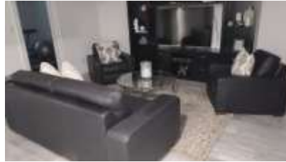
Pic. 23: Rec room