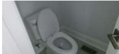
Pic. 8: Master bath