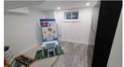
Pic. 27: Bed 6