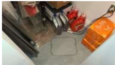
Pic. 32: Back flow preventer and sump pump