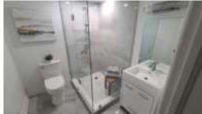
Pic. 26: Basement bath