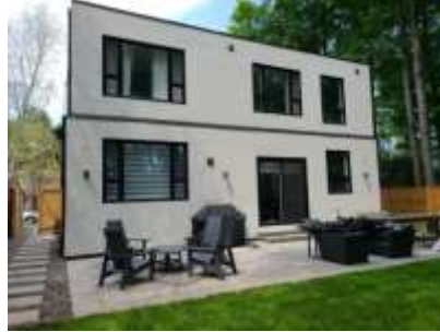
Pic. 2: Back view