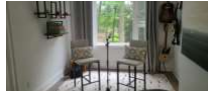
Pic. 9: Bed 2