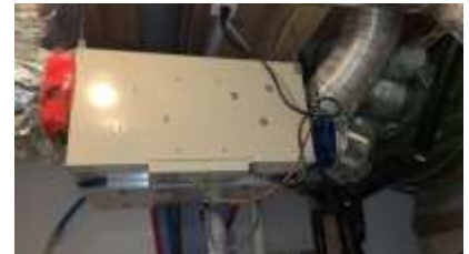
Pic. 30: HRV system