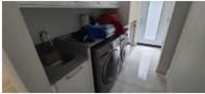
Pic. 22: Laundry