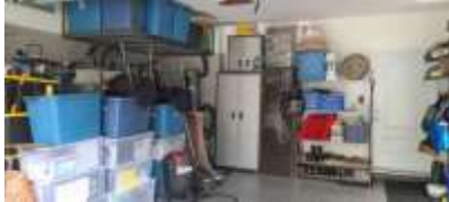
Pic. 4: Garage