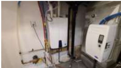
Pic. 28: Tankless hot water system