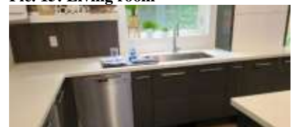
Pic. 18: Kitchen