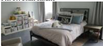
Pic. 13: Bed 4