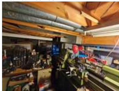
Pic. 29: Crawl space