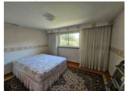
Pic. 9: Bedroom 2