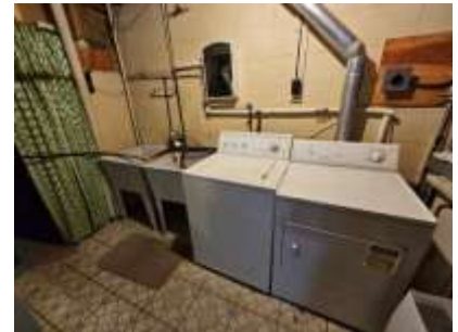
Pic. 27: Laundry