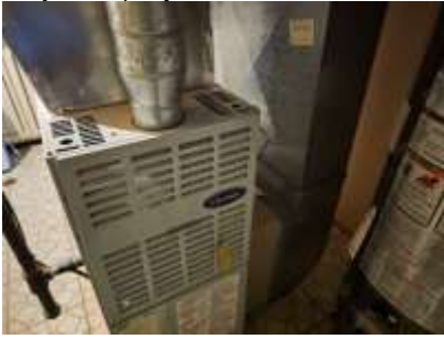
Pic. 31: Gas furnace 1998