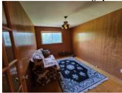
Pic. 23: Bedroom 4