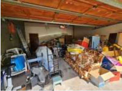
Pic. 34: Garage