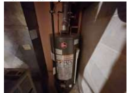
Pic. 30: Hot water tank