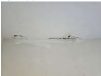
Pic. 10: Old water damage on ceiling of 2 nd bedroom