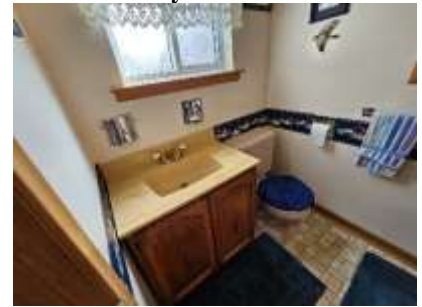
Pic. 24: Ground level bath