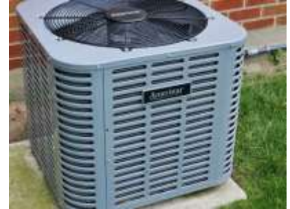
Pic. 6: AC unit 2018