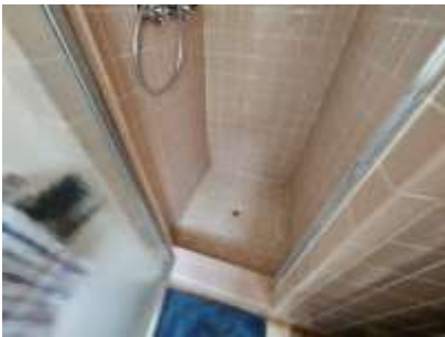
Pic. 25: Ground level bath