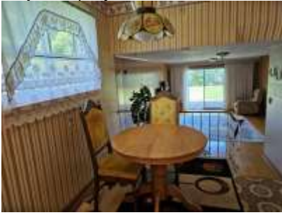
Pic. 16: Eating area