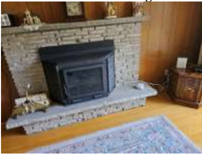
Pic. 22: WETT certificate may be required for insurability of the home