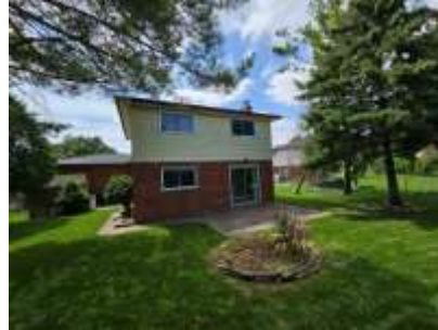
Pic. 5: Back view