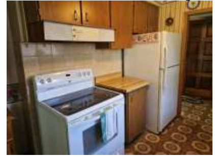
Pic. 18: Kitchen