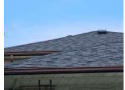
Pic. 3: Updated roof covering