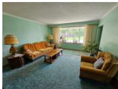
Pic. 14: Living room