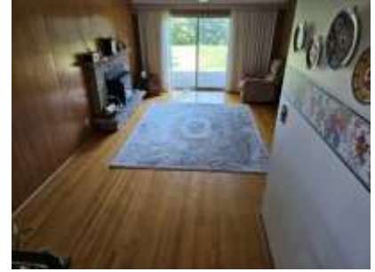
Pic. 21: Family room