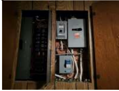
Pic. 32: 100 amp fuse panel