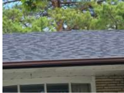
Pic. 2: Updated roof covering