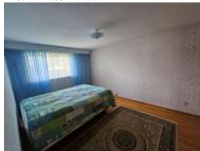
Pic. 8: Master bedroom