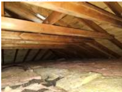
Pic. 7: Attic