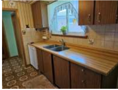
Pic. 17: Kitchen