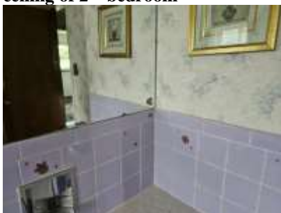
Pic. 13: Main bath