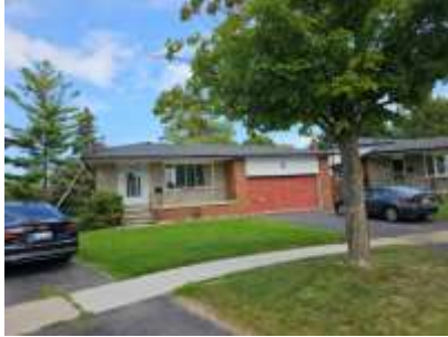
Pic. 1: Front view