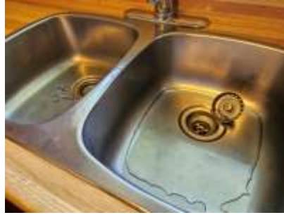
Pic. 20: Sink drain backing up