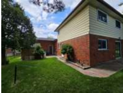
Pic. 4: Sideview