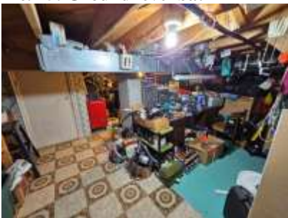
Pic. 28: Crawl space