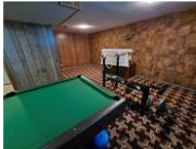
Pic. 26: Rec room