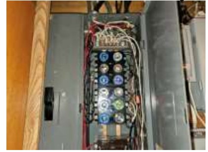
Pic. 33: Some circuits appear over fused