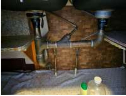
Pic. 19: Sink drain leaking