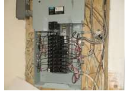
Pic. 30: 100 amp breaker panel with all copper wire