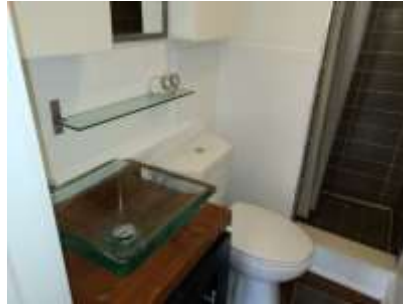
Pic. 14: Main floor unit – Bathroom