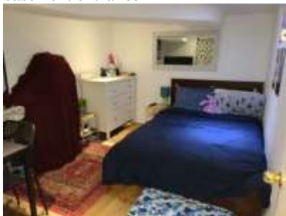
Pic. 22: Basement unit – Master bedroom