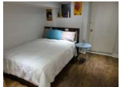
Pic. 24: Basement unit – Bed 2