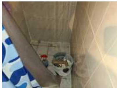
Pic. 26: Basement unit – Bathroom