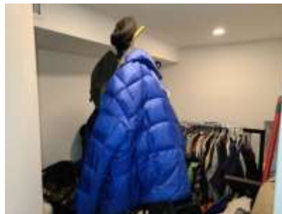
Pic. 23: Basement unit – Room