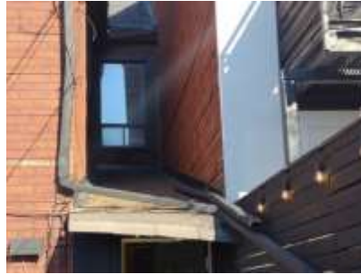
Pic. 17: Rear roof covering nearing the end of its useful life