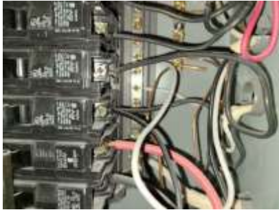
Pic. 31: One breaker double tapped