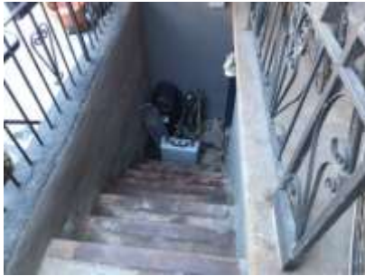
Pic. 19: Handrailing advised for front basement entrance