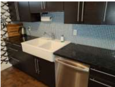
Pic. 10: Main floor unit – Kitchen