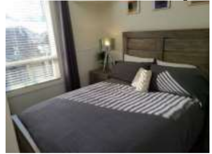
Pic. 15: Main floor unit – Master bedroom