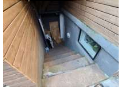
Pic. 18: Handrailing advised for rear basement entrance