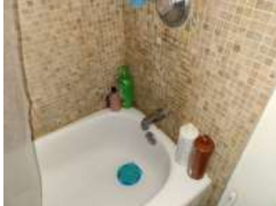
Pic. 5: 2 nd floor unit -Bathroom