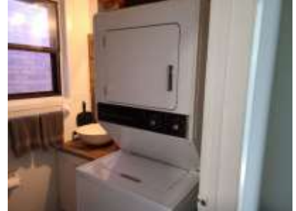
Pic. 6: 2 nd floor unit – Washer & Dryer