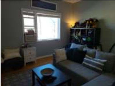
Pic. 7: 2 nd floor unit -Living room