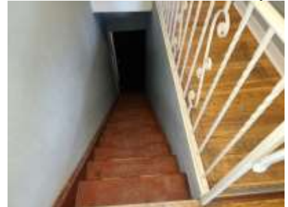
Pic. 9: Handrailing advised for stairwell