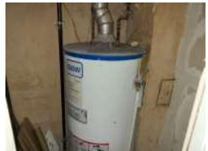
Pic. 27: Rental hot water tank