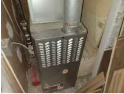
Pic. 28: Gas furnace 2009