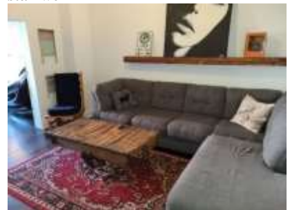
Pic. 12: Main floor unit – Living room