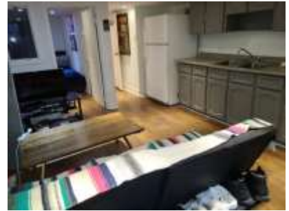
Pic. 21: Basement unit – Living room