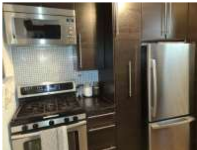
Pic. 11: Main floor unit – Kitchen