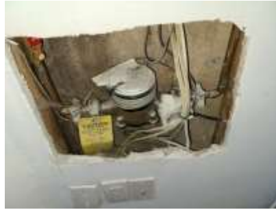
Pic. 29: Water main