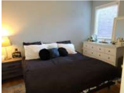
Pic. 8: 2 nd floor unit – Master bedroom