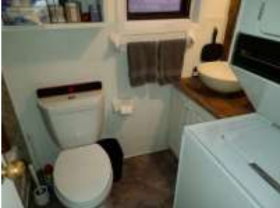
Pic. 4: 2 nd floor unit – Bathroom