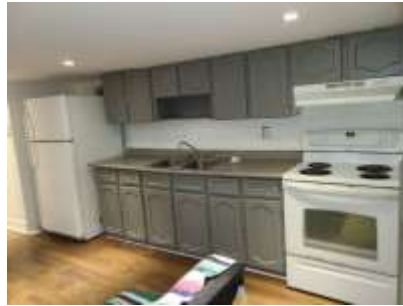
Pic. 20: Basement unit – Kitchen