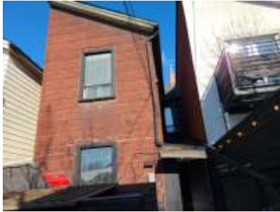
Pic. 16: Back view