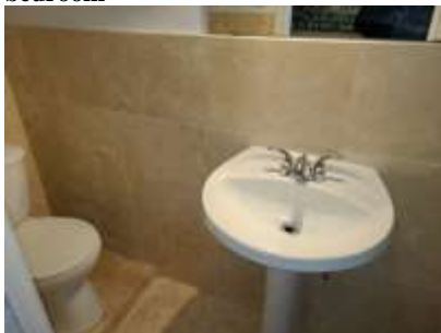
Pic. 25: Basement unit – Bathroom