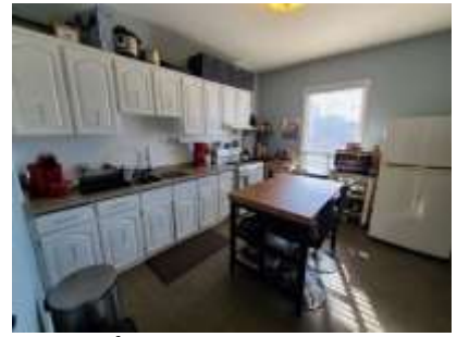
Pic. 3: 2 nd floor unit – Kitchen