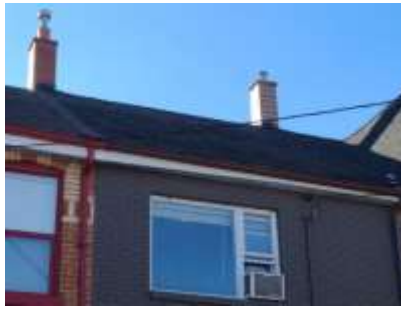
Pic. 2: Updated roof on front