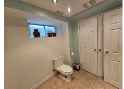
Pic. 21: Basement bathroom