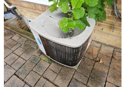
Pic. 6: AC unit 1989