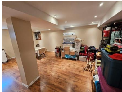
Pic. 23: Basement eating area