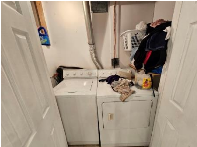
Pic. 22: Laundry