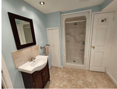
Pic. 20: Basement bathroom