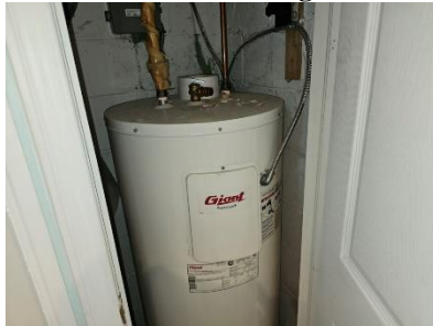
Pic. 26: Hot water tank 2020