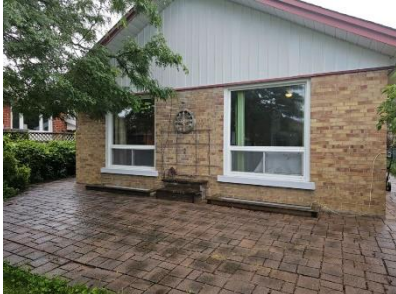
Pic. 4: Back view