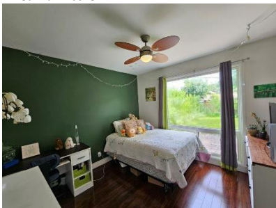
Pic. 10: Bedroom 2