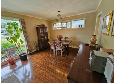
Pic. 16: Dining room