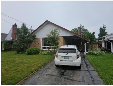
Pic. 1: Front view