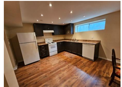
Pic. 24: Basement kitchen