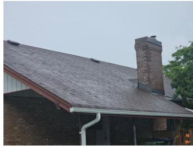
Pic. 2: Roof covering