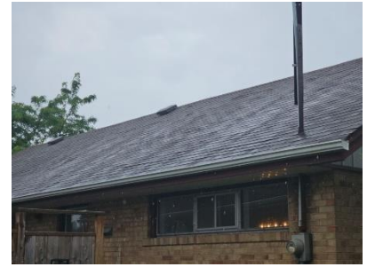
Pic. 3: Roof covering