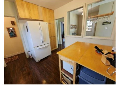
Pic. 18: Kitchen