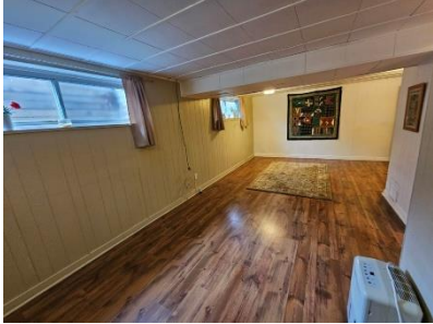
Pic. 19: Rec room