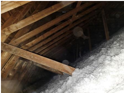
Pic. 7: Attic