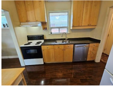
Pic. 17: Kitchen