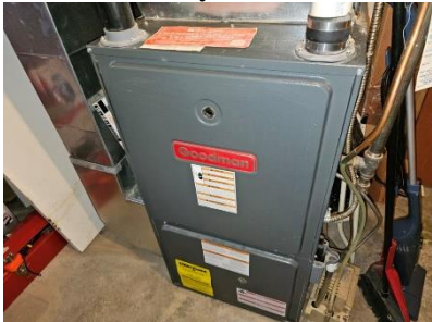
Pic. 25: Gas furnace 2007