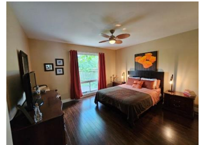
Pic. 9: Primary bedroom