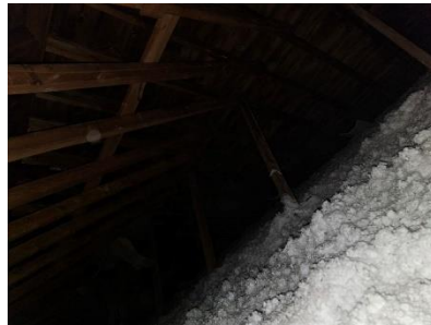
Pic. 8: Attic