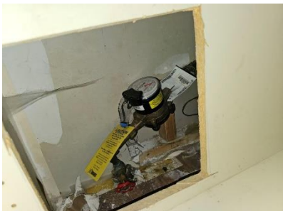
Pic. 28: Water main