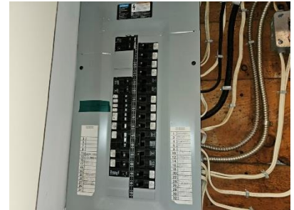
Pic. 27: 100 amp breaker panel