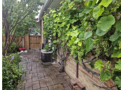
Pic. 5: Side view