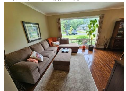
Pic. 15: Living room