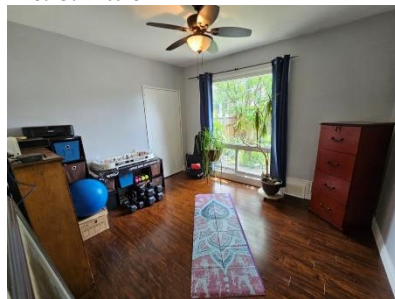
Pic. 11: Bedroom 3