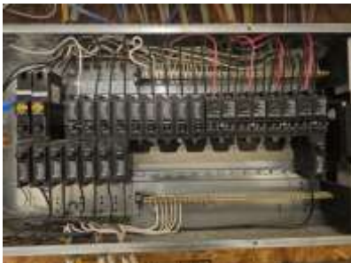
Pic. 40: 200 amp breaker panel