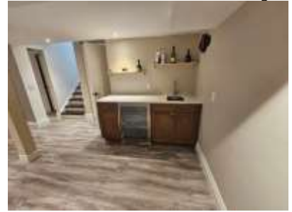
Pic. 33: Rec room