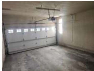
Pic. 8: Garage