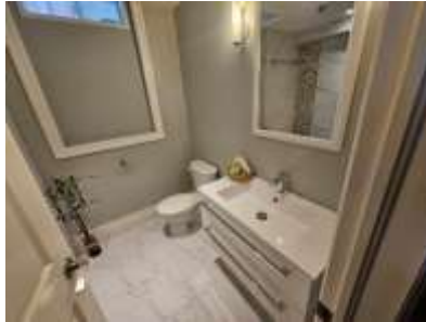
Pic. 35: Basement bathroom