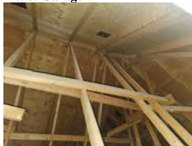
Pic. 11: Attic