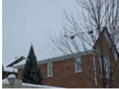
Pic. 5: Roof covering – snow covered