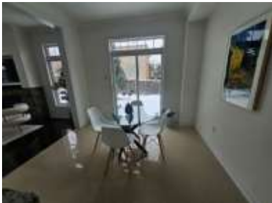
Pic. 22: Eating area