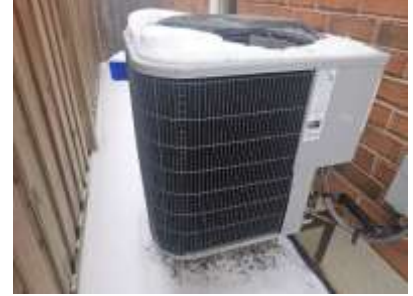
Pic. 6: AC Compressor 202