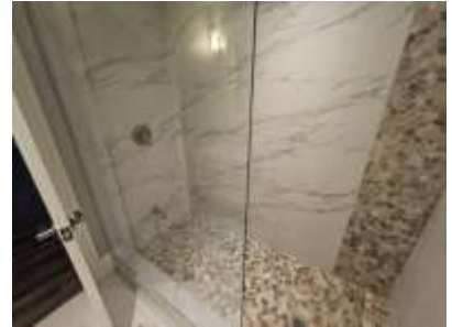
Pic. 36: Basement bathroom