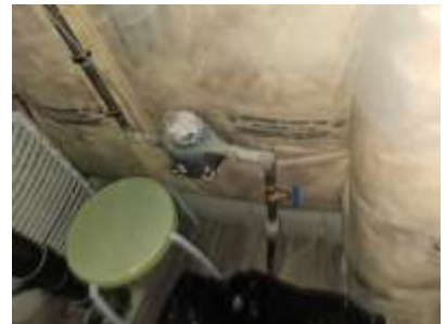
Pic. 39: Water main