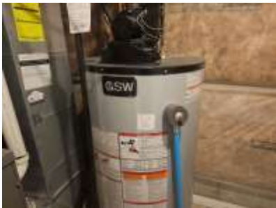
Pic. 37: Hot water tank 2023