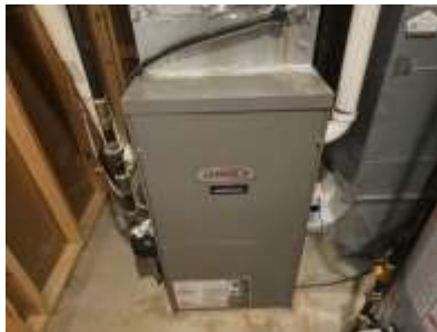
Pic. 38: Gas furnace 2010