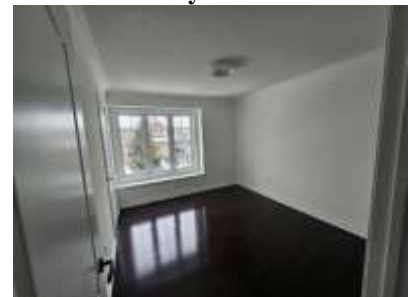
Pic. 15: Bedroom 2