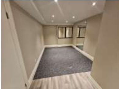
Pic. 34: Rec room