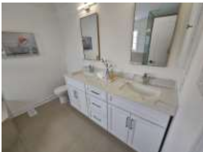
Pic. 13: Primary bathroom