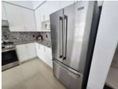
Pic. 26: Kitchen