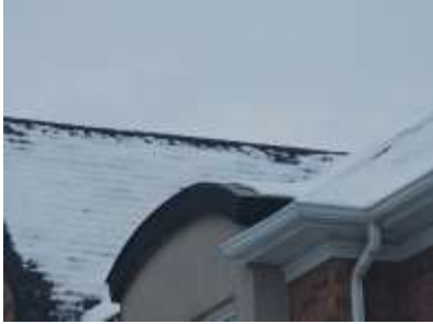
Pic. 4: Roof covering – snow covered