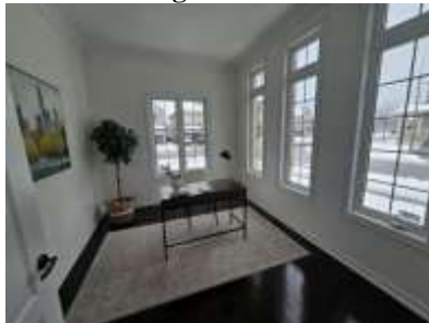
Pic. 23: Den