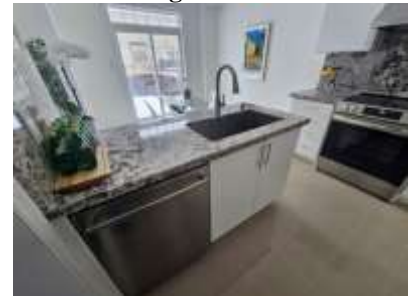
Pic. 24: Kitchen