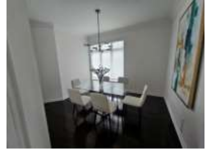
Pic. 21: Dining room