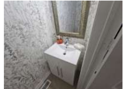
Pic. 27: Powder room