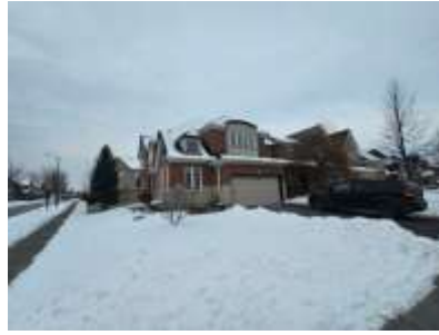
Pic. 2: Garage view