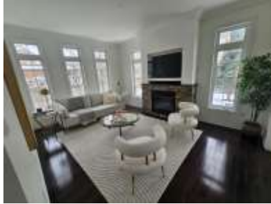
Pic. 20: Living room