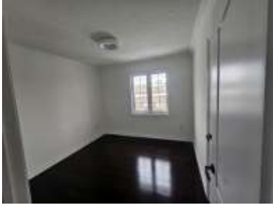
Pic. 16: Bedroom 3