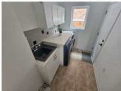
Pic. 29: Laundry