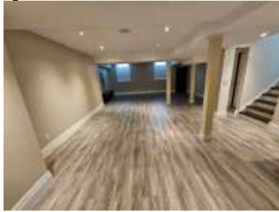
Pic. 32: Rec room