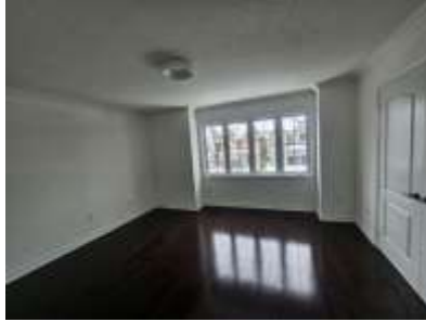
Pic. 17: Bedroom 4