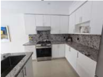
Pic. 25: Kitchen