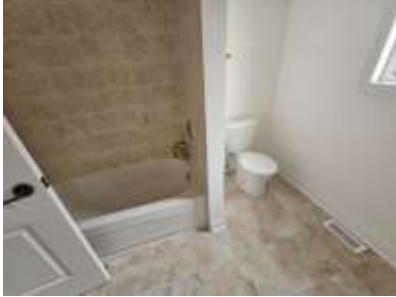
Pic. 19: 2 nd floor bathroom