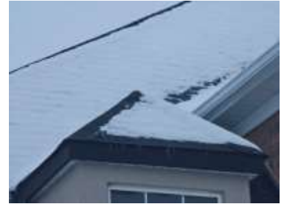
Pic. 3: Roof covering – snow covered