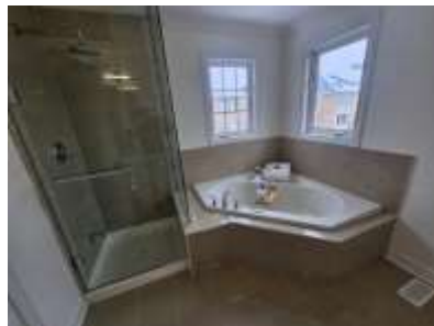
Pic. 14: Primary bathroom