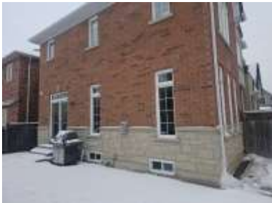
Pic. 7: Back view