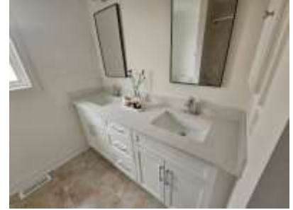
Pic. 18: 2 nd floor bathroom