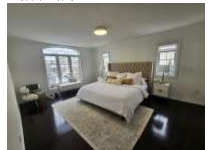
Pic. 12: Primary bedroom