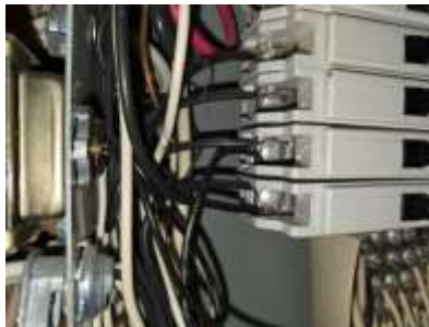
Pic. 38: Lower breaker double tapped