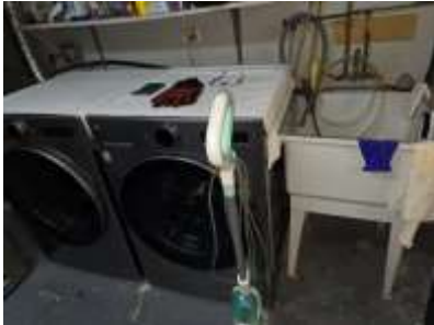
Pic. 34: Laundry