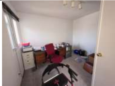
Pic. 17: Bedroom 4