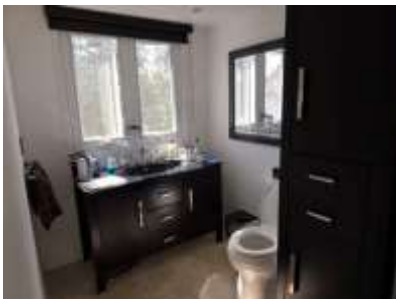
Pic. 13: Primary bathroom