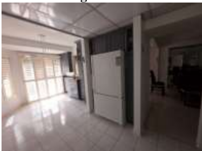
Pic. 28: Kitchen