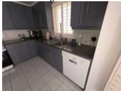
Pic. 26: Kitchen