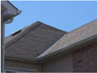
Pic. 4: Roof covering