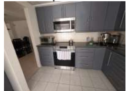
Pic. 27: Kitchen