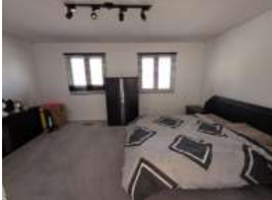
Pic. 16: Bedroom 3