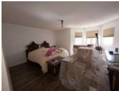
Pic. 11: Primary bedroom