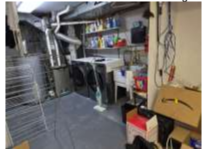
Pic. 33: Laundry / utility room