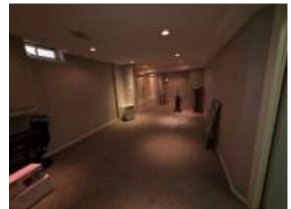
Pic. 30: Rec room