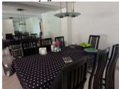
Pic. 23: Dining room