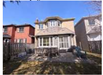
Pic. 6: Back view