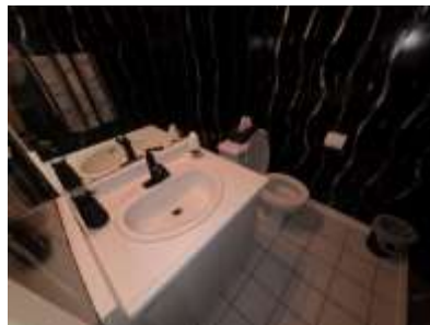
Pic. 29: Powder room