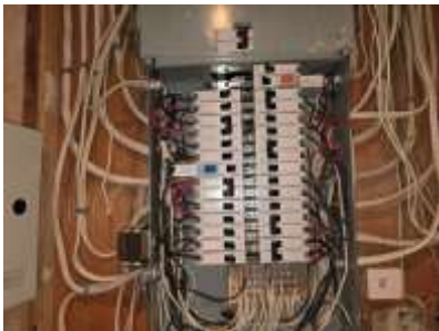
Pic. 37: 100 amp breaker panel