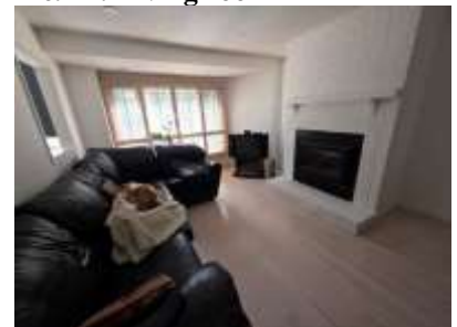
Pic. 24: Family room