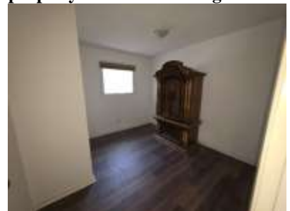
Pic. 15: Bedroom 2