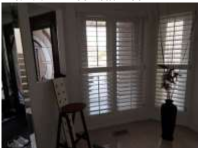
Pic. 22: Living room