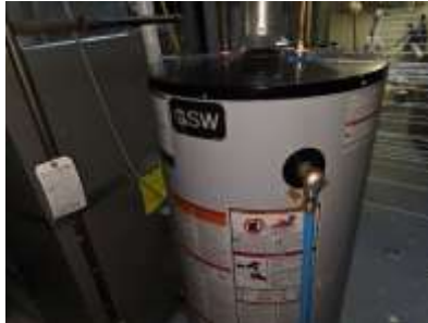
Pic. 35: Rental hot water tank 2022