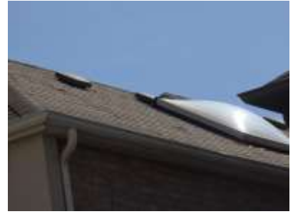
Pic. 3: Skylight