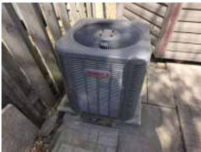
Pic. 7: AC compressor 2020