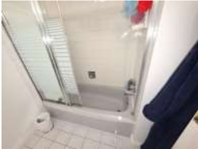
Pic. 19: 2 nd floor bathroom