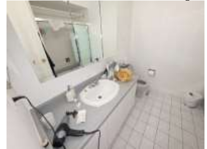
Pic. 18: 2 nd floor bathroom