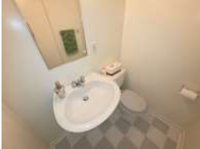
Pic. 31: Basement bathroom