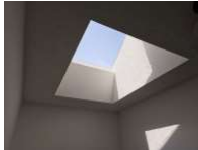
Pic. 20: Skylight