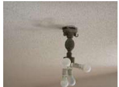
Pic. 12: Light fixture should be properly secured to ceiling