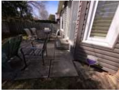
Pic. 5: Negative grading in backyard