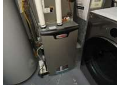
Pic. 36: Gas furnace 2021