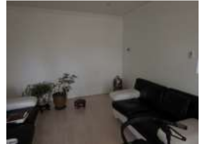
Pic. 21: Living room