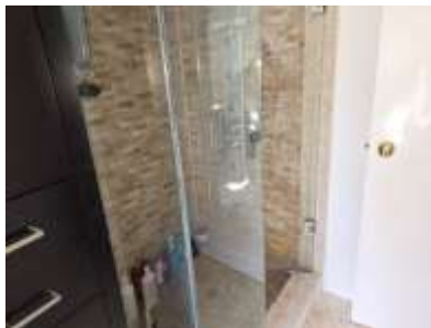
Pic. 14: Primary bathroom