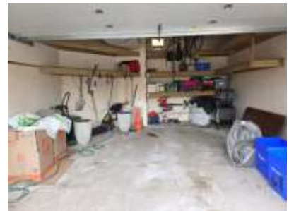
Pic. 39: Garage