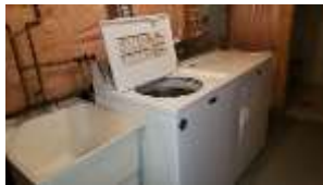
Pic. 18: Laundry