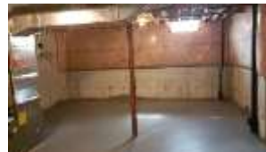
Pic. 19: Unfinished basement