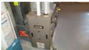
Pic. 21: Updated gas furnace