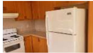
Pic. 15: Kitchen