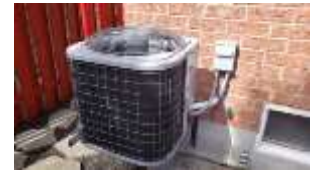
Pic. 4: Newer AC unit