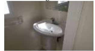
Pic. 16: Powder room