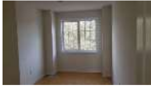
Pic. 10: Bed 3