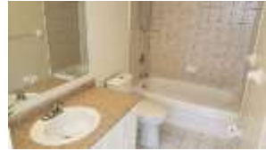
Pic. 11: 2 nd floor bath