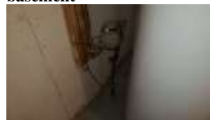
Pic. 23: Water main