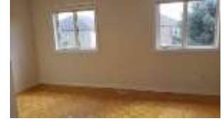
Pic. 8: Master bedroom