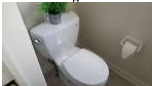
Pic. 17: Powder room