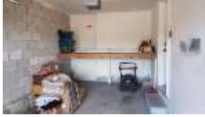
Pic. 5: Garage