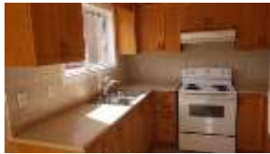
Pic. 14: Kitchen