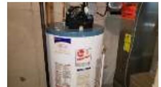
Pic. 20: Rental hot water tank