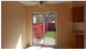
Pic. 13: Eating area