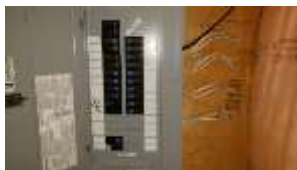
Pic. 22: 100 amp breaker panel