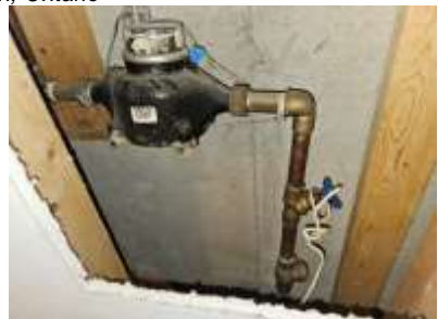
Pic. 32: Water main