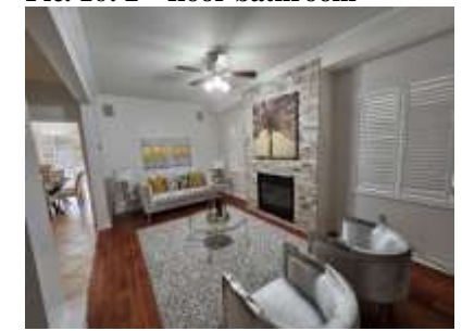
Pic. 19: Living room