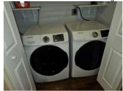
Pic. 18: 2<sup>nd</sup> floor laundry