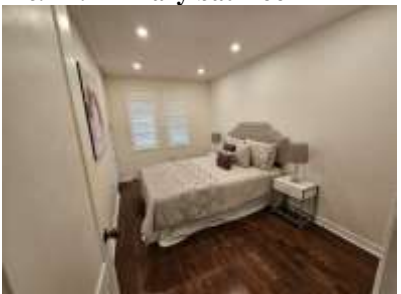
Pic. 15: Bedroom 3