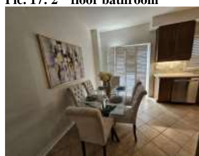
Pic. 20: Dining room