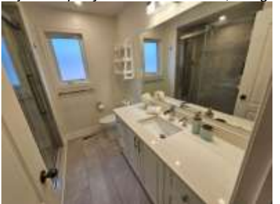
Pic. 16: 2<sup>nd</sup> floor bathroom