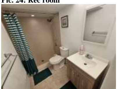
Pic. 27: Basement bathroom