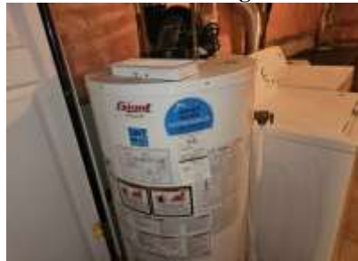
Pic. 29: Hot water tank 2017