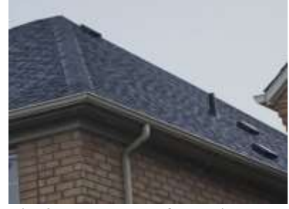
Pic. 3: Updated roof covering