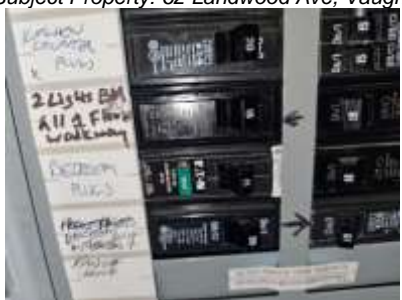
Pic. 31: ARCF breaker is defective and needs to be replaced

Subject Property: 62 Landwood Ave, Vaughan, Ontario