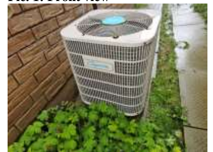
Pic. 4: Original AC unit