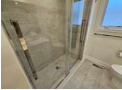
Pic. 17: 2<sup>nd</sup> floor bathroom