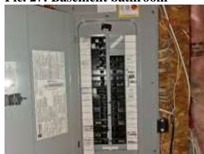
Pic. 30: 100 amp breaker panel