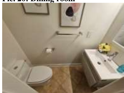
Pic. 23: Powder room