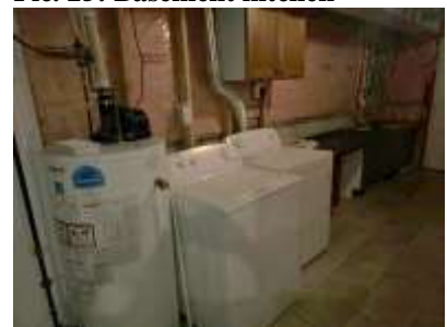
Pic. 28: Basement Laundry