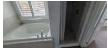
15: Master bath