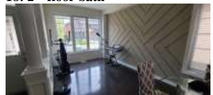
21: Living room