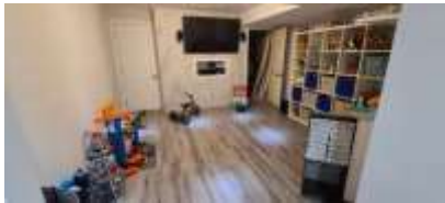
31: Basement room