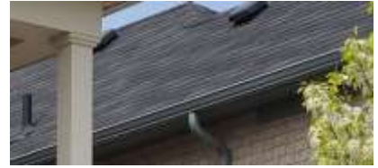
3: Original roof covering