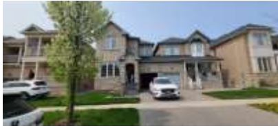
1: Front view