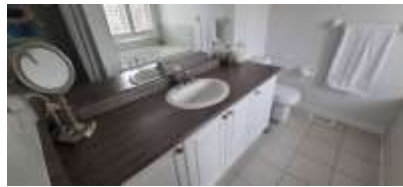
14: Master bath