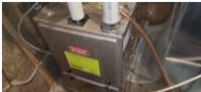
34: Gas furnace 2014