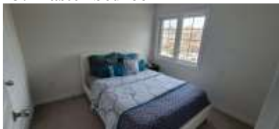
16: Bedroom 2