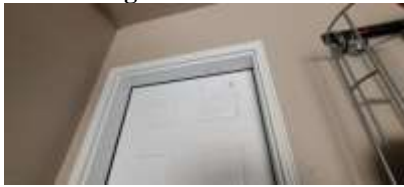
10: No auto closer on garage entry door