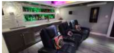
29: Media room