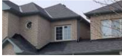
2: Original roof covering