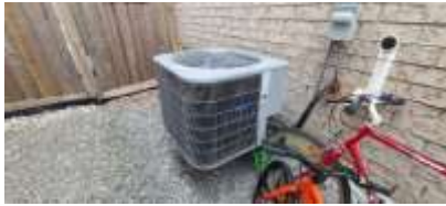
4: AC unit t2014