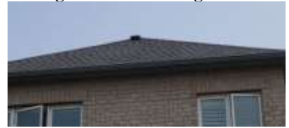
6: Original roof covering