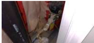
35: Water main