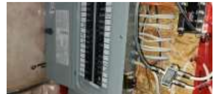
36: 100 amp breaker panel – panel access was blocked