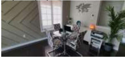
22: Dining room