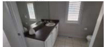
18: 2 nd floor bath