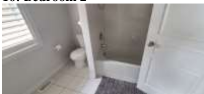
19: 2 nd floor bath