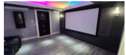
30: Media room