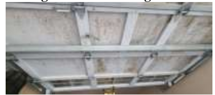
9: Apparent visible surface mould which can be cleaned accordingly