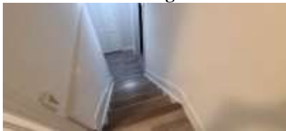
28: Handrailing advised for safety in basement stairwell