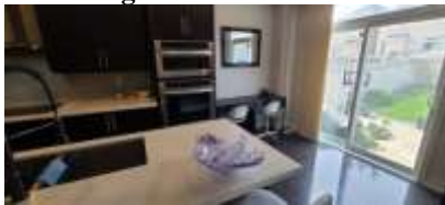
25: Kitchen & Eating area