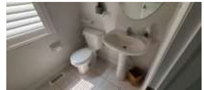
27: Powder room