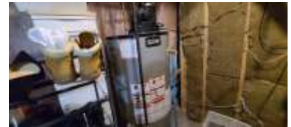
33: Rental hot water tank 2014