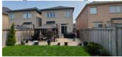
5: Back view