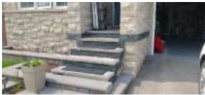
7: Front step uneven rise and no handrailing