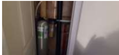
32: Water softener