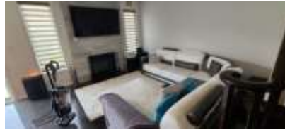
23: Family room