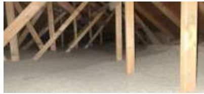
11: Attic – R50