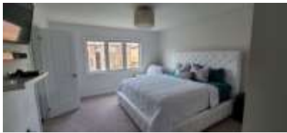
13: Master bedroom