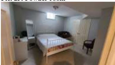
Pic. 28: Bed 5