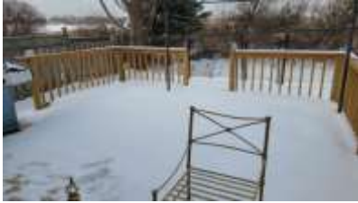
Pic. 4: Rear deck