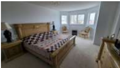
Pic. 10: Master bedroom