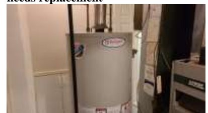
Pic. 33: Rental hot water tank