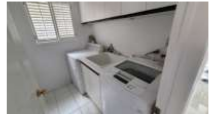
Pic. 24: Laundry