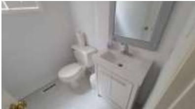
Pic. 25: Powder room