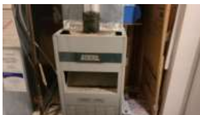
Pic. 32: Gas furnace 1991