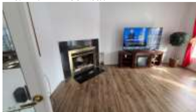
Pic. 17: Family room