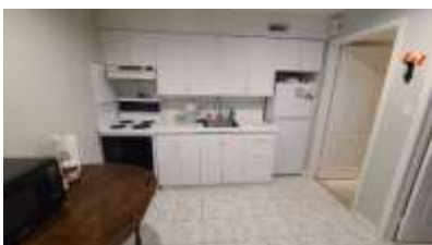
Pic. 31: Basement kitchen