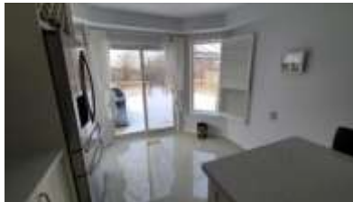
Pic. 23: Eating area