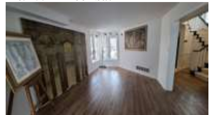
Pic. 18: Living room