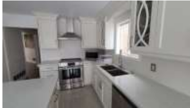
Pic. 20: Kitchen