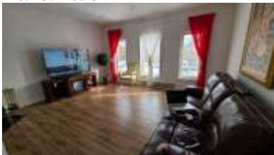
Pic. 16: Family room