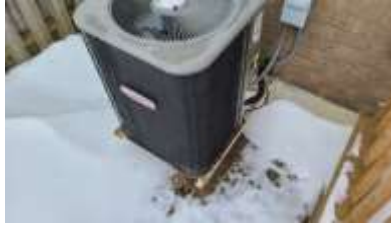
Pic. 5: AC unit 2009