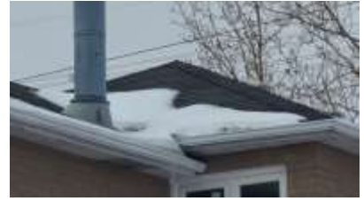
Pic. 3: Roof covering