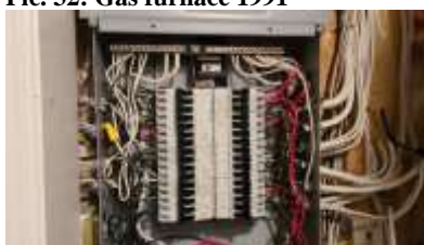
Pic. 35: Main panel