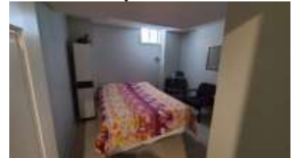
Pic. 27: Bed 4