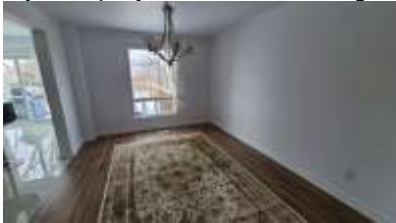
Pic. 19: Dining room