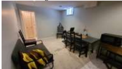
Pic. 26: Basement living/dining room