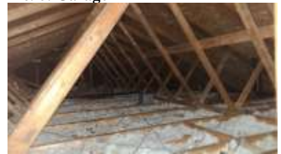
Pic. 9: Attic – insulation level is very low