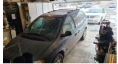
Pic. 6: Garage