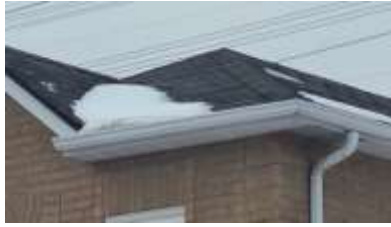
Pic. 2: Roof covering