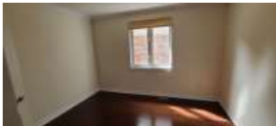
Pic. 16: Bedroom 3