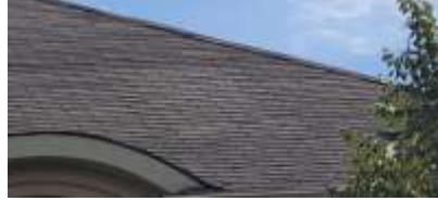
Pic. 2: Original roof covering