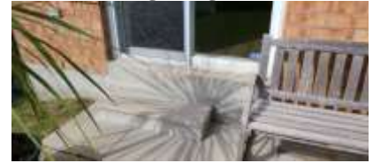
Pic. 6: Should be 2 steps at basement walkout – trip hazard