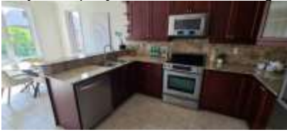
Pic. 22: Kitchen