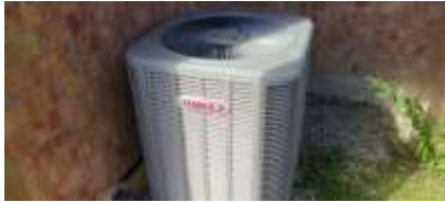
Pic. 7: AC unit 2011