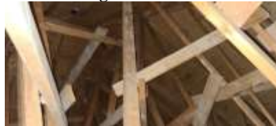
Pic. 11: Attic