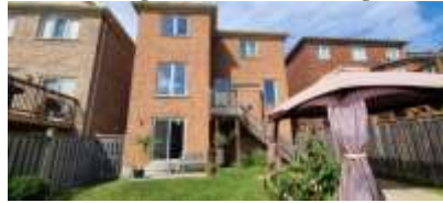
Pic. 5: Back view