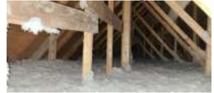
Pic. 9: Attic