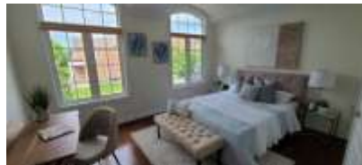
Pic. 17: Bedroom 4