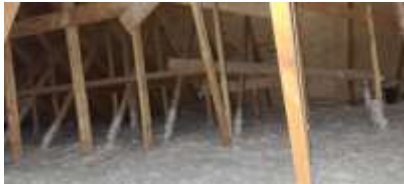
Pic. 10: Attic