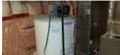
Pic. 32: Hot water tank 2008