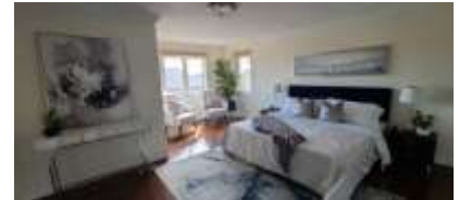
Pic. 12: Master bedroom