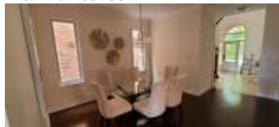
Pic. 20: Dining room