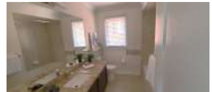
Pic. 18: 2 nd floor bath