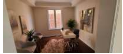
Pic. 24: Den