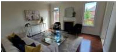
Pic. 19: Living room