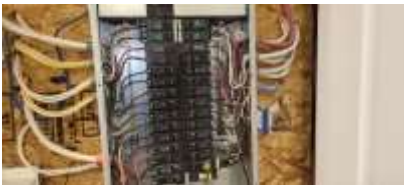
Pic. 34: 100-amp breaker panel