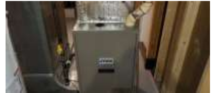
Pic. 33: Gas furnace 2007