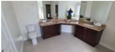
Pic. 13: Master bath