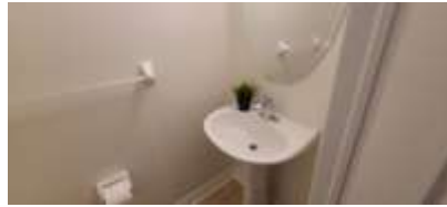
Pic. 26: Powder room