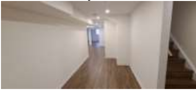
Pic. 28: Basement