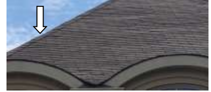
Pic. 3: Missing shingle tab