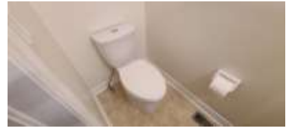
Pic. 27: Powder room