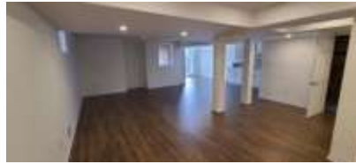
Pic. 29: Rec room