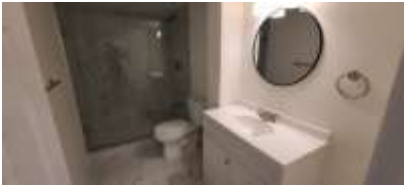
Pic. 31: Basement bath