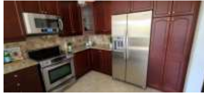
Pic. 23: Kitchen