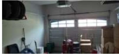
Pic. 8: Garage