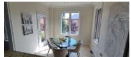
Pic. 21: Eating area