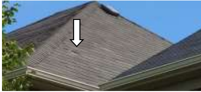
Pic. 4: Missing shingle tab