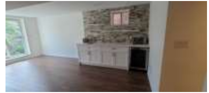
Pic. 30: Rec room