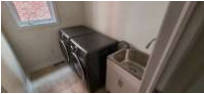
Pic. 25: Laundry