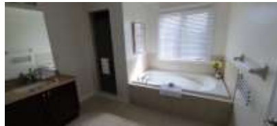
Pic. 14: Master bath