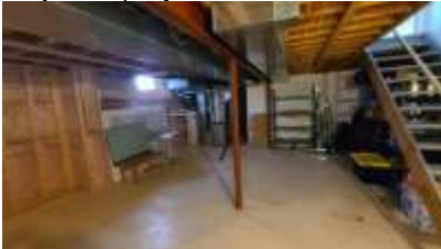
Pic. 37: Unfinished basement area