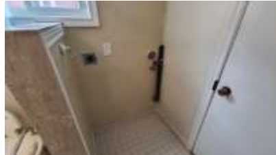
Pic. 35: Laundry area