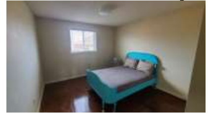
Pic. 21: Bedroom 3