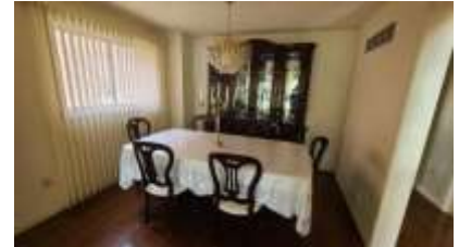
Pic. 27: Dining room