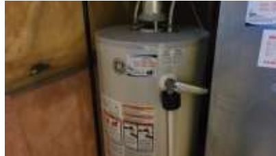
Pic. 38: Water heater 2012