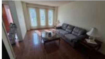
Pic. 26: Living room