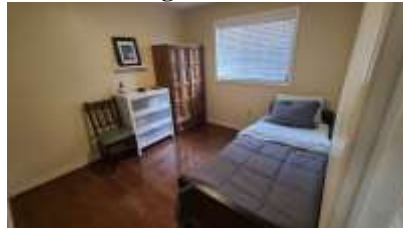
Pic. 32: Den