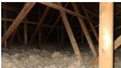
Pic. 13: Attic