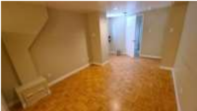
Pic. 43: Living area