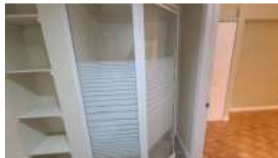
Pic. 47: Bathroom