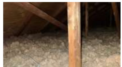
Pic. 15: Attic