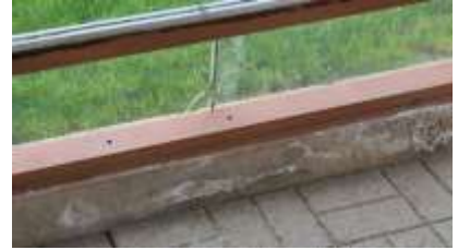
Pic. 9: Cracked plexiglass panel