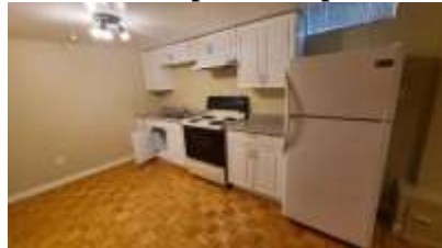
Pic. 44: Kitchen