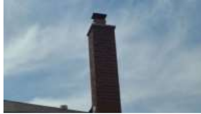
Pic. 8: Chimney