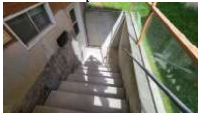
Pic. 11: Basement apartment exterior entrance