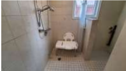
Pic. 34: Wheelchair accessible shower