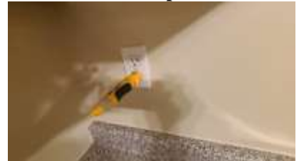
Pic. 45: Outlet to the left of sink wired incorrectly