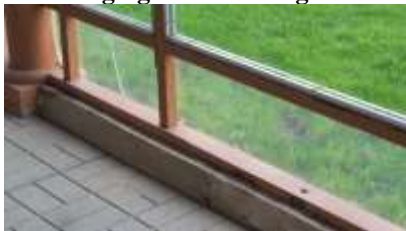
Pic. 10: Cracked plexiglass panel