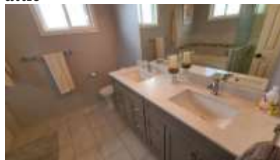
Pic. 17: Master bath