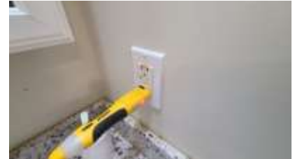
Pic. 36: GFCI outlet has no ground and needs to be corrected