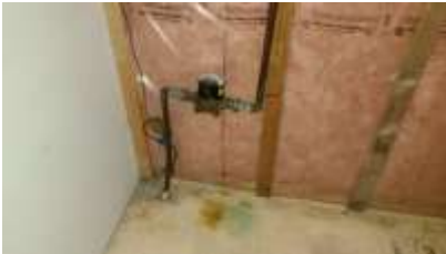
Pic. 40: Water main