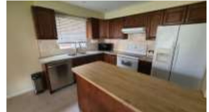
Pic. 30: Kitchen