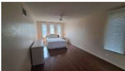
Pic. 16: Master bedroom