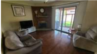
Pic. 28: Family room