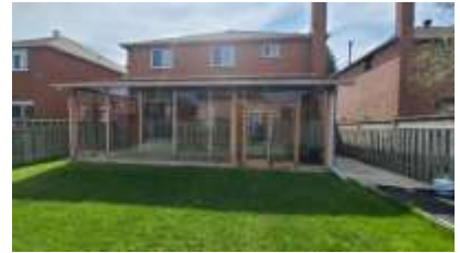
Pic. 6: Back view