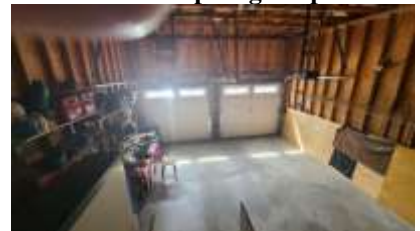
Pic. 12: Garage