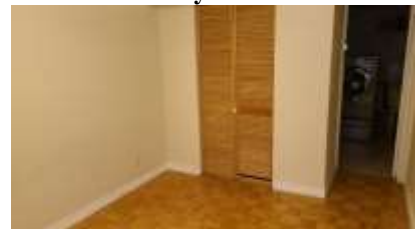
Pic. 48: Bedroom