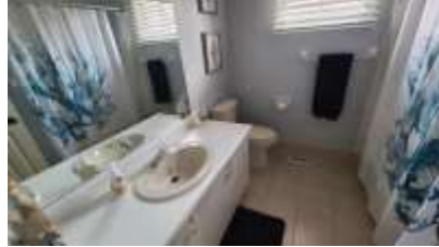
Pic. 23: 2nd floor bath