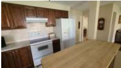
Pic. 31: Kitchen