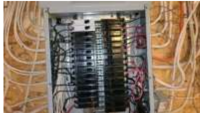
Pic. 41: 150amp breaker panel