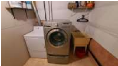
Pic. 49: Laundry