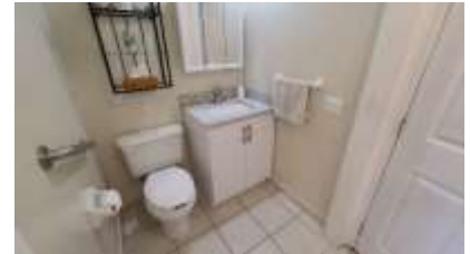
Pic. 33: Main floor bath