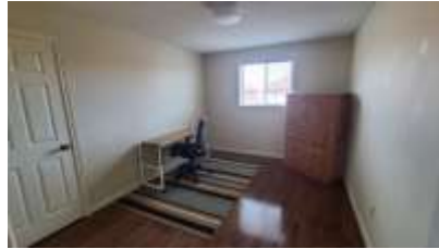
Pic. 20: Bedroom 2