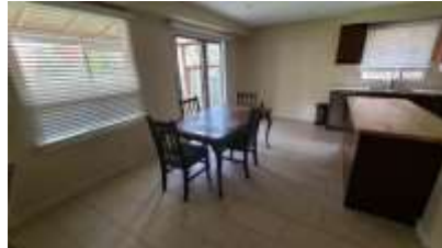
Pic. 29: Eating area