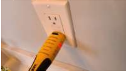
Pic. 19: GFCI outlet has no ground and needs to be corrected