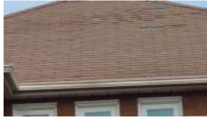
Pic. 2: Older roof covering with a couple of loose / missing shingle tabs