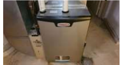
Pic. 39: Gas furnace 2018