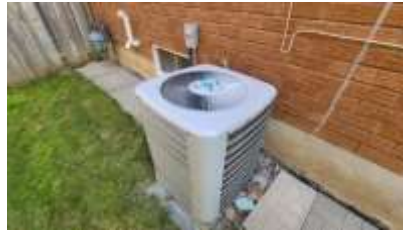
Pic. 5: AC unit 2018