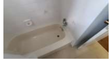
Pic. 24: 2nd floor bath