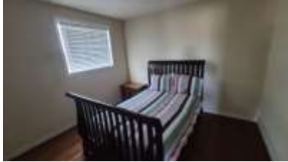
Pic. 22: Bedroom 4