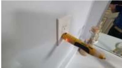
Pic. 25: GFCI outlet has no ground and needs to be corrected