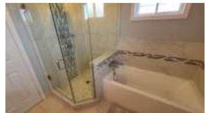
Pic. 18: Master bath