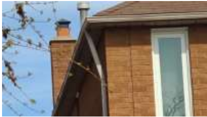
Pic. 4: Chimney