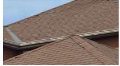
Pic. 3: Older roof covering with a couple of loose / missing shingle tabs