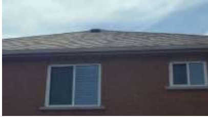
Pic. 7: Aging roof covering