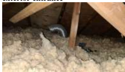
Pic. 14: Master bathroom exhaust vent pipe venting directly into the attic