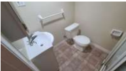
Pic. 46: Bathroom