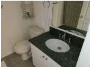
Pic. 13: 2 nd floor bath