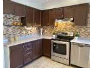
Pic. 19: Kitchen