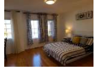
Pic. 8: Master bedroom