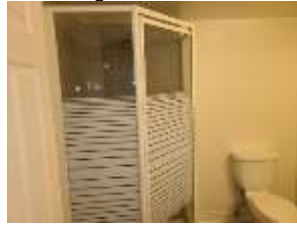
Pic. 26: Basement bath