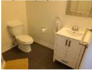
Pic. 25: Basement bath