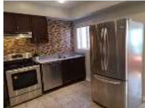
Pic. 18: Kitchen