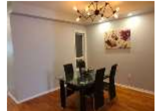
Pic. 16: Dining room