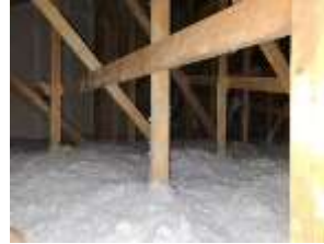
Pic. 7: Updated insulation level