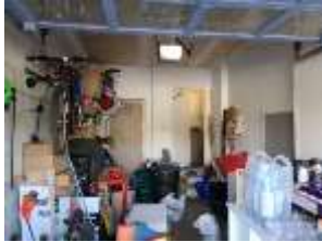
Pic. 5: Garage