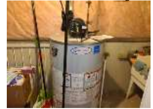
Pic. 28: Rental hot water tank