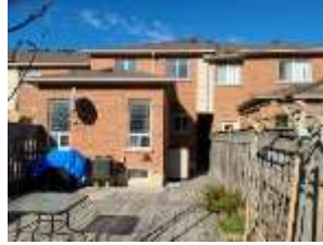
Pic. 2: Back view