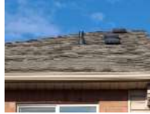
Pic. 3: Updated roof covering