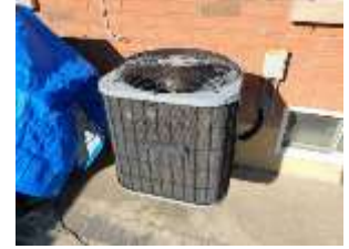
Pic. 4: Original AC unit