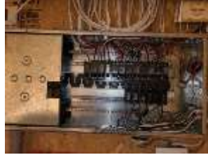
Pic. 30: 100 amp breaker panel with all cooper wire