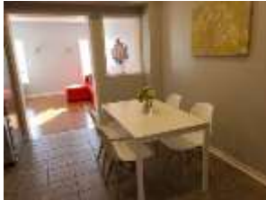
Pic. 17: Eating area