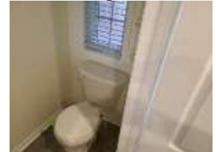
Pic. 20: Powder room