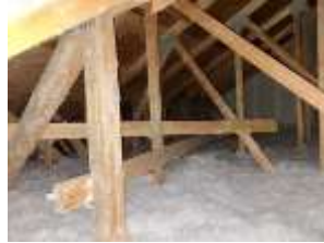
Pic. 6: Attic