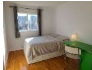
Pic. 11: Bed 2