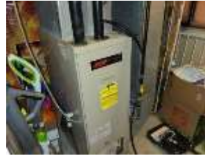
Pic. 27: Original gas furnace