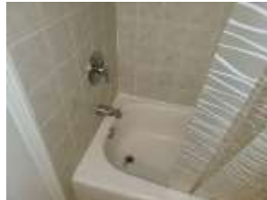
Pic. 14: 2 nd floor bath