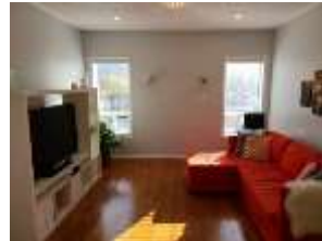
Pic. 15: Living room