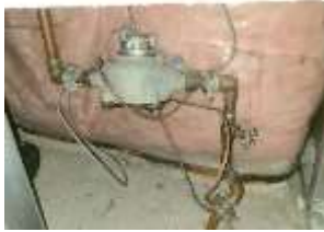
Pic. 29: Water main