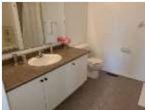
Pic. 9: Master bath