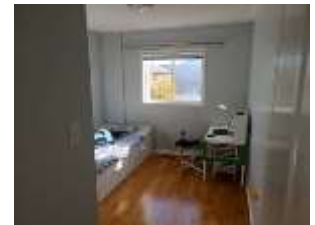
Pic. 12: Bed 3