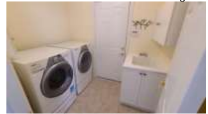
Pic. 21: Laundry