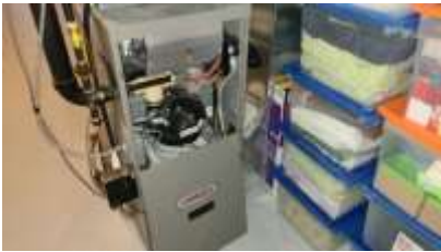
Pic. 25: Gas furnace 2007