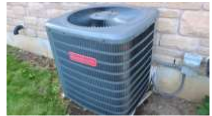
Pic. 3: AC unit 2017