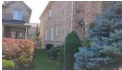
Pic. 2: Side view