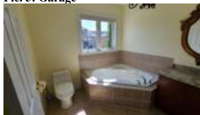
Pic. 8: Master bath