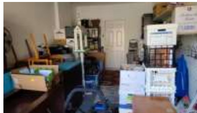
Pic. 5: Garage