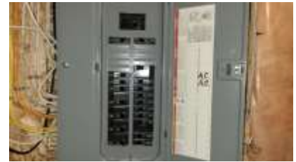
Pic. 27: 100 amp breaker panel