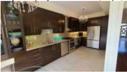
Pic. 19: Kitchen