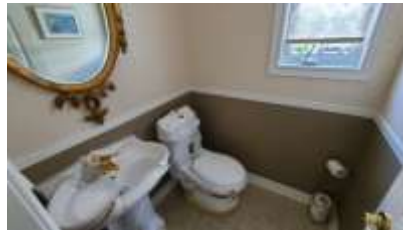
Pic. 20: Powder room