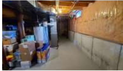
Pic. 23: Unfinished basement