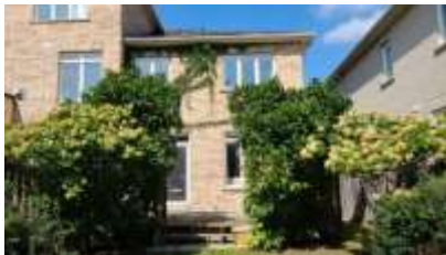
Pic. 4: Back view