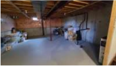
Pic. 22: Unfinished basement