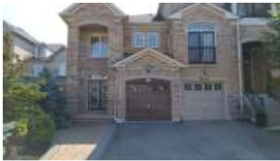
Pic. 1: Front view