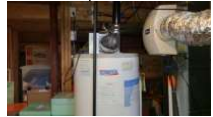
Pic. 24: Rental hot water tank 2007