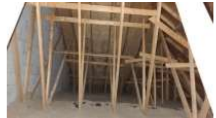
Pic. 6: Attic