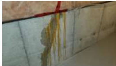
Pic. 26: Repaired foundation crack