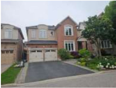
Pic. 1: Front view