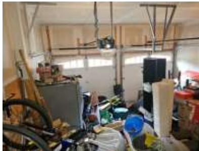
Pic. 8: Garage