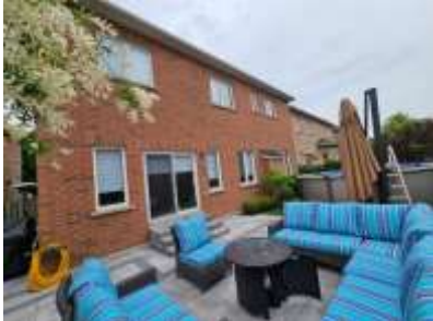
Pic. 4: Back view