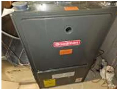
Pic. 38: Gas furnace 2005