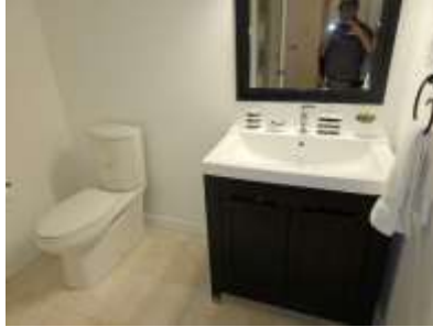
Pic. 35: Basement bathroom