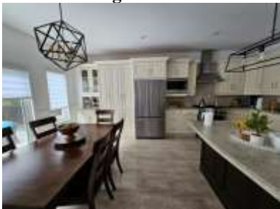
Pic. 25: Kitchen