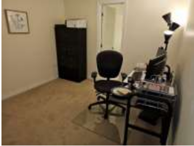
Pic. 34: Basement room