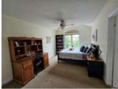
Pic. 20: Bedroom 4