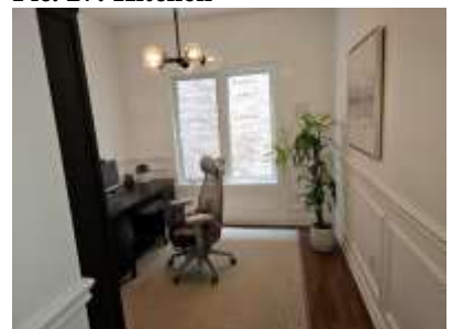
Pic. 30: Office