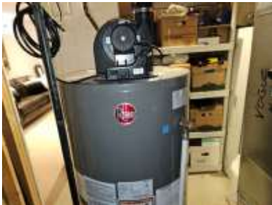
Pic. 37: Hot water tank 2018