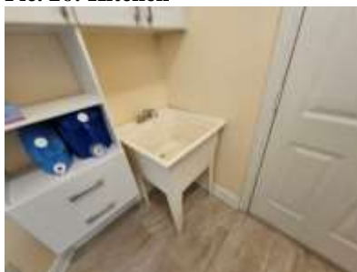
Pic. 29: Laundry