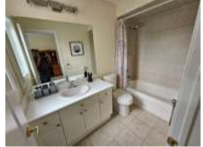
Pic. 21: Ensuite