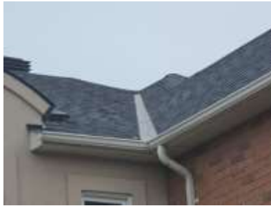
Pic. 2: Roof covering