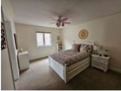
Pic. 16: Bedroom 2