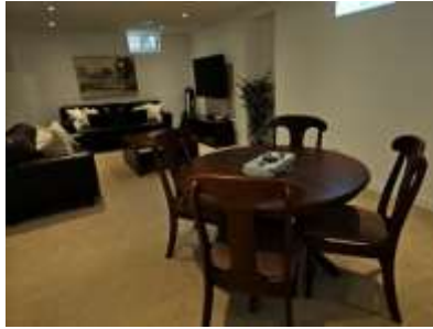
Pic. 32: Rec room