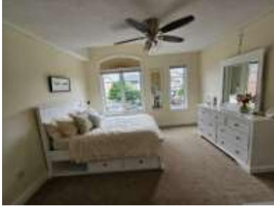
Pic. 19: Bedroom 3