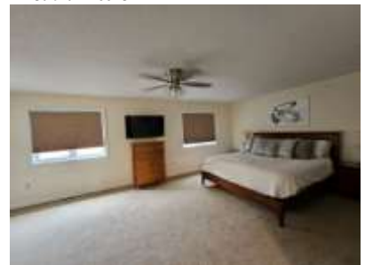
Pic. 12: Primary bedroom