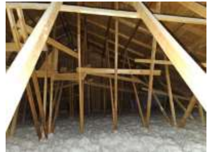
Pic. 9: Attic