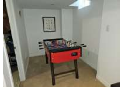
Pic. 33: Rec room