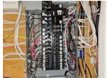
Pic. 39: 100 amp breaker panel