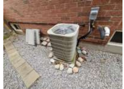
Pic. 6: AC unit 2005