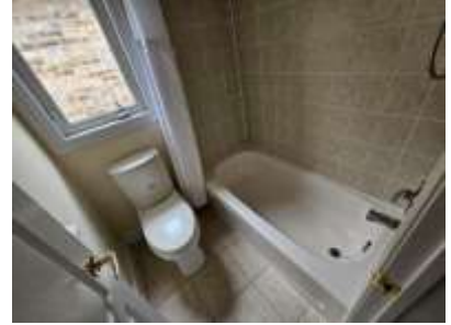
Pic. 18: Joint ensuite