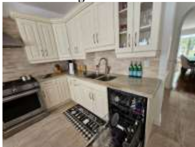
Pic. 26: Kitchen