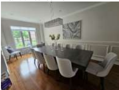
Pic. 22: Dining room