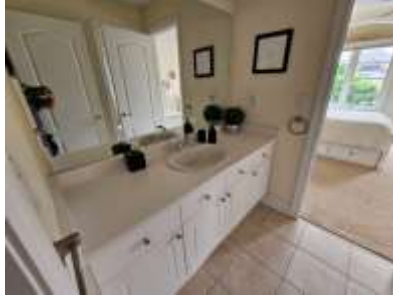
Pic. 17: Joint ensuite