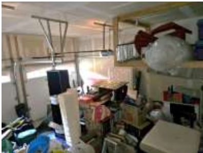
Pic. 7: Garage