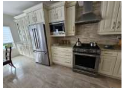
Pic. 27: Kitchen