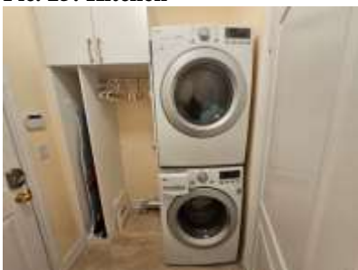
Pic. 28: Laundry