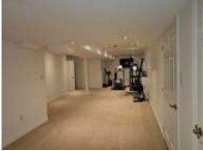
Pic. 31: Rec room