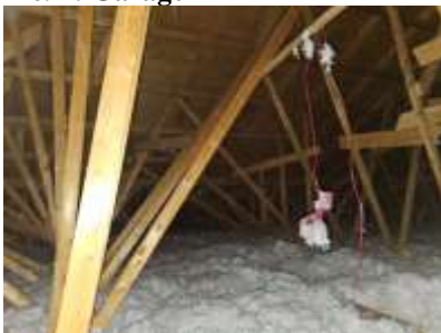
Pic. 10: Attic