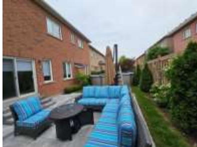
Pic. 5: Back view