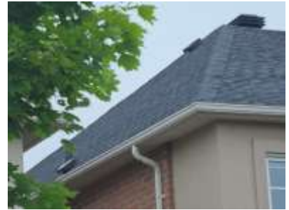
Pic. 3: Roof covering