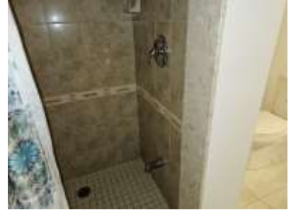
Pic. 36: Basement bathroom