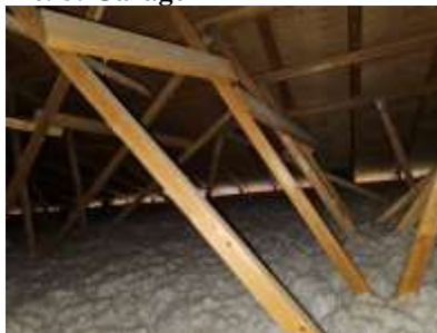
Pic. 11: Attic