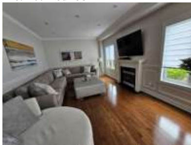
Pic. 23: Living room