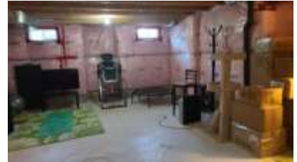
Pic. 24: Basement