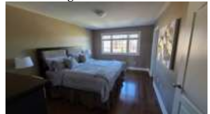
Pic. 9: Master bedroom