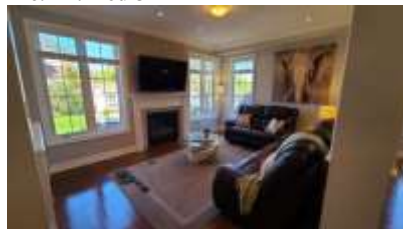
Pic. 17: Living room