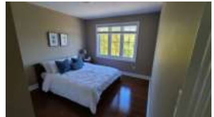
Pic. 15: Bed 4