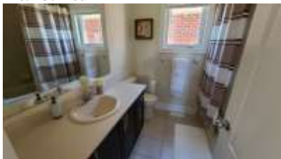
Pic. 16: 2 nd floor bath