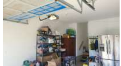
Pic. 6: Garage