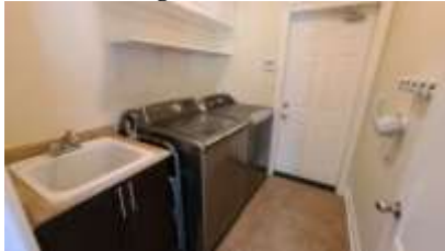
Pic. 22: Laundry