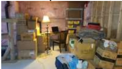
Pic. 25: Basement