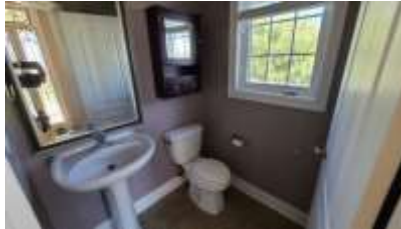
Pic. 23: Powder room