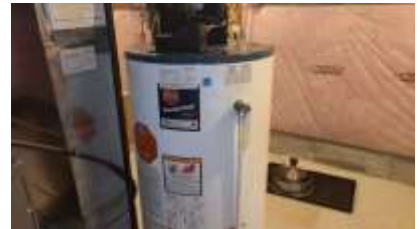
Pic. 27: Hot water tank 2010