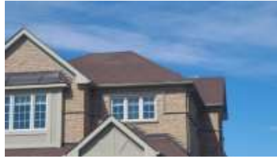
Pic. 2: Original roof covering