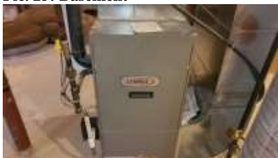
Pic. 28: Gas furnace 2010