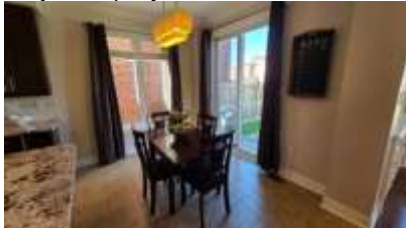
Pic. 19: Eating area