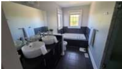
Pic. 10: Master bath