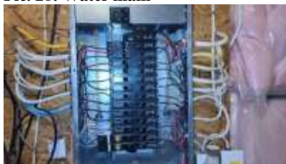
Pic. 29: 100 amp breaker panel