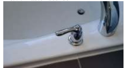
Pic. 12: Cold water faucet for tub is broken