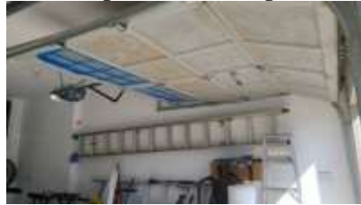
Pic. 5: Garage