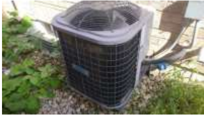
Pic. 4: AC unit 2011