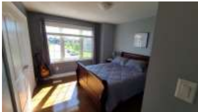
Pic. 13: Bed 2