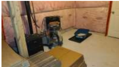
Pic. 26: Water main