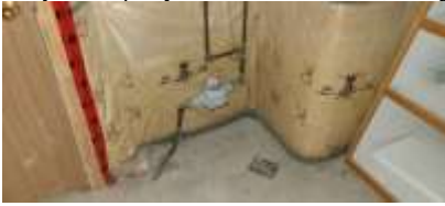
Pic. 46: Water main