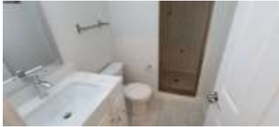
Pic. 16: 3 rd floor bath