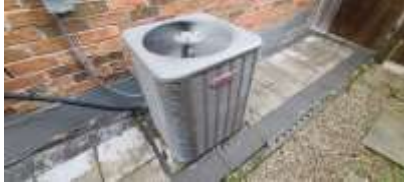
Pic. 4: AC unit 2016