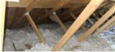
Pic. 10: Attic