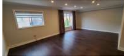
Pic. 17: Master bedroom