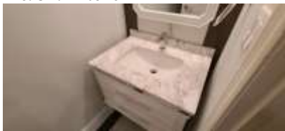
Pic. 37: Powder room