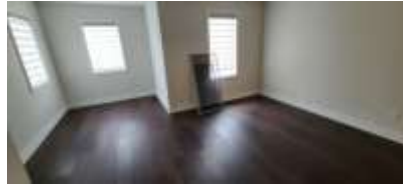
Pic. 26: Bedroom 6