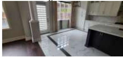
Pic. 32: Eating area