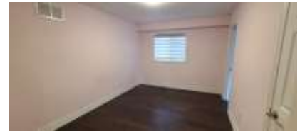
Pic. 21: Bedroom 4