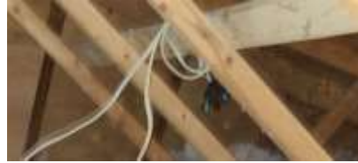
Pic. 11: Open air wiring junction in attic