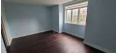
Pic. 25: Bedroom 5