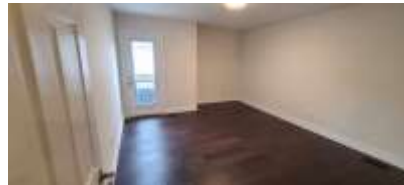
Pic. 14: Bedroom 2