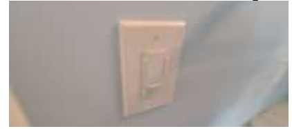
Pic. 24: Dimmer switch not wired correctly for 3 way switch