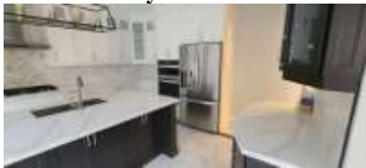
Pic. 34: Kitchen