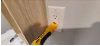
Pic. 28: Outlet wired incorrectly