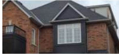
Pic. 2: Roof covering