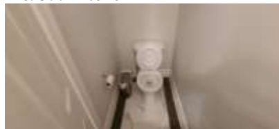
Pic. 38: Powder room