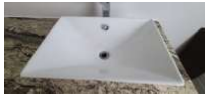
Pic. 20: Right sink drain slow