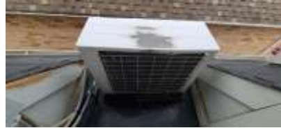
Pic. 8: Split AC unit for third floor