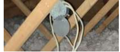
Pic. 12: Open junction box in attic