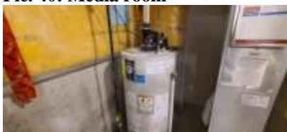
Pic. 43: Rental hot water tank