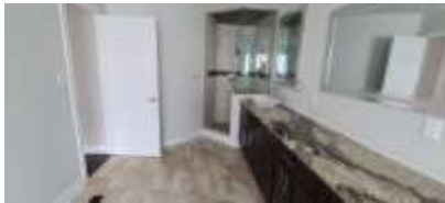
Pic. 19: Master bath