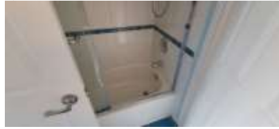
Pic. 23: Joint ensuite