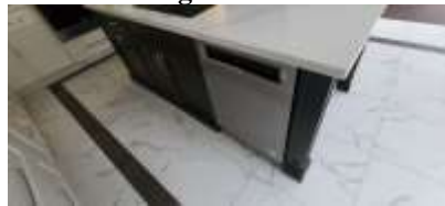
Pic. 35: Kitchen