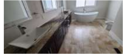
Pic. 18: Master bath