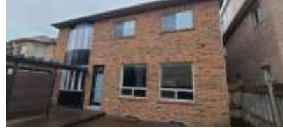
Pic. 5: Back view