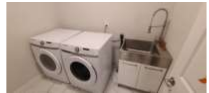
Pic. 36: Laundry