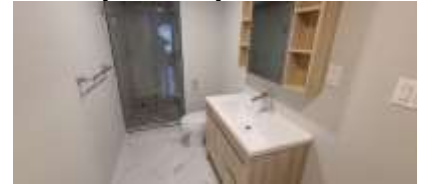
Pic. 27: Ensuite