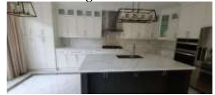
Pic. 33: Kitchen