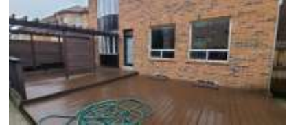
Pic. 6: Deck