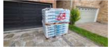
Pic. 3: New shingles to be installed