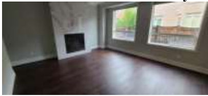
Pic. 31: Family room