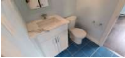
Pic. 22: Joint ensuite