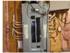
Pic. 27: 100 amp breaker panel