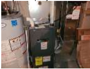
Pic. 25: Gas furnace