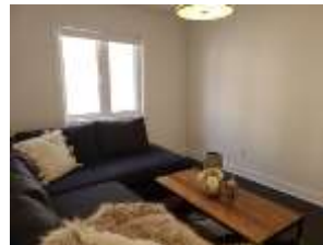
Pic. 11: Bed 2