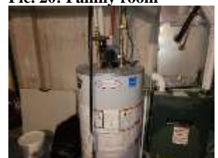
Pic. 24: Rental hot water tank