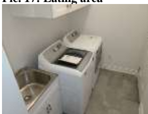
Pic. 21: Laundry