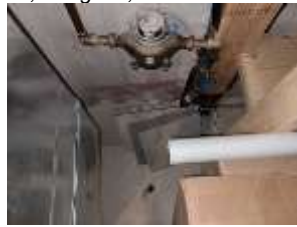
Pic. 26: Water main