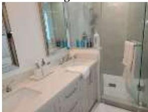
Pic. 9: Master bath