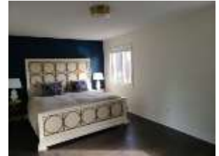
Pic. 8: Master bedroom