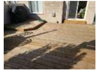
Pic. 4: Rear deck