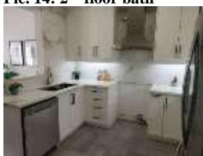
Pic. 18: Kitchen