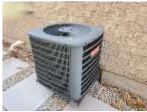
Pic. 2: AC unit