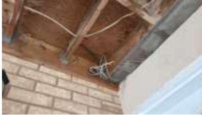
Pic. 4: Interior wire used outside