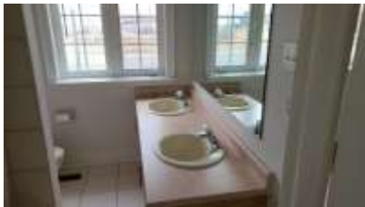
Pic. 16: 2 nd floor bath