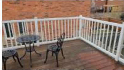
Pic. 20: Balcony