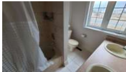
Pic. 17: 2 nd floor bath