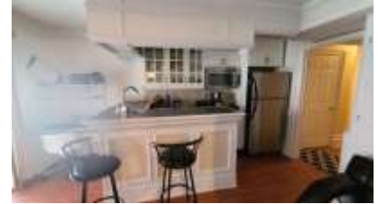
Pic. 30: Kitchenette