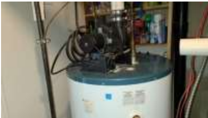
Pic. 34: Hot water tank 2010