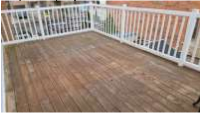
Pic. 19: Balcony