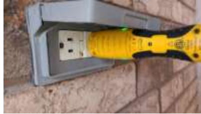
Pic. 5: Rear GFCI defective won't trip