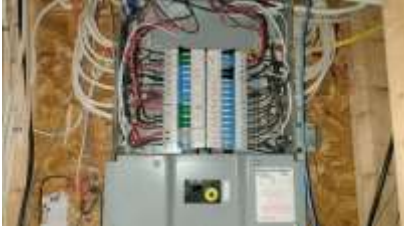
Pic. 37: 100 amp breaker panel