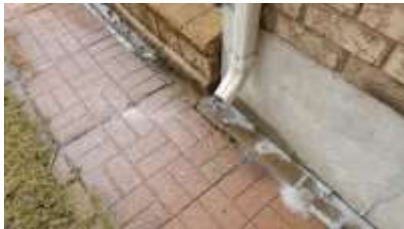
Pic. 7: Downspout extension advised