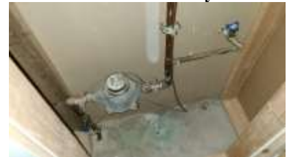
Pic. 36: Water main