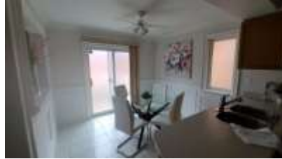
Pic. 23: Eating area