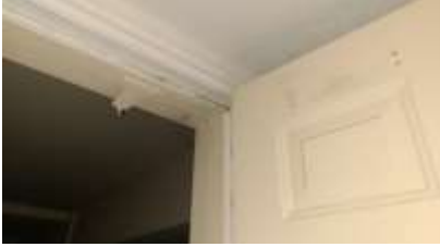
Pic. 40: Auto closer needed for garage entry door