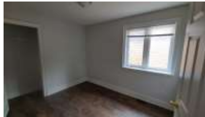
Pic. 14: Bed 3