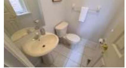
Pic. 27: Powder room