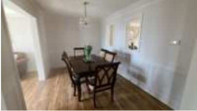
Pic. 22: Dining room