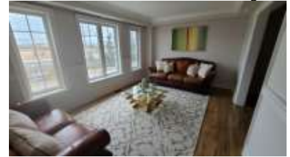
Pic. 21: Living room