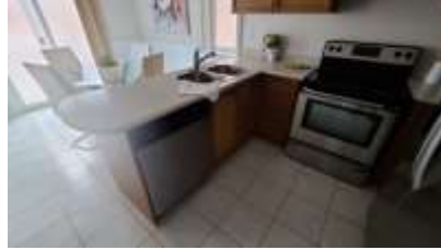
Pic. 26: Kitchen