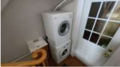
Pic. 28: Laundry