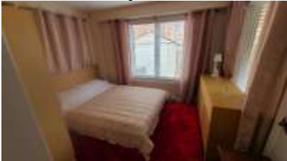
Pic. 31: Bed 5