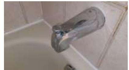
Pic. 18: Tub water diverter seized in tub position only