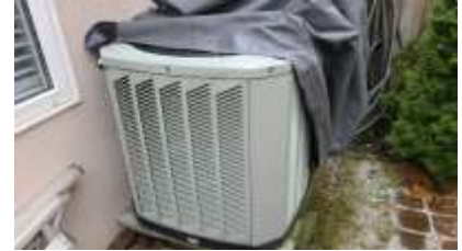
Pic. 6: AC unit 2017