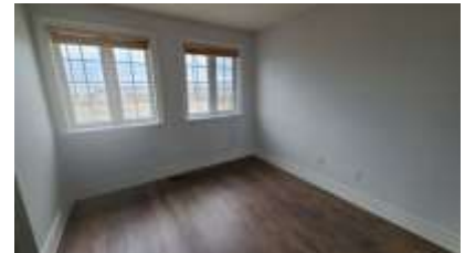
Pic. 15: Bed 4