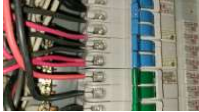
Pic. 38: Several breaker double tapped