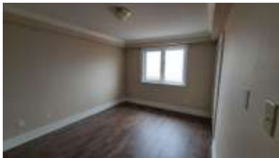
Pic. 10: Master bedroom