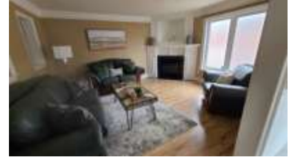
Pic. 24: Family room