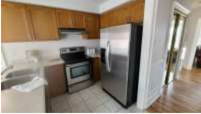
Pic. 25: Kitchen