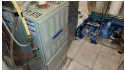
Pic. 35: Gas furnace 2017