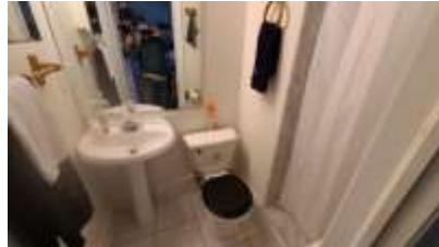
Pic. 32: Basement bath