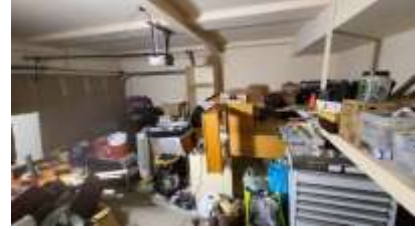
Pic. 39: Garage