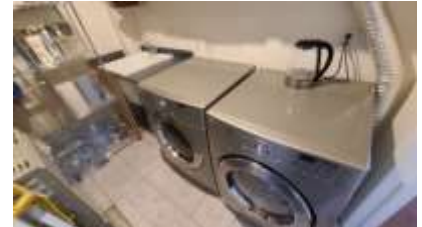
Pic. 33: Basement laundry