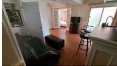
Pic. 29: Basement room