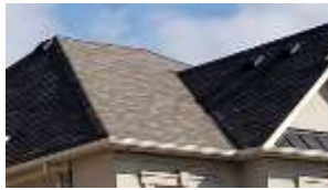
Pic. 2: Original roof covering