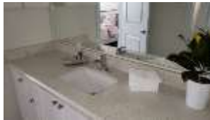
Pic. 14: Joint ensuite