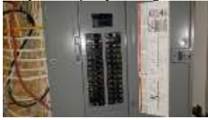
Pic. 33: 100 amp breaker panel