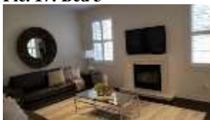
Pic. 21: Living room