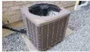
Pic. 3: AC unit