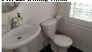
Pic. 26: Powder room