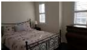
Pic. 17: Bed 3