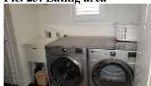
Pic. 27: Laundry