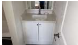
Pic. 19: Ensuite