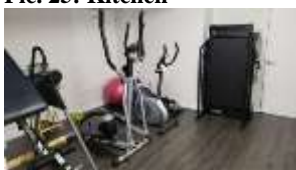
Pic. 29: Rec room