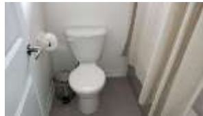
Pic. 15: Joint ensuite