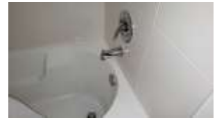
Pic. 16: Joint ensuite