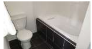
Pic. 20: Ensuite