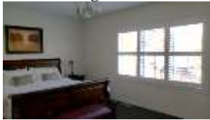
Pic. 9: Master bedroom