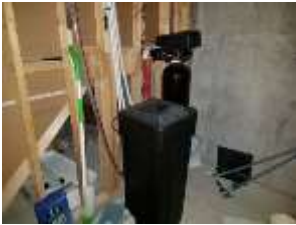
Pic. 29: Water softner