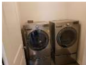
Pic. 18: Laundry