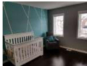
Pic. 15: Bed 3