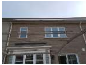
Pic. 6: Back view