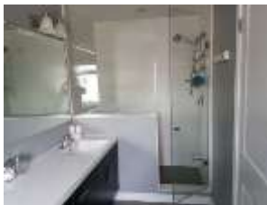
Pic. 13: Master bath