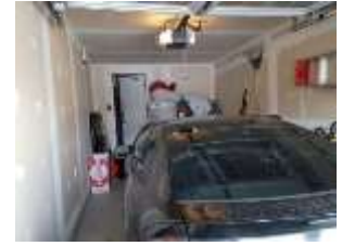
Pic. 4: Garage