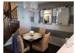
Pic. 20: Dining room