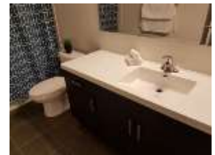
Pic. 16: 2 nd floor bath