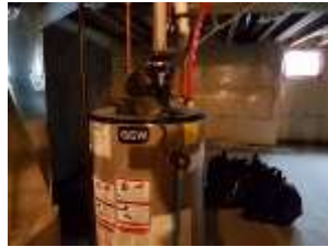
Pic. 30: Rental hot water tank