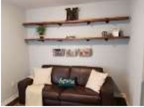
Pic. 21: Sitting area