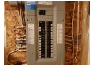
Pic. 32: 100 Amp breaker panel – all copper wire