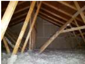
Pic. 9: Attic