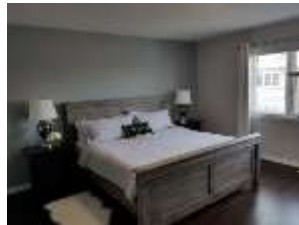
Pic. 10: Master bedroom