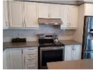
Pic. 23: Kitchen