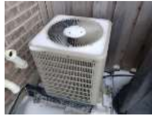
Pic. 7: AC Unit