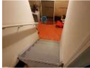
Pic. 26: Basement stairs