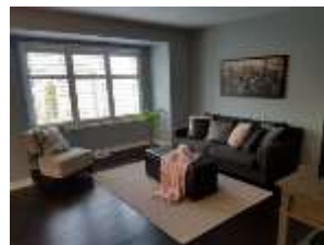
Pic. 19: Living room