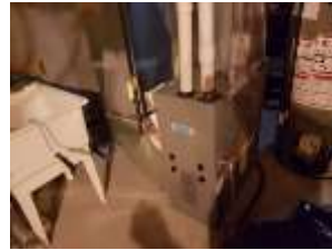
Pic. 31: High efficiency furnace