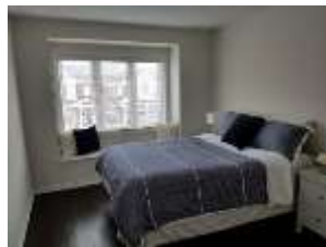
Pic. 14: Bed 2