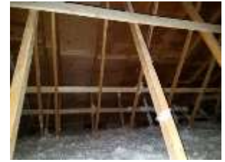
Pic. 8: Attic