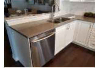
Pic. 24: Kitchen