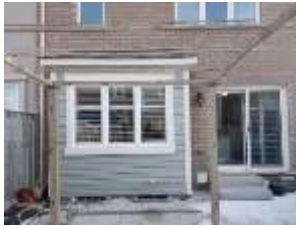
Pic. 5: Back view