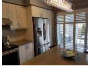
Pic. 22: Kitchen