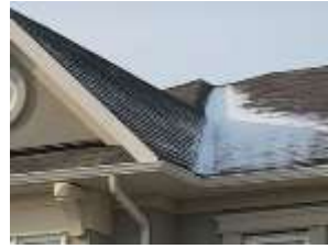
Pic. 3: Roof covering