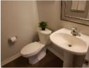
Pic. 25: Powder room