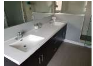
Pic. 12: Master bath