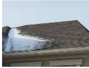
Pic. 2: Roof covering