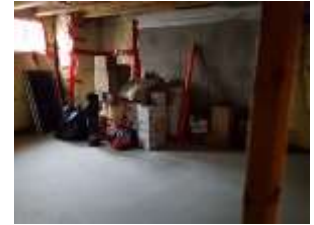
Pic. 28: Basement