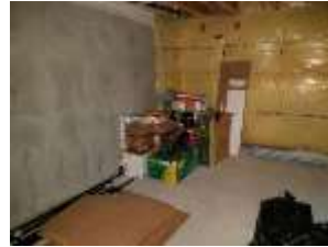
Pic. 27: Basement