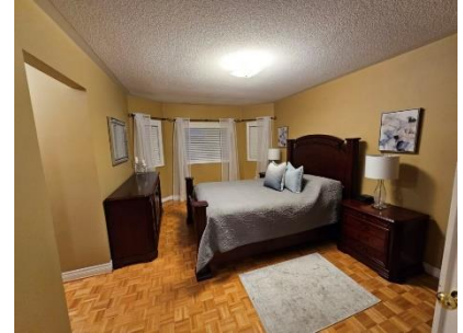
Pic. 6: Master bedroom