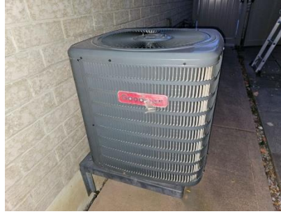
Pic. 2: AC unit 2018