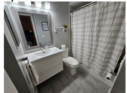
Pic. 12: 2 nd floor bath