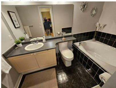
Pic. 7: Master bath