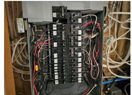
Pic. 24: 100 amp breaker panel