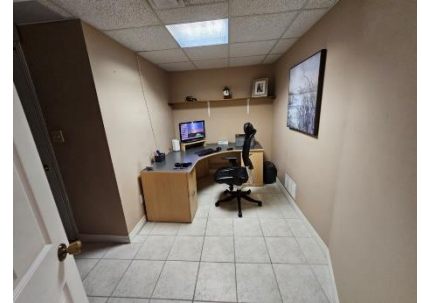
Pic. 21: Basement room