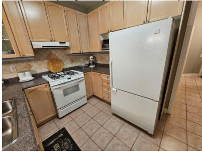
Pic. 16: Kitchen