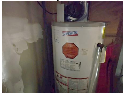
Pic. 23: Rental hot water tank 2010