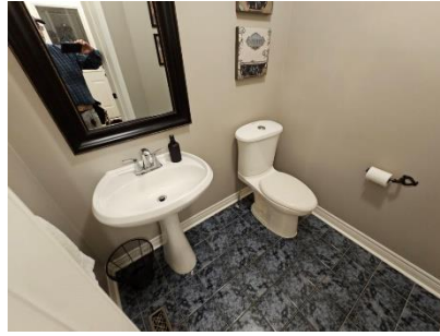
Pic. 17: Powder room