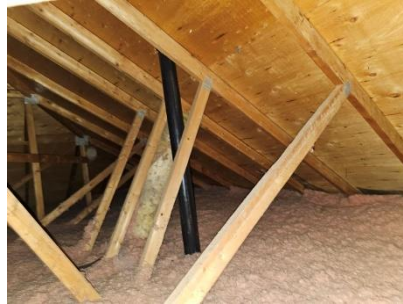
Pic. 5: Attic