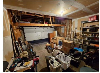
Pic. 18: Garage