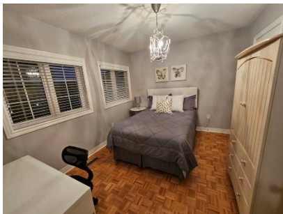
Pic. 10: Bedroom 2