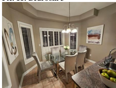
Pic. 14: Dining room