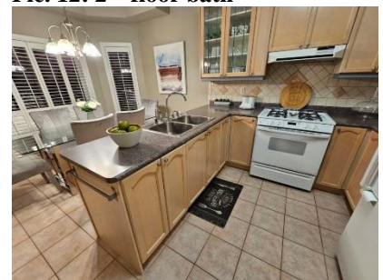
Pic. 15: Kitchen