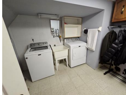
Pic. 20: Laundry