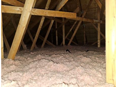
Pic. 4: Attic