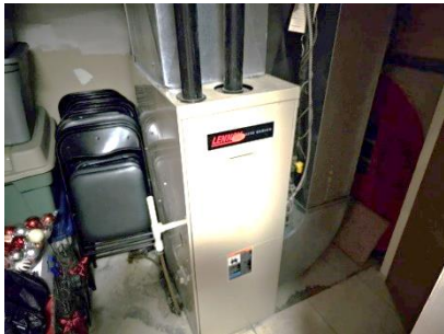
Pic. 22: Original gas furnace