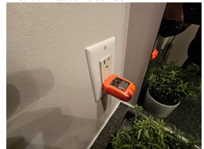
Pic. 9: GFCI outlet need to be replaced