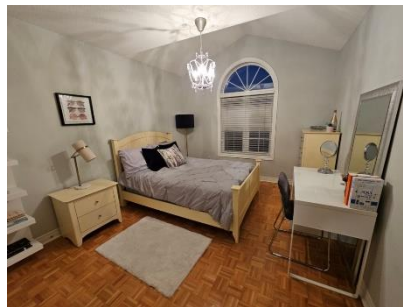
Pic. 11: Bedroom 3