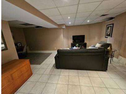
Pic. 19: Rec room