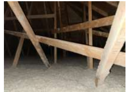
Pic. 12: Attic