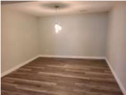
Pic. 37: Basement dining room