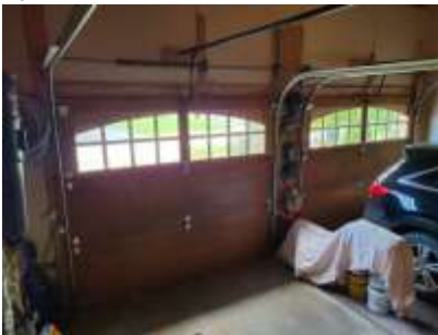
Pic. 10: Garage