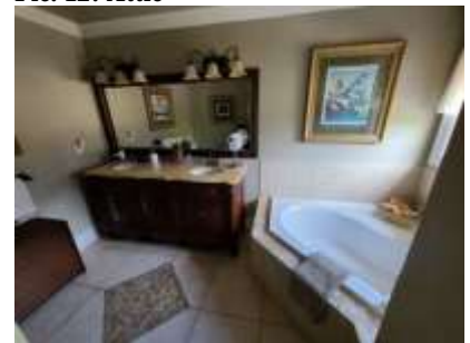
Pic. 15: Master bath