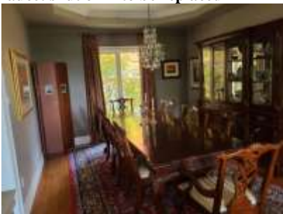
Pic. 25: Dining room