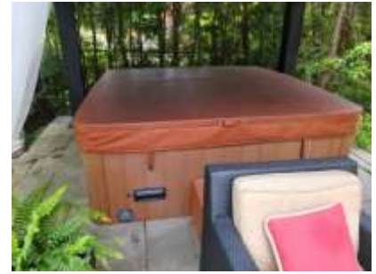
Pic. 6: Hot tub