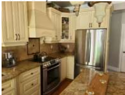
Pic. 29: Kitchen