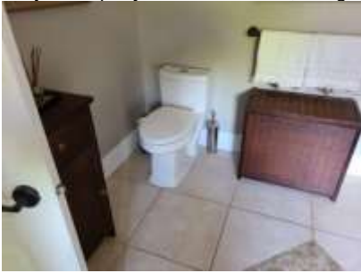
Pic. 16: Master bath