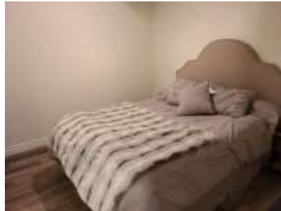
Pic. 38: Basement bedroom