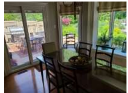
Pic. 27: Eating area