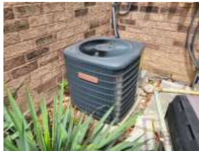
Pic. 8: AC 2014