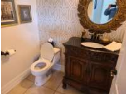
Pic. 31: Powder room