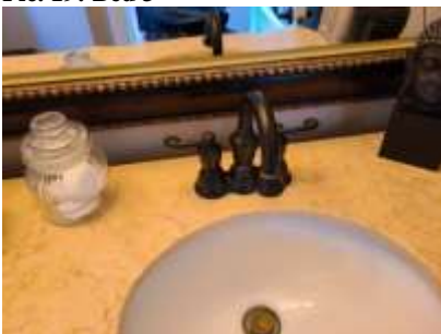
Pic. 22: 2 nd floor bath – right sink faucet shut off – to be replaced