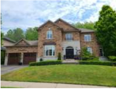
Pic. 1: Front view