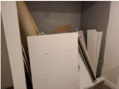
Pic. 40: Basement bath – needs to be completed