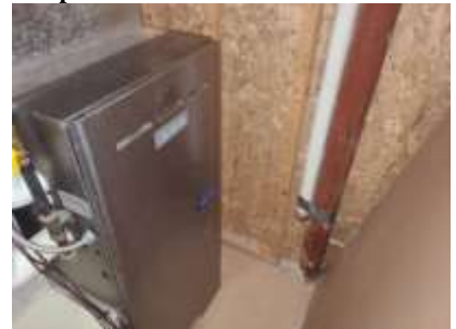
Pic. 42: Original gas furnace