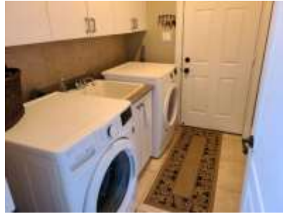
Pic. 32: Laundry