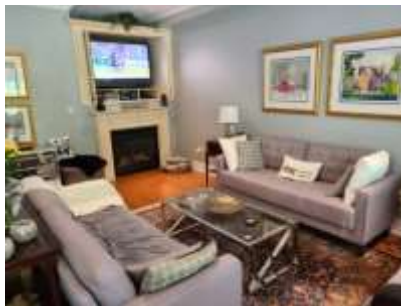
Pic. 26: Family room