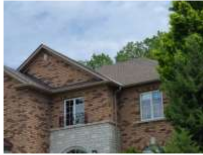
Pic. 2: Updated roof covering