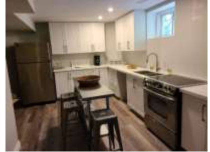
Pic. 36: Basement kitchen needs to be completed