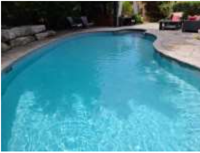
Pic. 4: Inground pool