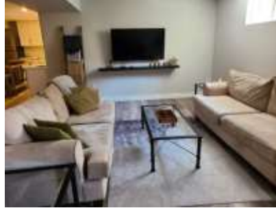
Pic. 35: Basement living room