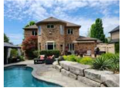
Pic. 3: Back view