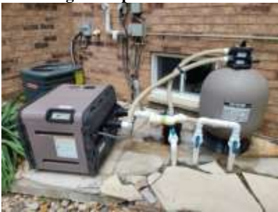
Pic. 7: Pool equipment – pool heater 2011