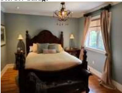
Pic. 13: Master bedroom