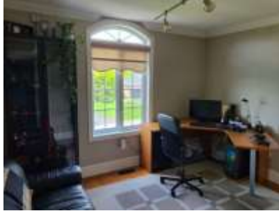
Pic. 20: Bed 4