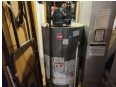
Pic. 41: Rental hot water tank