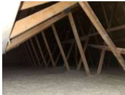
Pic. 11: Attic