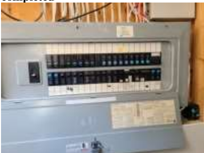
Pic. 43: 200 amp breaker panel