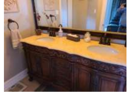
Pic. 21: 2 nd floor bath