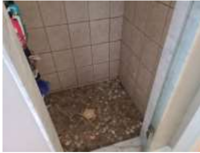
Pic. 17: Master bath