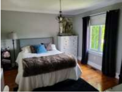
Pic. 19: Bed 3