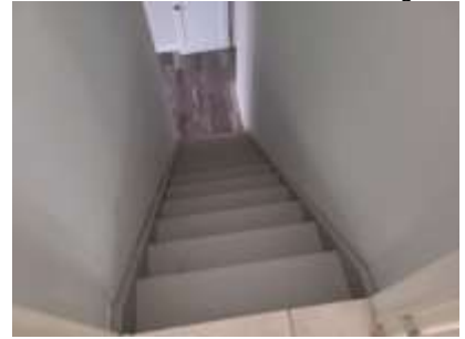
Pic. 33: Handrailing recommended for the basement stairwell for safety