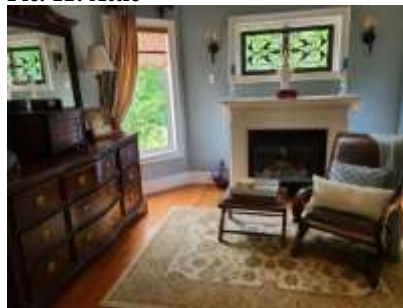
Pic. 14: Master bedroom