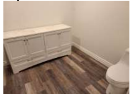
Pic. 39: Basement bath – needs to be completed