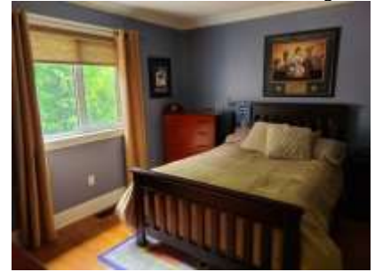
Pic. 18: Bed 2