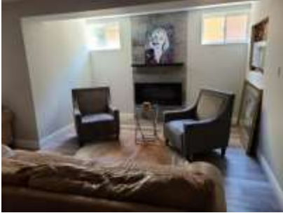
Pic. 34: Basement living room