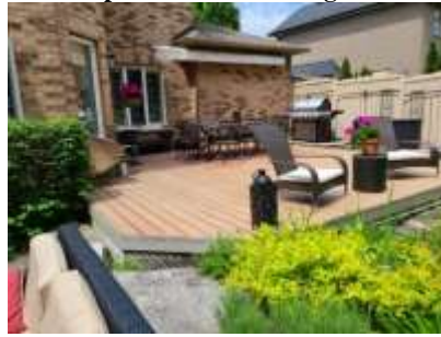
Pic. 5: Rear deck