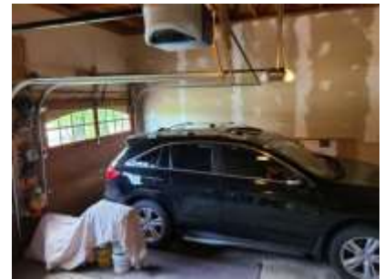
Pic. 9: Garage