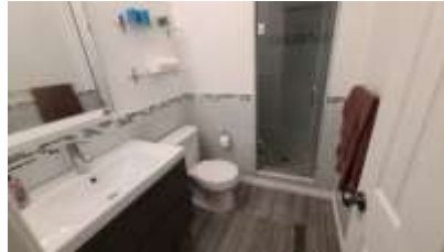
Pic. 8: 3 rd floor bath