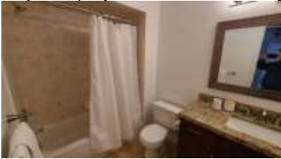
Pic. 19: Ensuite