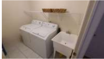
Pic. 20: Laundry