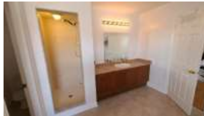
Pic. 11: Master bath