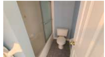
Pic. 15: Joint ensuite