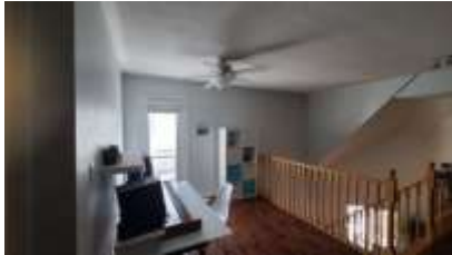
Pic. 7: Loft