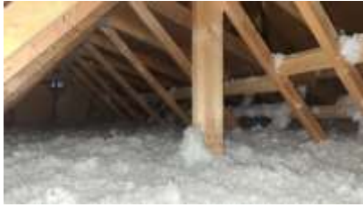
Pic. 4: Attic