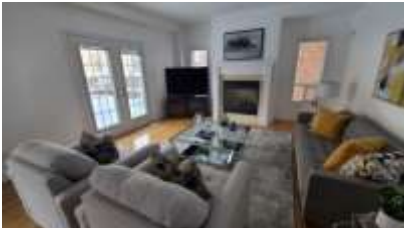
Pic. 25: Family room