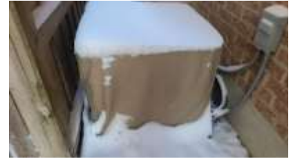
Pic. 3: Original AC unit. AC cover could not be removed