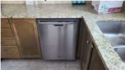
Pic. 28: Kitchen