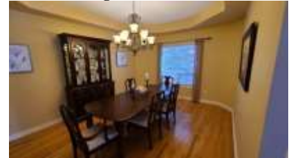
Pic. 24: Dining room