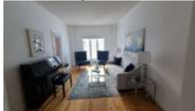
Pic. 23: Living room