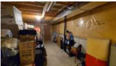
Pic. 34: Unfinished basement