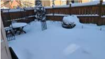
Pic. 22: Backyard – completely snow covered