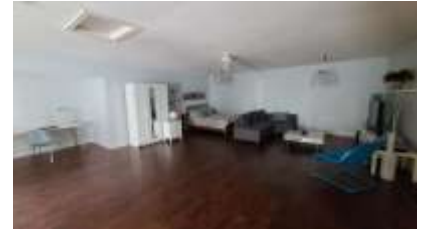
Pic. 6: Loft