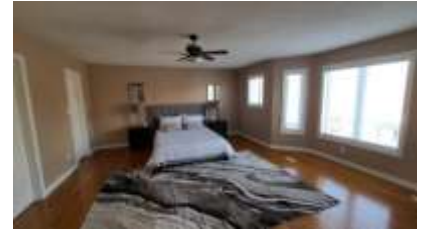
Pic. 9: Master bedroom