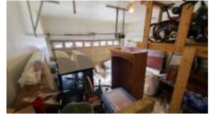
Pic. 21: Garage