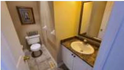
Pic. 31: Powder room