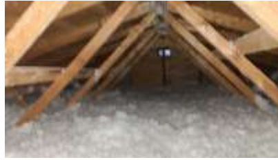
Pic. 5: Attic