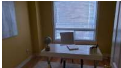
Pic. 32: Office