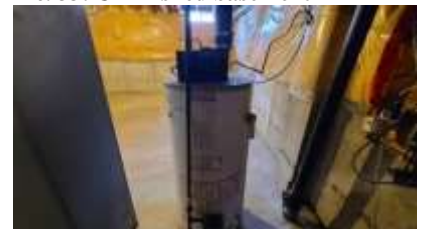
Pic. 36: Original hot water tank