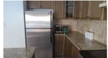
Pic. 30: Kitchen