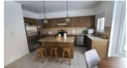
Pic. 27: Kitchen