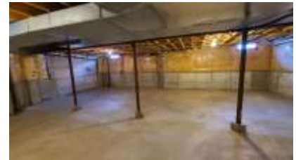
Pic. 33: Unfinished basement