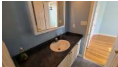
Pic. 14: Joint ensuite