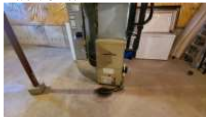
Pic. 35: Original gas furnace