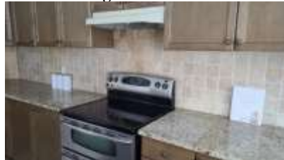
Pic. 29: Kitchen