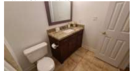
Pic. 18: Ensuite