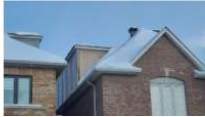
Pic. 2: Roof covering completely snow covered