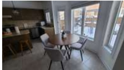
Pic. 26: Eating area