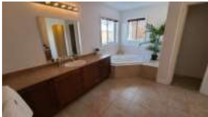
Pic. 10: Master bath