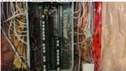
Pic. 37: 200 amp breaker panel