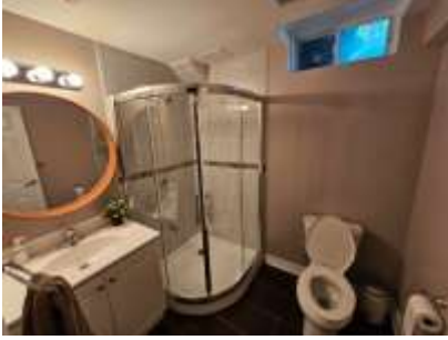
Pic. 31: Basement bath