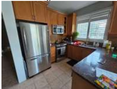
Pic. 23: Kitchen