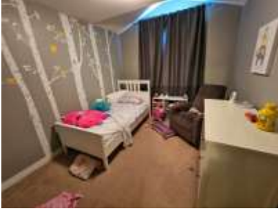
Pic. 16: Bedroom 4