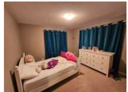
Pic. 15: Bedroom 3