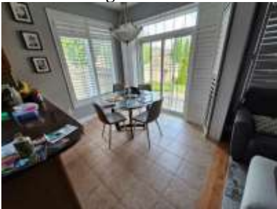
Pic. 22: Eating area