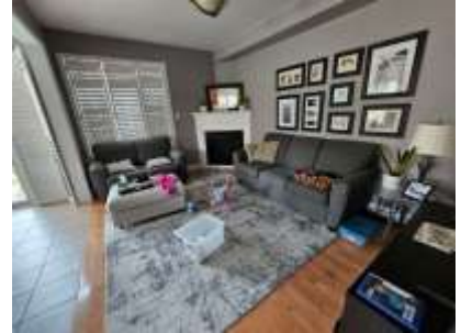
Pic. 21: Family room