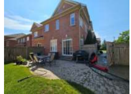
Pic. 6: Back view