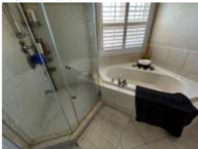
Pic. 13: Master bath