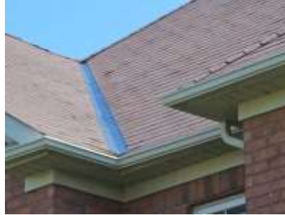
Pic. 2: Original roof covering