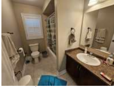
Pic. 17: 2 nd floor bathroom