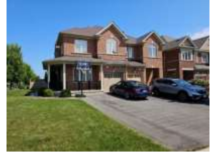
Pic. 3: Garage view