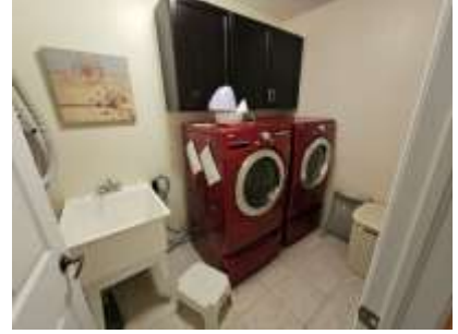
Pic. 18: Laundry