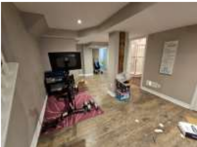
Pic. 28: Rec room