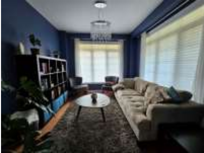
Pic. 19: Living room