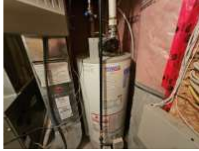
Pic. 32: Hot water tank 2009