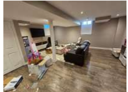
Pic. 27: Rec room