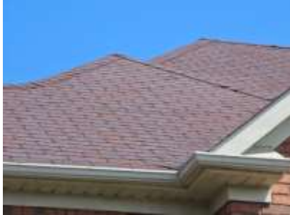
Pic. 4: Original roof covering