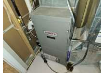
Pic. 33: Gas furnace 2009