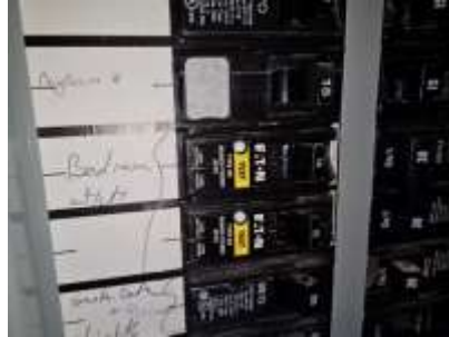
Pic. 35: ARCF breakers are defective and need to be replaced