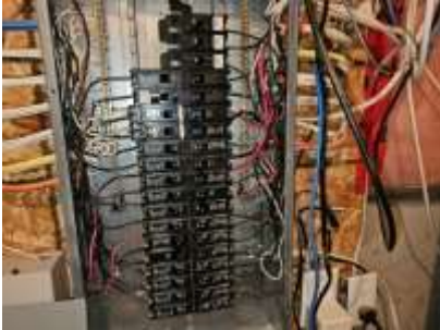
Pic. 34: 200 amp breaker panel