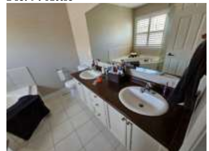
Pic. 12: Master bath