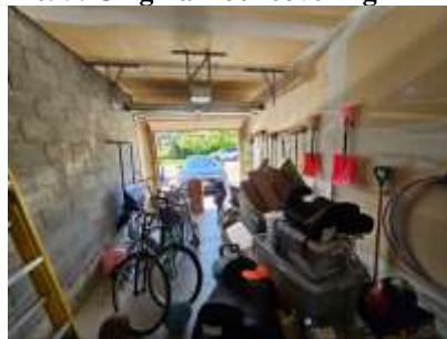
Pic. 8: Garage