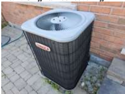
Pic. 7: AC unit 2009