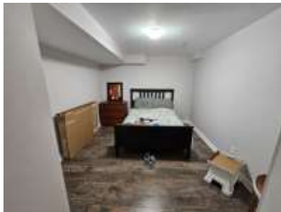
Pic. 29: Basement room