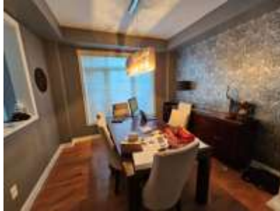
Pic. 20: Dining room