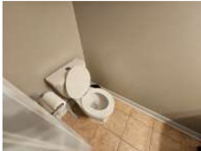
Pic. 26: Powder room