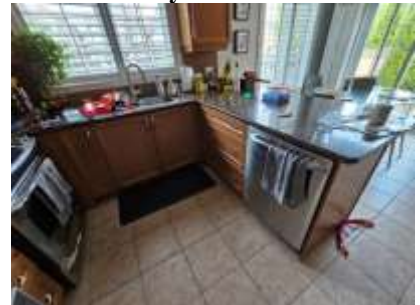
Pic. 24: Kitchen