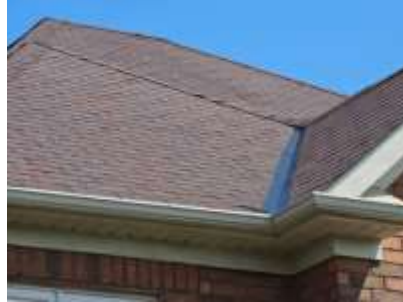
Pic. 5: Original roof covering