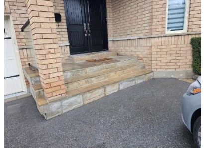
Pic. 4: Uneven rise on front steps