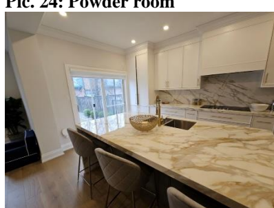
Pic. 27: Kitchen