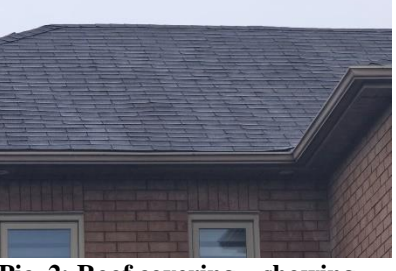
Pic. 2: Roof covering – showing some age