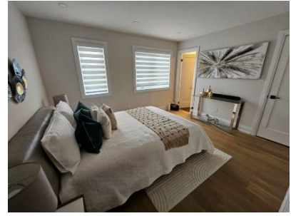
Pic. 19: Bedroom 5