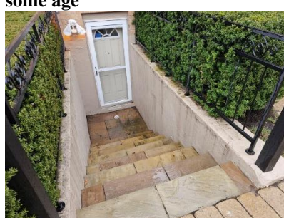
Pic. 6: Handrailing advised for exterior stairwell