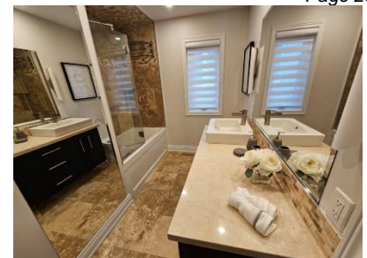
Pic. 18: 2<sup>nd</sup> floor bathroom