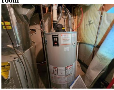
Pic. 38: Water heater 2012