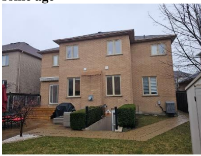
Pic. 5: Back view