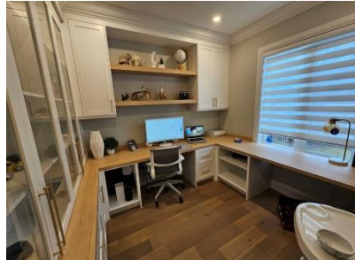
Pic. 29: Office