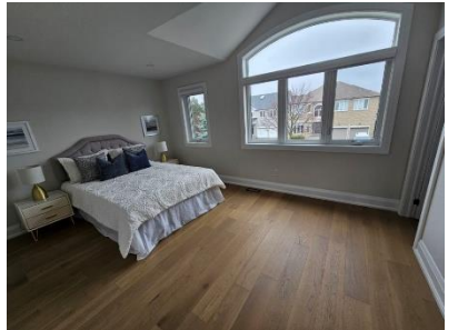
Pic. 17: Bedroom 3