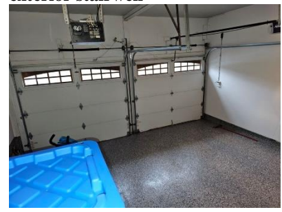
Pic. 9: Garage