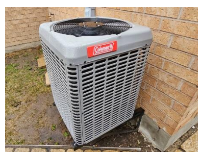
Pic. 8: AC unit 2020