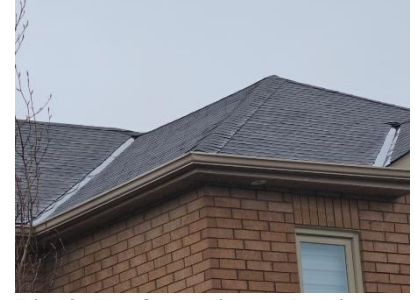
Pic. 3: Roof covering – showing some age