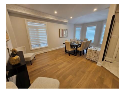
Pic. 22: Living / Dining room