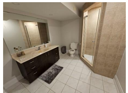
Pic. 37: Basement bathroom