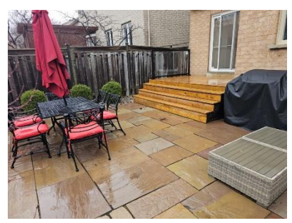
Pic. 7: Rear deck and patio