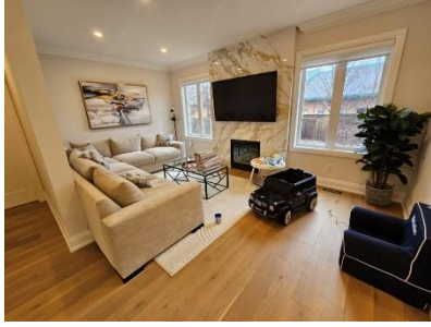
Pic. 23: Family room