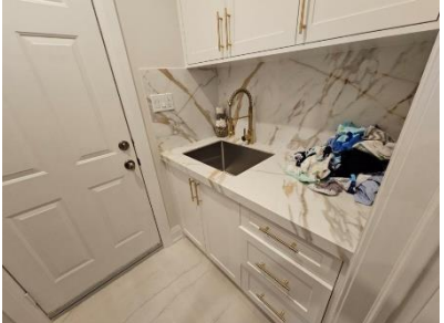
Pic. 30: Laundry