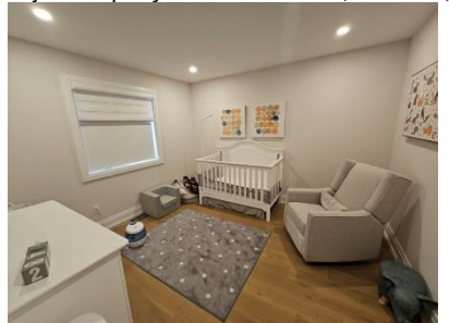
Pic. 16: Bedroom 2