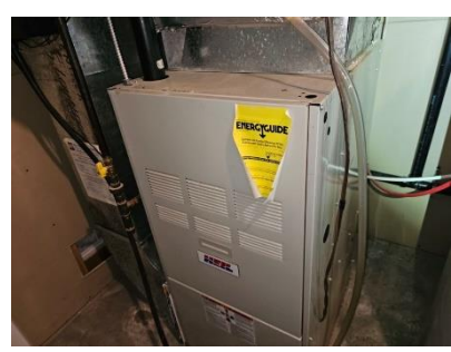
Pic. 39: Gas furnace 2000