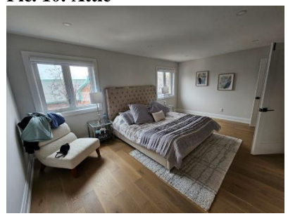
Pic. 13: Primary bedroom