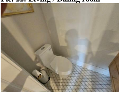
Pic. 25: Powder room