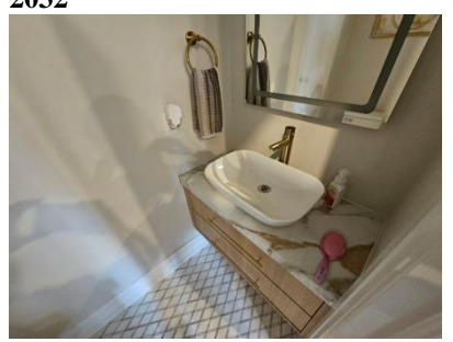
Pic. 24: Powder room