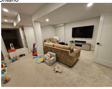
Pic. 32: Rec room