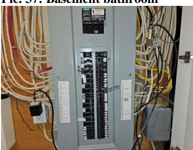
Pic. 40: 200 amp breaker panel