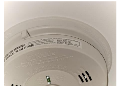
Pic. 21: Smoke detector expire 2032