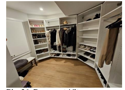
Pic. 36: Basement / Storage room