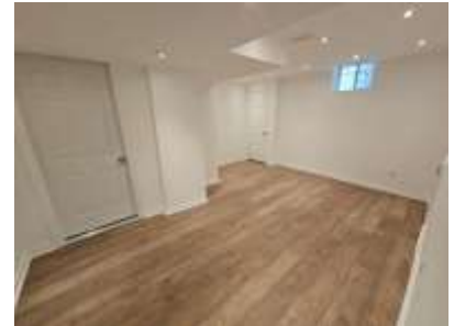
Pic. 39: Bedroom 5