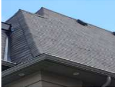
Pic. 2: Original roof covering