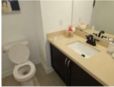
Pic. 32: Powder room