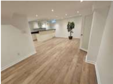
Pic. 37: Rec room