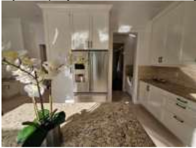
Pic. 31: Kitchen