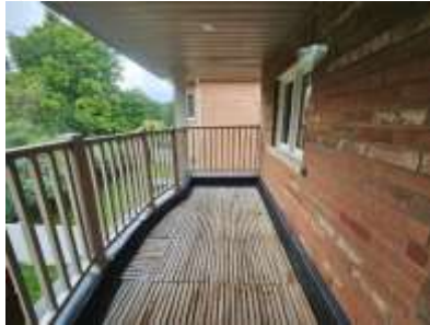
Pic. 17: Balcony