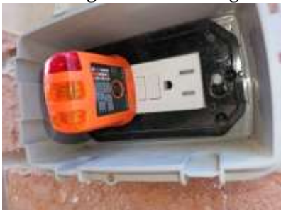
Pic. 7: Rear GFCI outlet won't reset