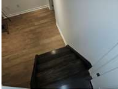
Pic. 35: Lower basement stairwell should have a handrailing