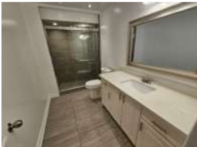
Pic. 40: Basement bathroom