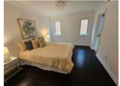
Pic. 18: Bedroom 2