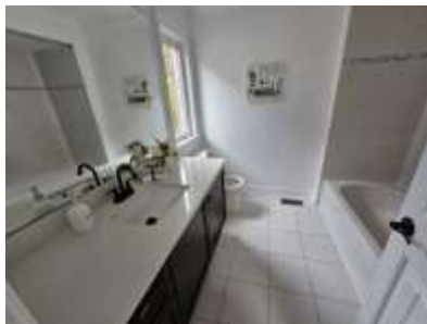
Pic. 23: Ensuite