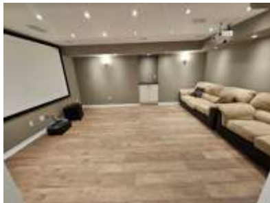
Pic. 41: Media room