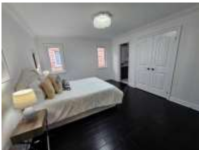
Pic. 22: Bedroom 4