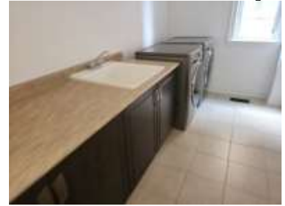
Pic. 33: Laundry