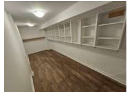
Pic. 42: Storage room