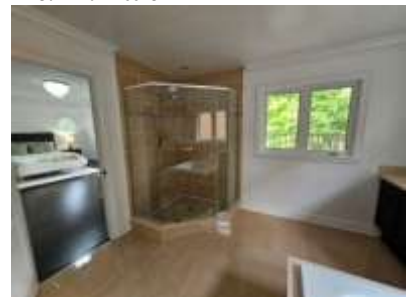
Pic. 15: Primary bathroom