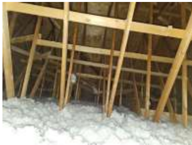
Pic. 11: Attic