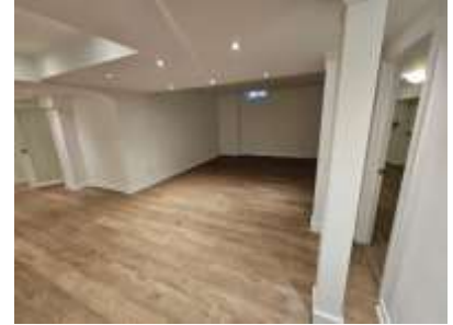
Pic. 36: Rec room