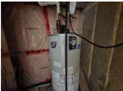
Pic. 43: Rental hot water tank 2012