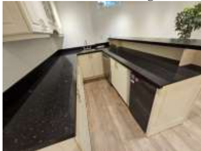
Pic. 38: Rec room