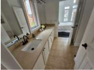
Pic. 19: Joint ensuite