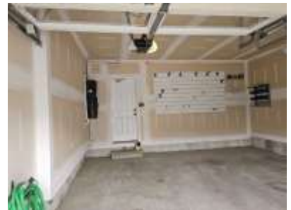
Pic. 9: Garage