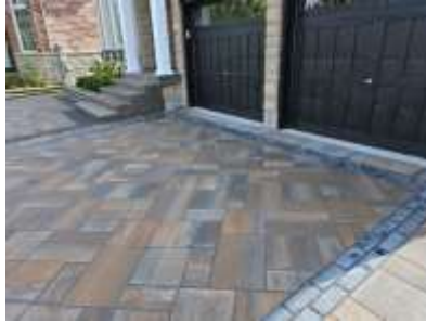
Pic. 5: Paver driveway