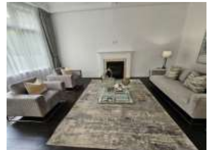
Pic. 27: Family room