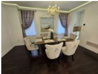
Pic. 26: Dining room