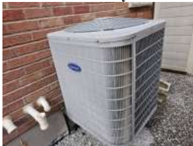
Pic. 8: AC compressor 2012