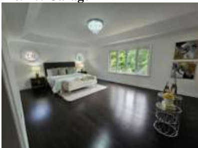
Pic. 13: Primary bedroom