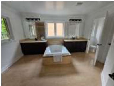
Pic. 14: Primary bathroom