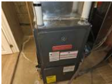
Pic. 44: Gas furnace 2012