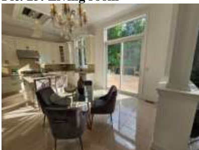
Pic. 28: Eating area