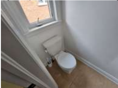
Pic. 16: Primary bathroom