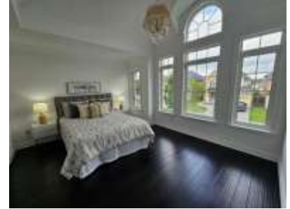
Pic. 21: Bedroom 3