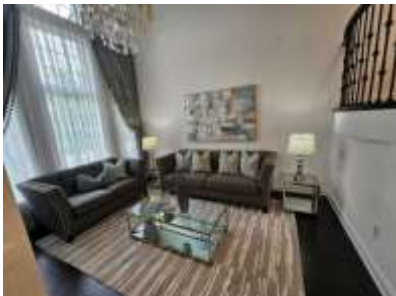
Pic. 25: Living room