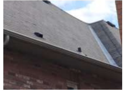
Pic. 3: Original roof covering