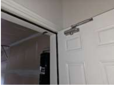
Pic. 34: Garage entry door auto closer disconnected