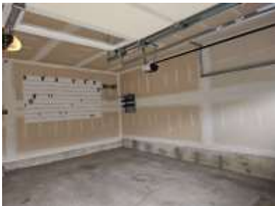
Pic. 10: Garage