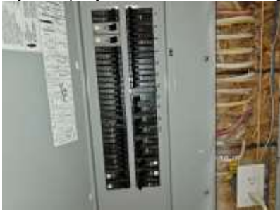
Pic. 46: 100 amp breaker panel