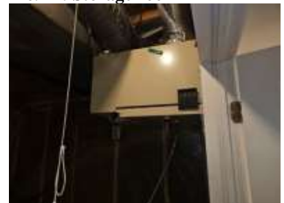
Pic. 45: HRV system