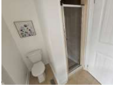
Pic. 20: Joint ensuite