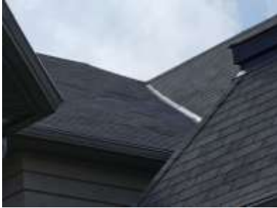
Pic. 4: Original roof covering