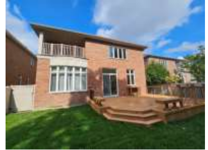
Pic. 6: Back view