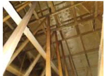
Pic. 12: Attic