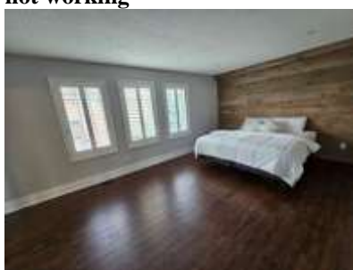
Pic. 9: Primary bedroom