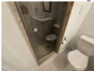
Pic. 30: Basement bathroom