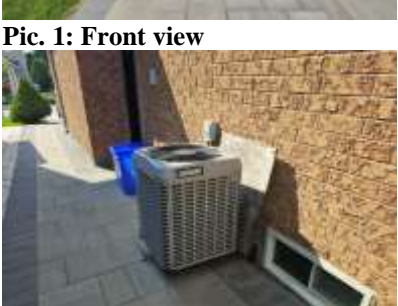
Pic. 4: AC compressor 2018