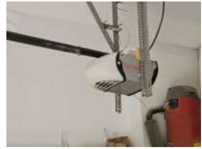
Pic. 6: East garage door opener not working