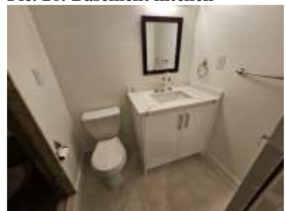
Pic. 29: Basement bathroom