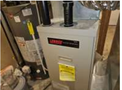
Pic. 32: Original gas furnace