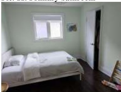
Pic. 14: Bedroom 4