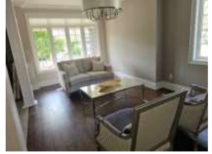
Pic. 16: Living room