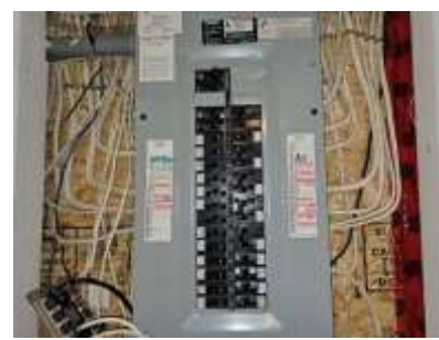
Pic. 35: 100 amp breaker panel