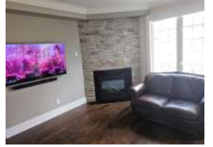
Pic. 17: Family room