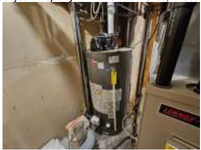
Pic. 31: Rental hot water tank 2019