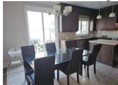
Pic. 18: Eating area