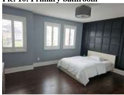
Pic. 13: Bedroom 3