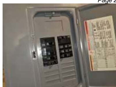
Pic. 33: Subpanel