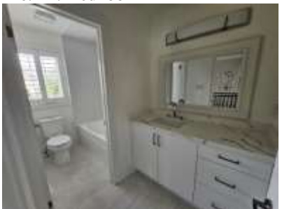
Pic. 15: 2<sup>nd</sup> floor bathroom