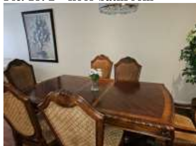
Pic. 21: Dining room