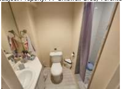
Pic. 31: Basement bathroom

Subject Property: 77 Chiswell Cres, Toronto, Ontario