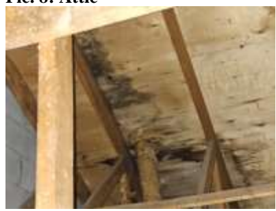
Pic. 11: Old water stains and apparent visible mould growth