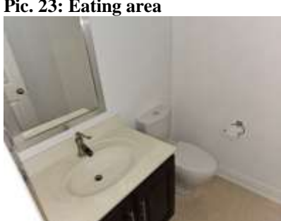
Pic. 26: Powder room