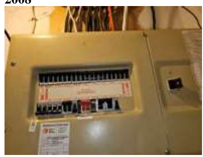
Pic. 35: 200 amp breaker panel