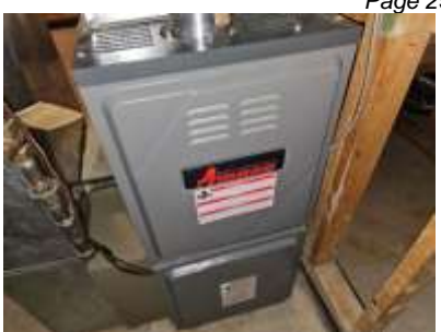
Pic. 33: Gas furnace 2008