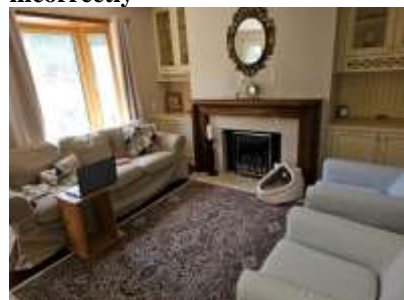
Pic. 22: Family room