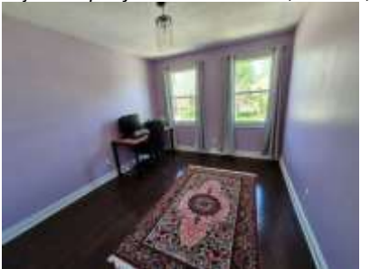
Pic. 16: Bedroom 3