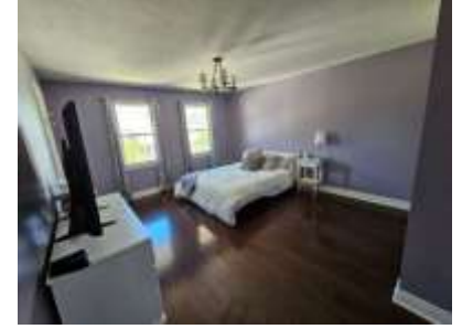
Pic. 17: Bedroom 4