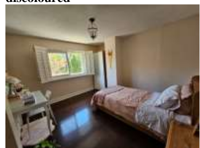
Pic. 15: Bedroom 2