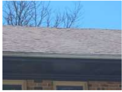
Pic. 2: Aging roof covering