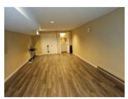
Pic. 28: Rec room