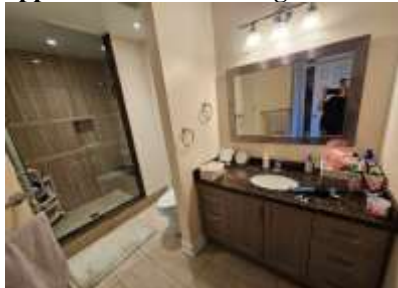
Pic. 14: Primary bathroom