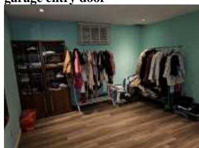
Pic. 30: Basement room