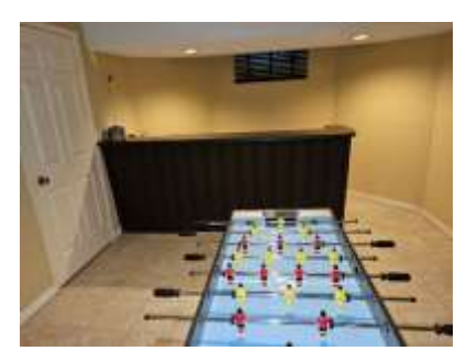
Pic. 29: Rec room