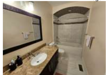
Pic. 18: 2<sup>nd</sup> floor bathroom