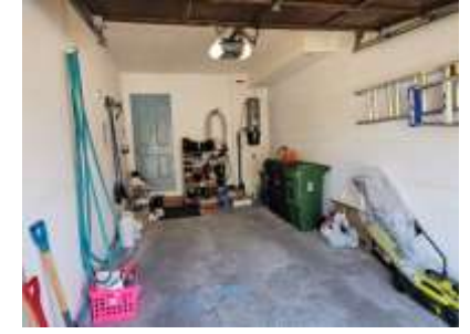
Pic. 4: Garage