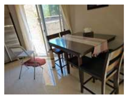
Pic. 23: Eating area