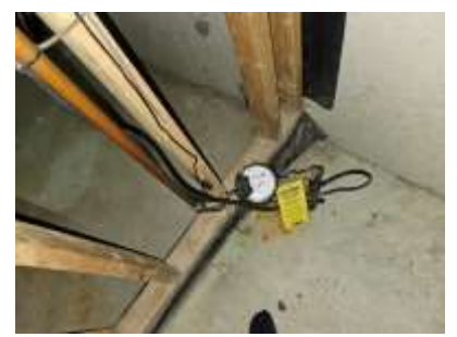
Pic. 34: Water main