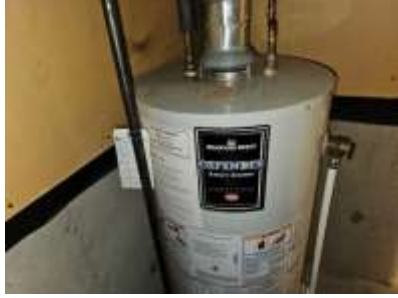
Pic. 32: Rental hot water tank 2008