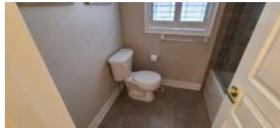
Pic. 20: 2nd floor bath