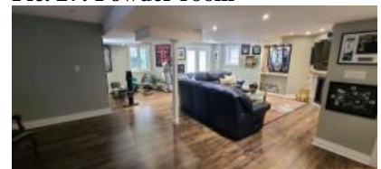
Pic. 30: Rec room