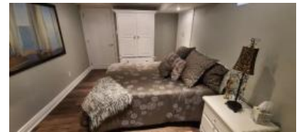
Pic. 33: Bedroom 5