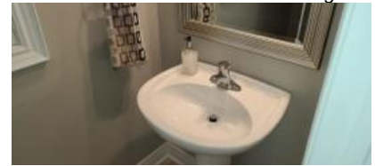
Pic. 27: Powder room