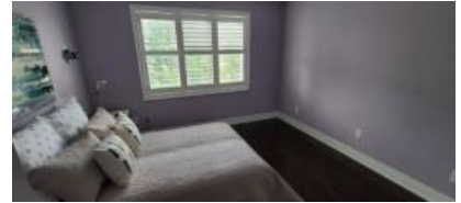
Pic. 18: Bedroom 4