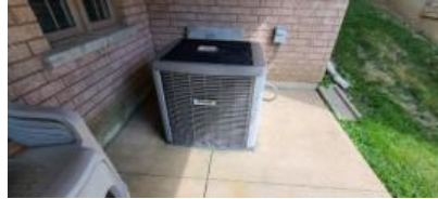
Pic. 8: AC unit 2007