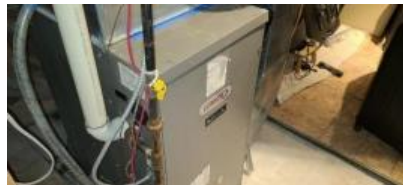
Pic. 35: Gas furnace 2007