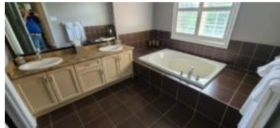
Pic. 14: Master bath