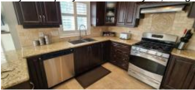
Pic. 25: Kitchen