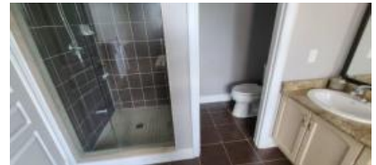
Pic. 15: Master bath