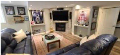
Pic. 31: Rec room