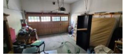
Pic. 9: Garage