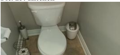
Pic. 28: Powder room