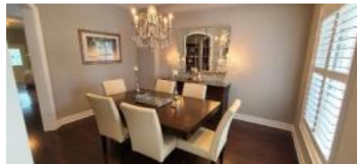
Pic. 23: Dining room