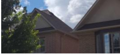
Pic. 4: Original roof covering