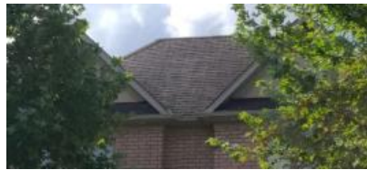
Pic. 2: Original roof covering