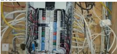
Pic. 37: 100-amp breaker panel