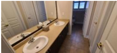
Pic. 19: 2nd floor bath