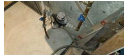
Pic. 36: Water main