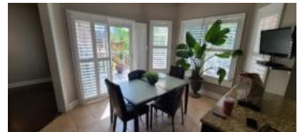
Pic. 24: Eating area