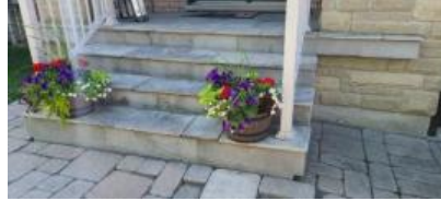
Pic. 5: Uneven rise on first step