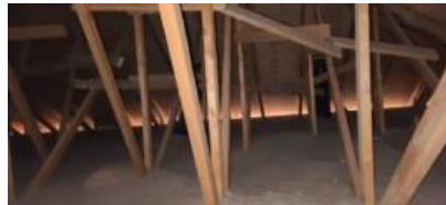
Pic. 11: Attic