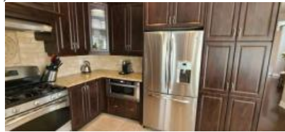
Pic. 26: Kitchen