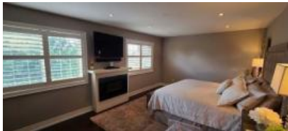
Pic. 13: Master bedroom