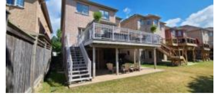
Pic. 6: Back view