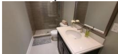
Pic. 32: Basement bath