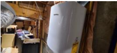
Pic. 34: Tankless hot water system 2011