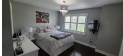
Pic. 17: Bedroom 3