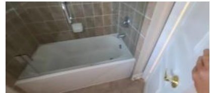
Pic. 21: 2nd floor bath