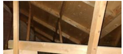
Pic. 12: Attic