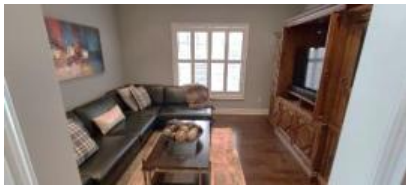
Pic. 22: Living room