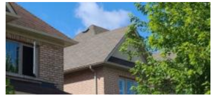
Pic. 3: Original roof covering