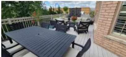
Pic. 10: Deck