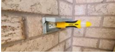
Pic. 7: Rear GFCI outlet no power and will not reset