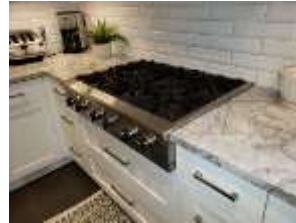
Pic. 27: Kitchen