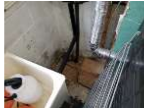
Pic. 35: Sump pump