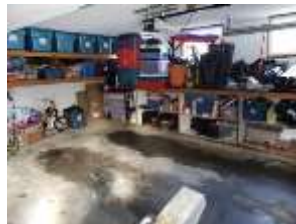
Pic. 11: Garage