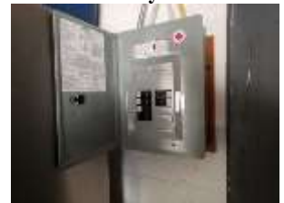
Pic. 12: Pony panel