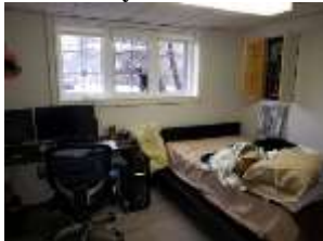
Pic. 33: Basement room #2