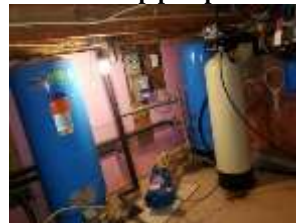
Pic. 39: Well pump equipment