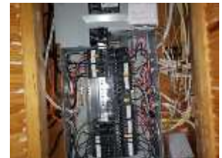
Pic. 40: 100 amp breaker panel with all copper wire