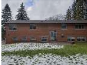
Pic. 6: Back view