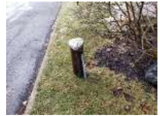
Pic. 4: Drilled well