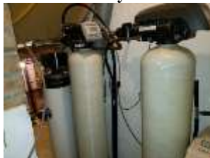
Pic. 38: Water filter system