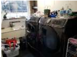
Pic. 34: Laundry