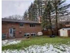
Pic. 7: Back view