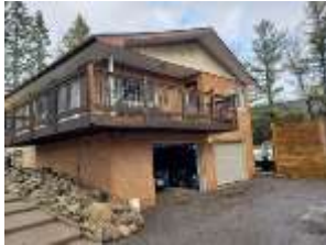
Pic. 5: Garage