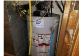
Pic. 36: Water heater