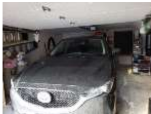
Pic. 10: Garage