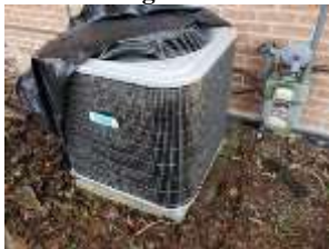
Pic. 9: AC unit 2017