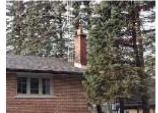
Pic. 8: Chimney