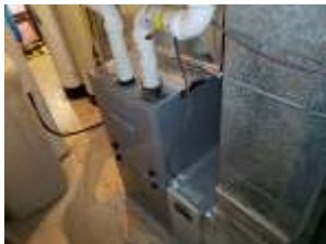
Pic. 37: Gas furnace 2018