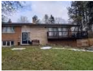
Pic. 2: Front view