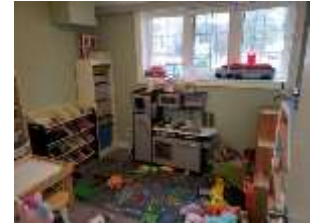
Pic. 32: Basement room #1