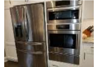
Pic. 28: Kitchen