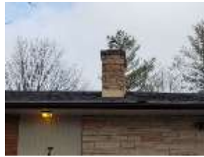
Pic. 3: Chimney