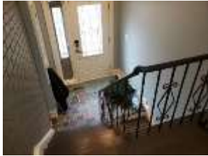
Pic. 29: Foyer