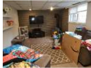
Pic. 31: Rec room