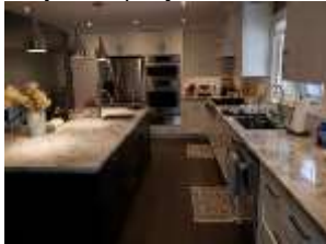
Pic. 25: Kitchen