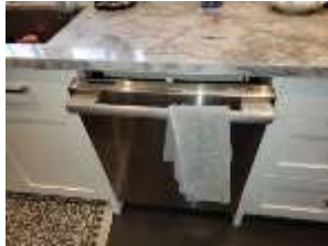
Pic. 26: Kitchen