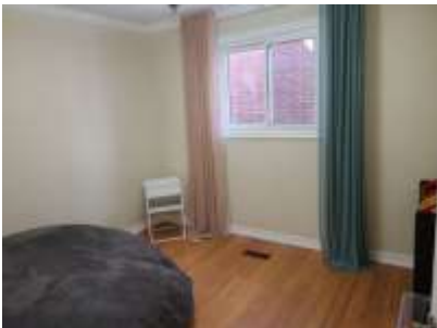
Pic. 25: Bed 4