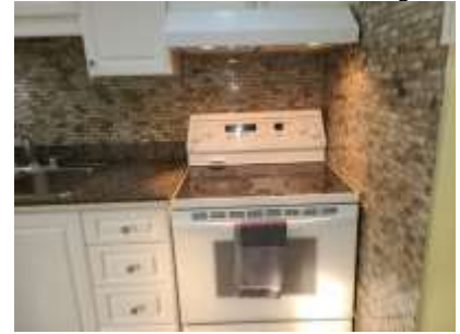
Pic. 18: Main kitchen