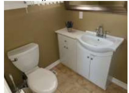
Pic. 9: Master bath