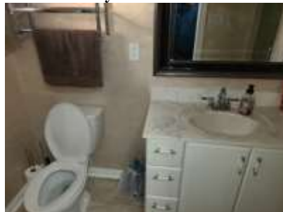
Pic. 26: Ground level bath