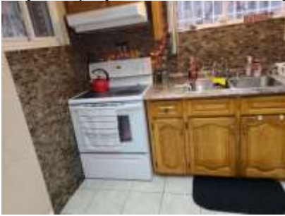
Pic. 31: Basement kitchen