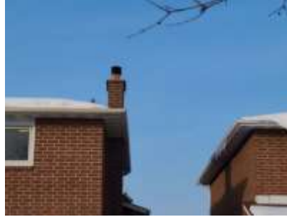
Pic. 5: Chimney