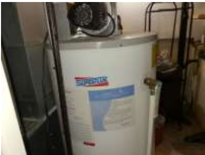
Pic. 37: Rental hot water tank