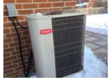
Pic. 3: Ac unit 2001