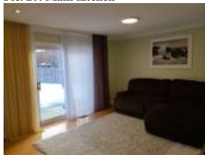
Pic. 23: Family room