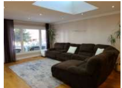
Pic. 15: Living room