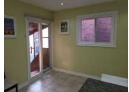
Pic. 21: Eating area