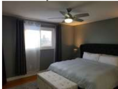
Pic. 8: Master bedroom