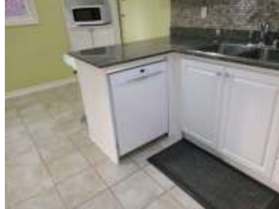
Pic. 20: Main kitchen