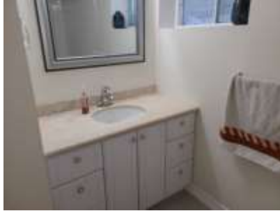
Pic. 35: Basement bath