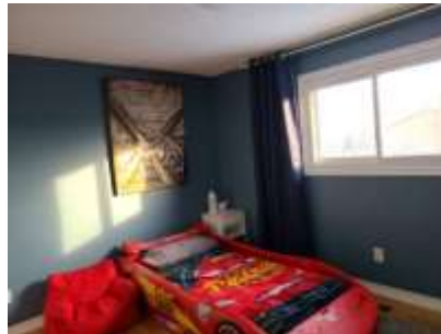
Pic. 11: Bed 2