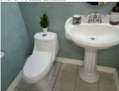
Pic. 22: Powder room