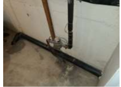
Pic. 36: Water main