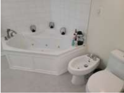
Pic. 34: Basement bath