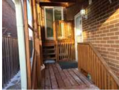
Pic. 2: Side deck