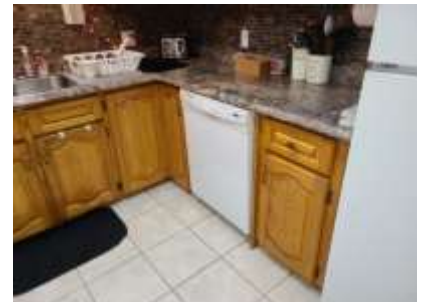
Pic. 30: Basement kitchen