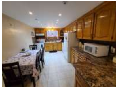
Pic. 29: Basement kitchen