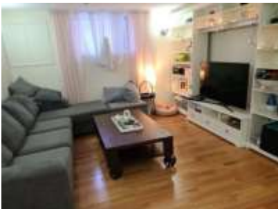
Pic. 28: Rec room