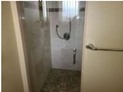
Pic. 10: Master bath