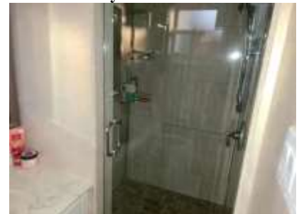
Pic. 27: Ground level bath