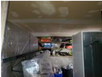
Pic. 7: Garage