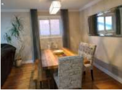
Pic. 16: Dining room