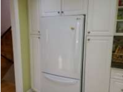
Pic. 19: Main kitchen