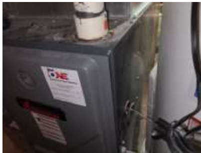
Pic. 38: Updated gas furnace