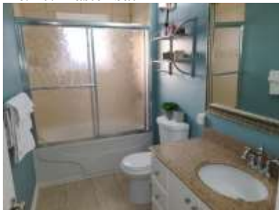
Pic. 13: 2nd floor bath