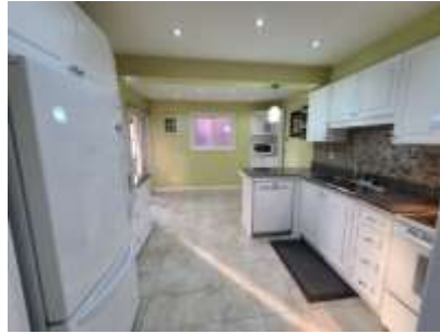
Pic. 17: Main kitchen