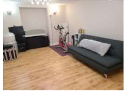
Pic. 33: Basement room