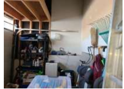
Pic. 6: Garage