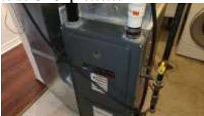
Pic. 31: Original gas furnace