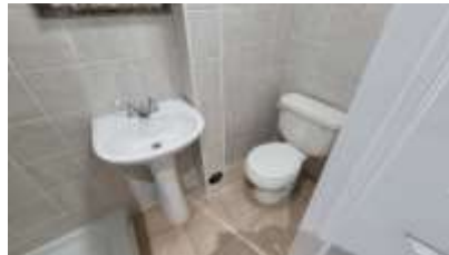
Pic. 26: Basement bathroom