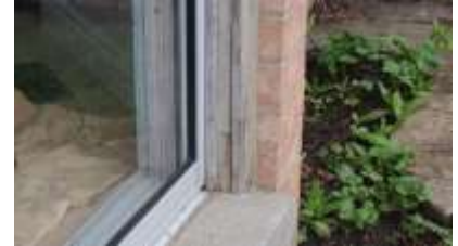
Pic. 6: Wood trim needs painting