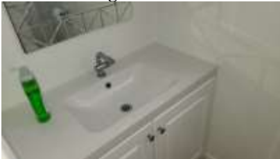
Pic. 22: Powder room