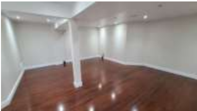
Pic. 25: Rec room