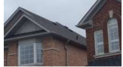
Pic. 3: Updated roof covering