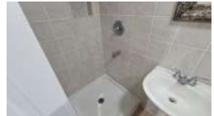
Pic. 27: Basement bathroom