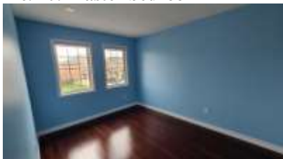
Pic. 13: Bed 2