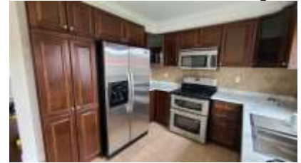
Pic. 21: Kitchen