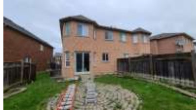
Pic. 5: Back view