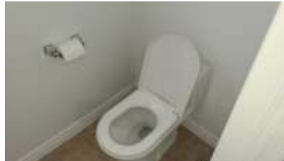
Pic. 23: Powder room