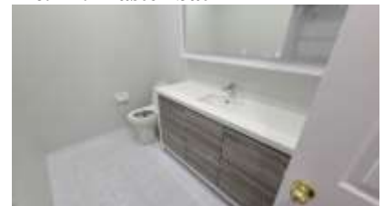
Pic. 15: 2 nd floor bath