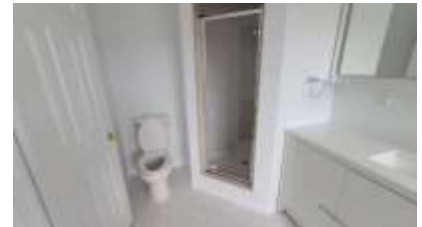
Pic. 12: Master bath