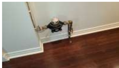
Pic. 32: Water main