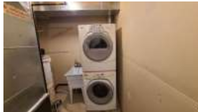
Pic. 29: Laundry