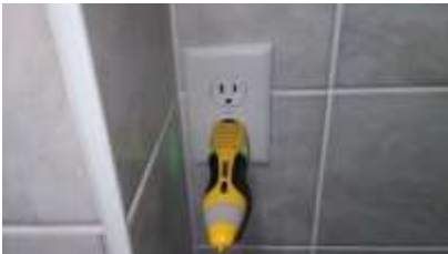
Pic. 28: Outlet in bathroom needs to be GFCI protected