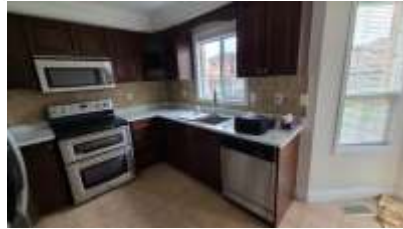
Pic. 20: Kitchen