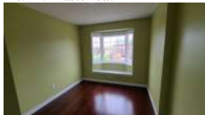
Pic. 14: Bed 3