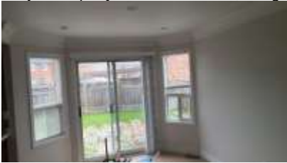
Pic. 19: Eating area