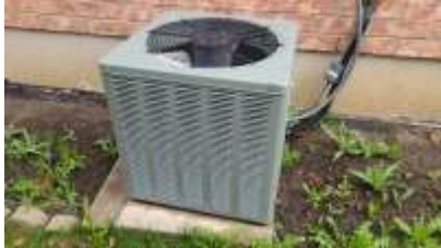
Pic. 4: AC unit 2010