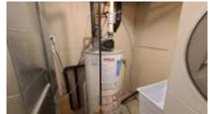
Pic. 30: Original water heater