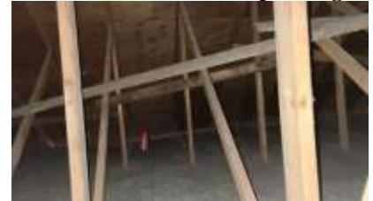
Pic. 9: Attic