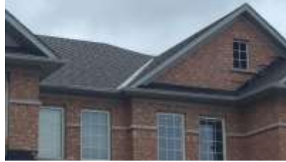
Pic. 2: Updated roof covering