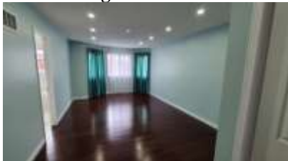
Pic. 10: Master bedroom