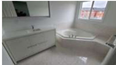
Pic. 11: Master bath