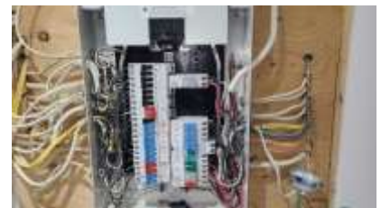
Pic. 33: 100 amp breaker panel