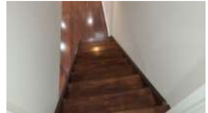
Pic. 24: Handrailing needed for basement stairwell