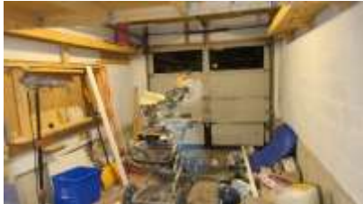
Pic. 7: Garage