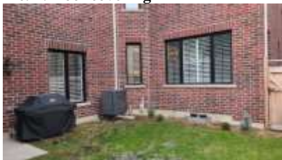
Pic. 7: Backyard