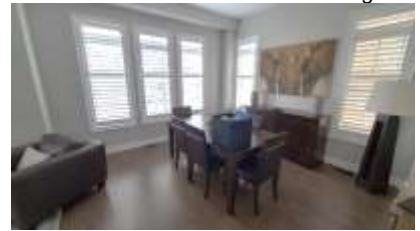
Pic. 21: Dining room