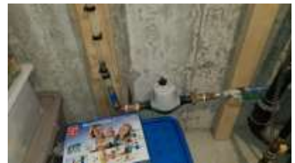
Pic. 36: Water main