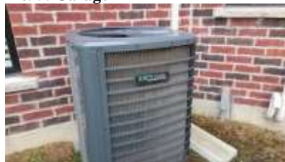
Pic. 8: AC unit