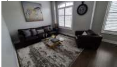
Pic. 20: Living room