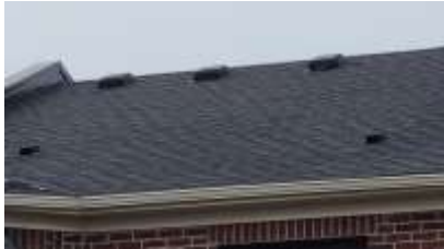
Pic. 4: Roof covering