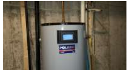
Pic. 33: Hot water tank