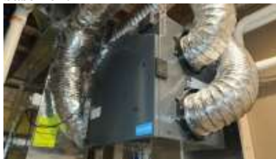
Pic. 35: HRV system