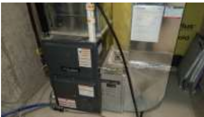
Pic. 34: Gas furnace