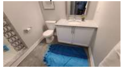
Pic. 30: Basement bath