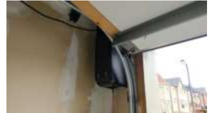
Pic. 6: Garage door opener