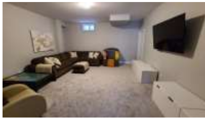
Pic. 29: Rec room