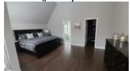
Pic. 9: Master bedroom