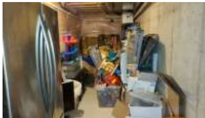
Pic. 32: Unfinished portion of the basement