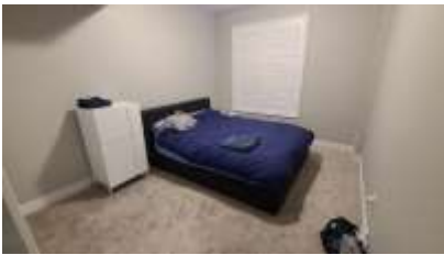
Pic. 28: Bed 5