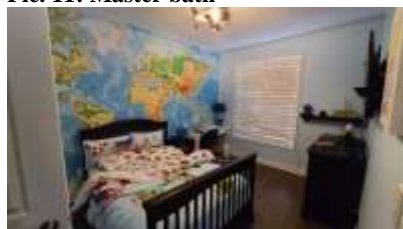
Pic. 14: Bed 3