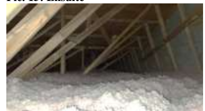
Pic. 18: Attic