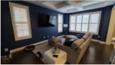
Pic. 22: Family room