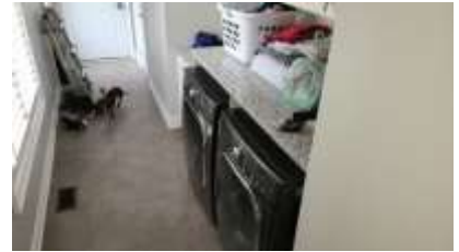
Pic. 27: Laundry