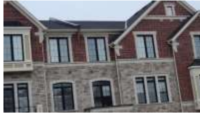
Pic. 2: Front view and roof covering