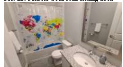
Pic. 15: Ensuite