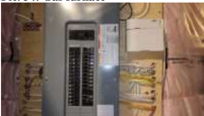
Pic. 37: 200 amp breaker panel