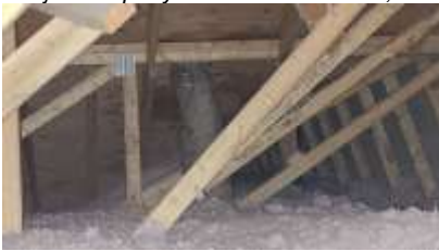
Pic. 19: Attic