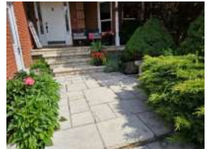
Pic. 9: front porch – railings advised