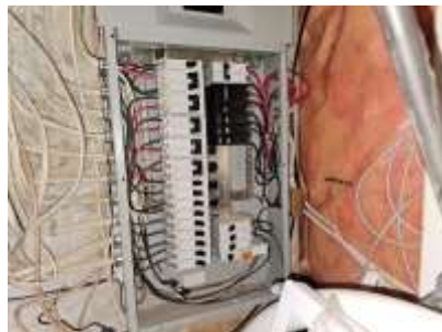
Pic. 41: 200 amp breaker panel