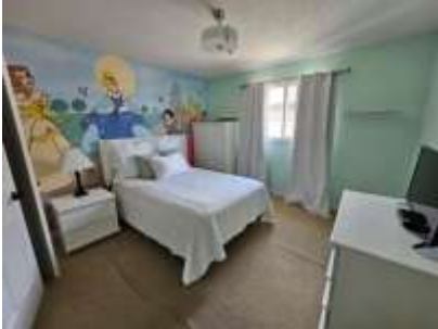
Pic. 16: Bedroom 3