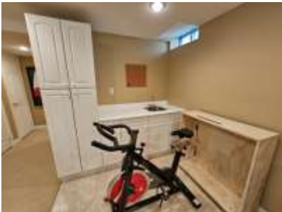
Pic. 34: Rec room