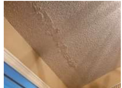
Pic. 21: Repaired ceiling in master closet – no active moisture