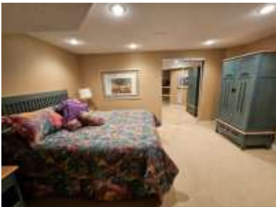
Pic. 37: Bedroom 5 / Basement room