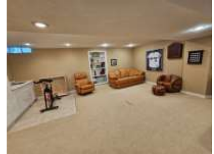
Pic. 33: Rec room