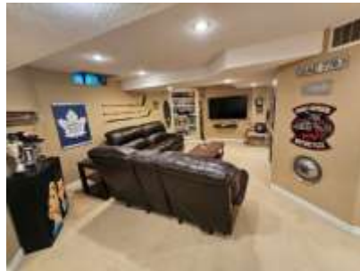
Pic. 35: Rec room