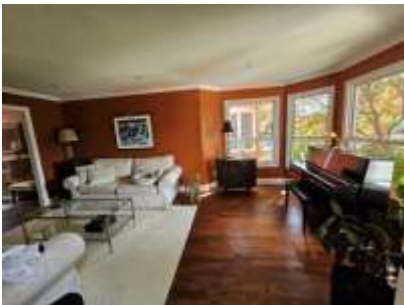
Pic. 22: Living room