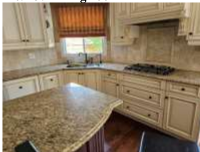
Pic. 26: Kitchen