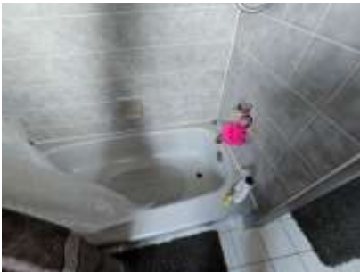
Pic. 19: 2 nd floor bath