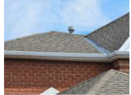
Pic. 3: Updated roof covering