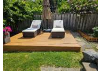
Pic. 6: Deck