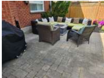
Pic. 8: Patio