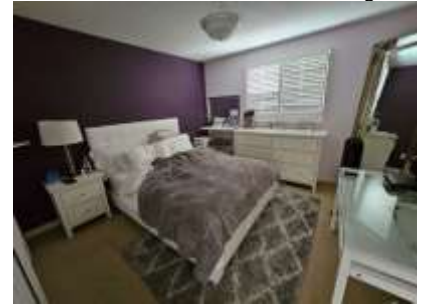
Pic. 15: Bedroom 2