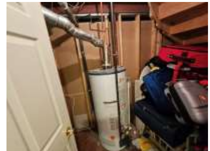
Pic. 39: Rental hot water tank 2007