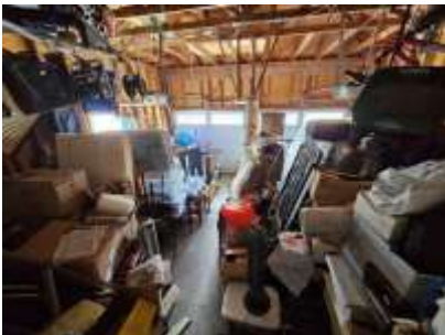
Pic. 10: Garage