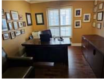
Pic. 29: Office