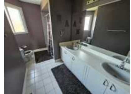
Pic. 18: 2 nd floor bath