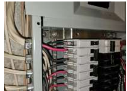
Pic. 42: 1 breaker double tapped