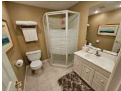
Pic. 38: Basement bath