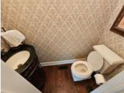
Pic. 31: Powder room