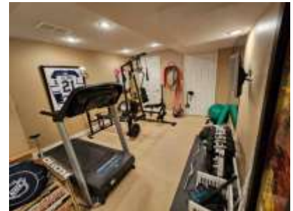
Pic. 36: Rec room