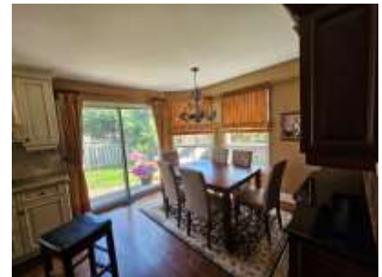
Pic. 24: Eating area