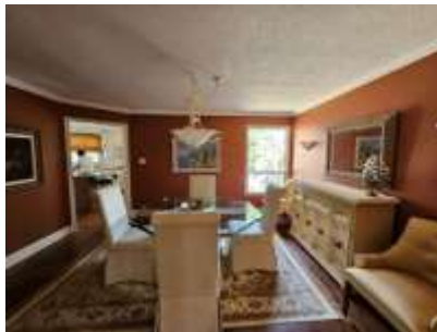
Pic. 23: Dining room