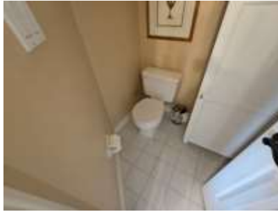
Pic. 14: Master bath