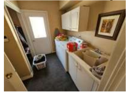
Pic. 30: Laundry