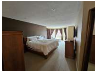
Pic. 11: Master bedroom