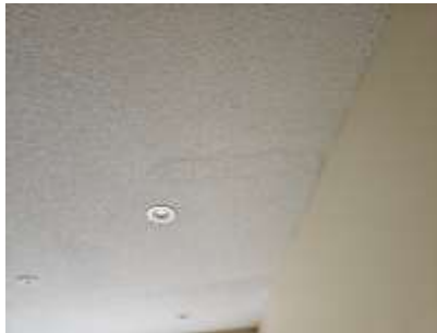
Pic. 20: Repaired ceiling in stairwell – no active moisture