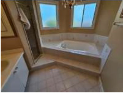
Pic. 13: Master bath