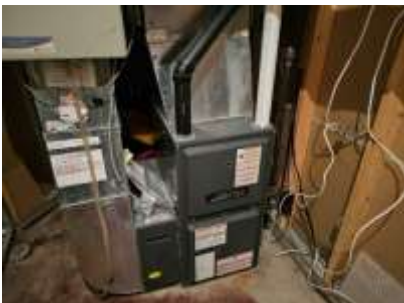
Pic. 40: Gas furnace 2015