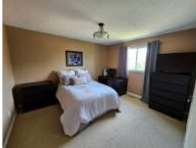
Pic. 17: Bedroom 4