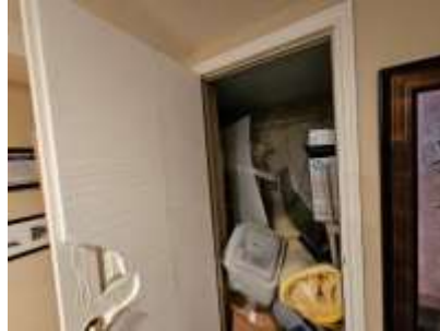
Pic. 32: Cold room – incorrect door