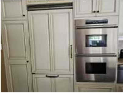
Pic. 28: Kitchen