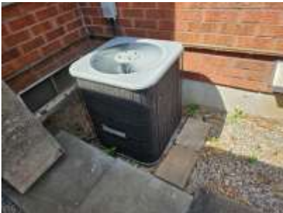
Pic. 7: AC unit 2010