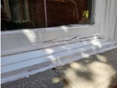
Pic. 4: Damaged wooden window frame