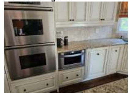
Pic. 27: Kitchen