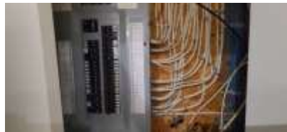
32: 100 amp breaker panel