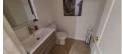
27: Basement bath