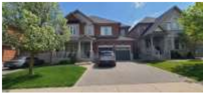
1: Front view