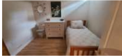
26: Bedroom 5