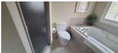
10: Master bath