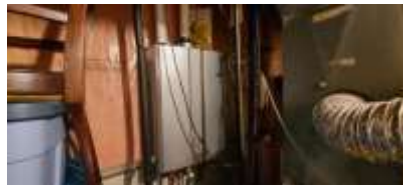
29: Tankless boiler 2021