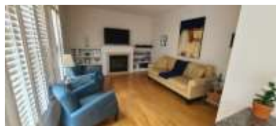
17: Family room