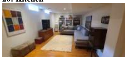
23: Rec room