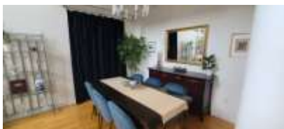
16: Dining room