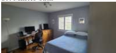
13: Bedroom 4