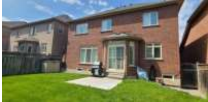
4: Back view