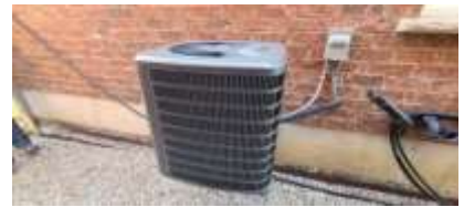
3: AC unit 2017