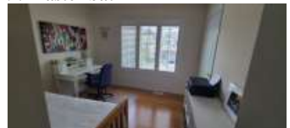
12: Bedroom 3