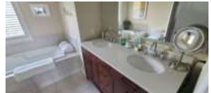
9: Master bath