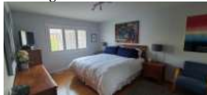
8: Master bedroom