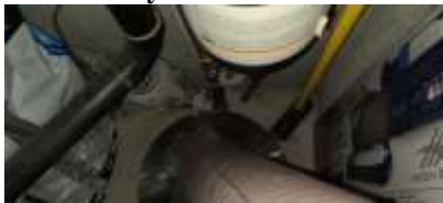
31: Water main