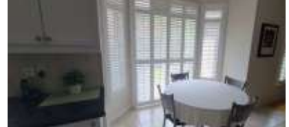
18: Eating area