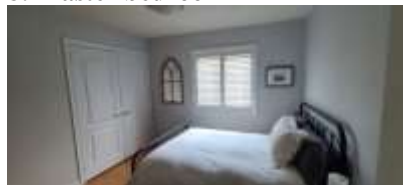
11: Bedroom 2