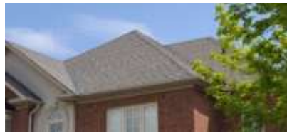
2: Updated roof covering