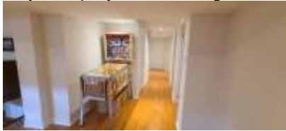
25: Rec room