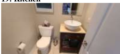
22: Powder room